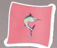
Garnet Red Marlin