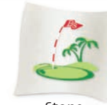
Stone Golf Green