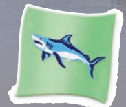
Sea Green Shark