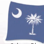
Colony Blue Palmetto