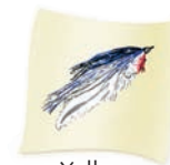
Yellow Saltwater Flies