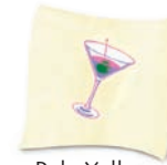
Pale Yellow Martini