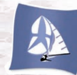
Colony Blue Sailboats