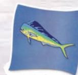
Stormy Blue Dorado