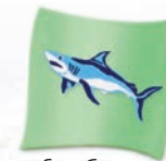
Sea Green Shark