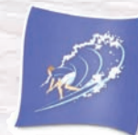
Argus Blue Surfer