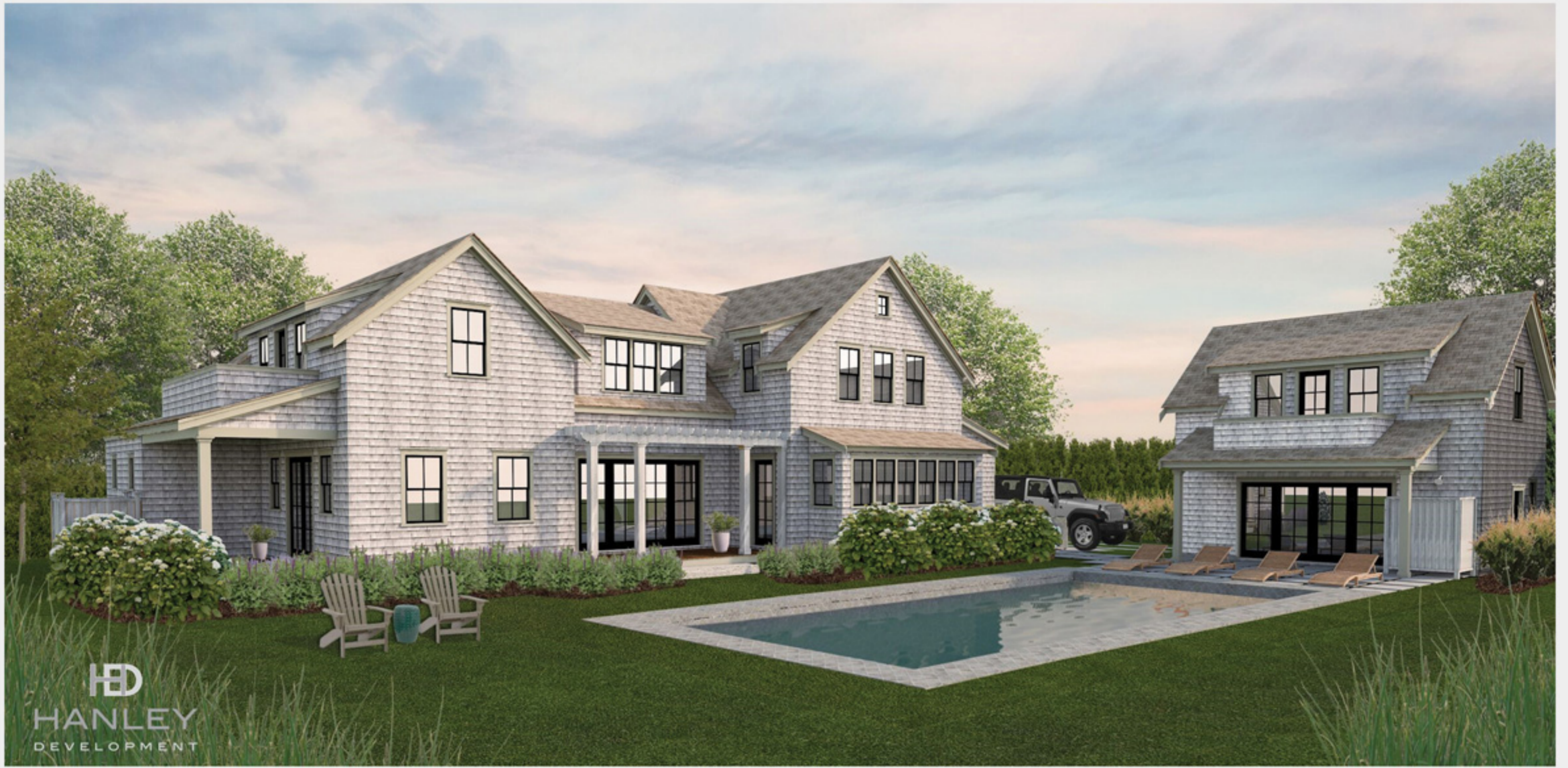
CLIFF 4 Pilgrim Court