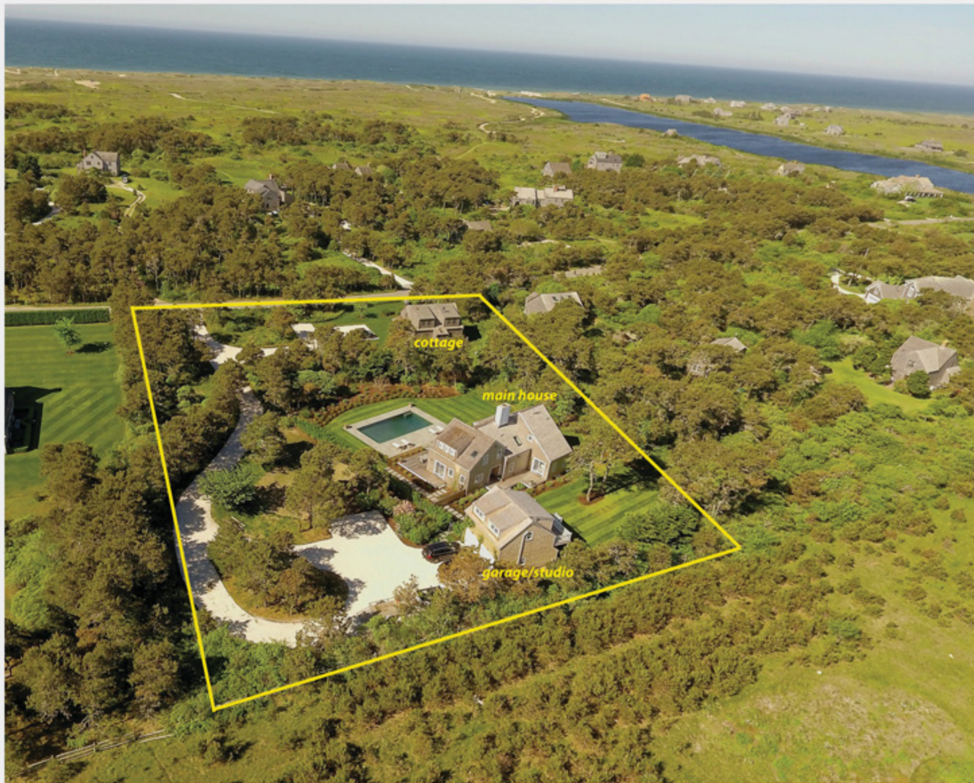
MIACOMET 12 Pond View Drive