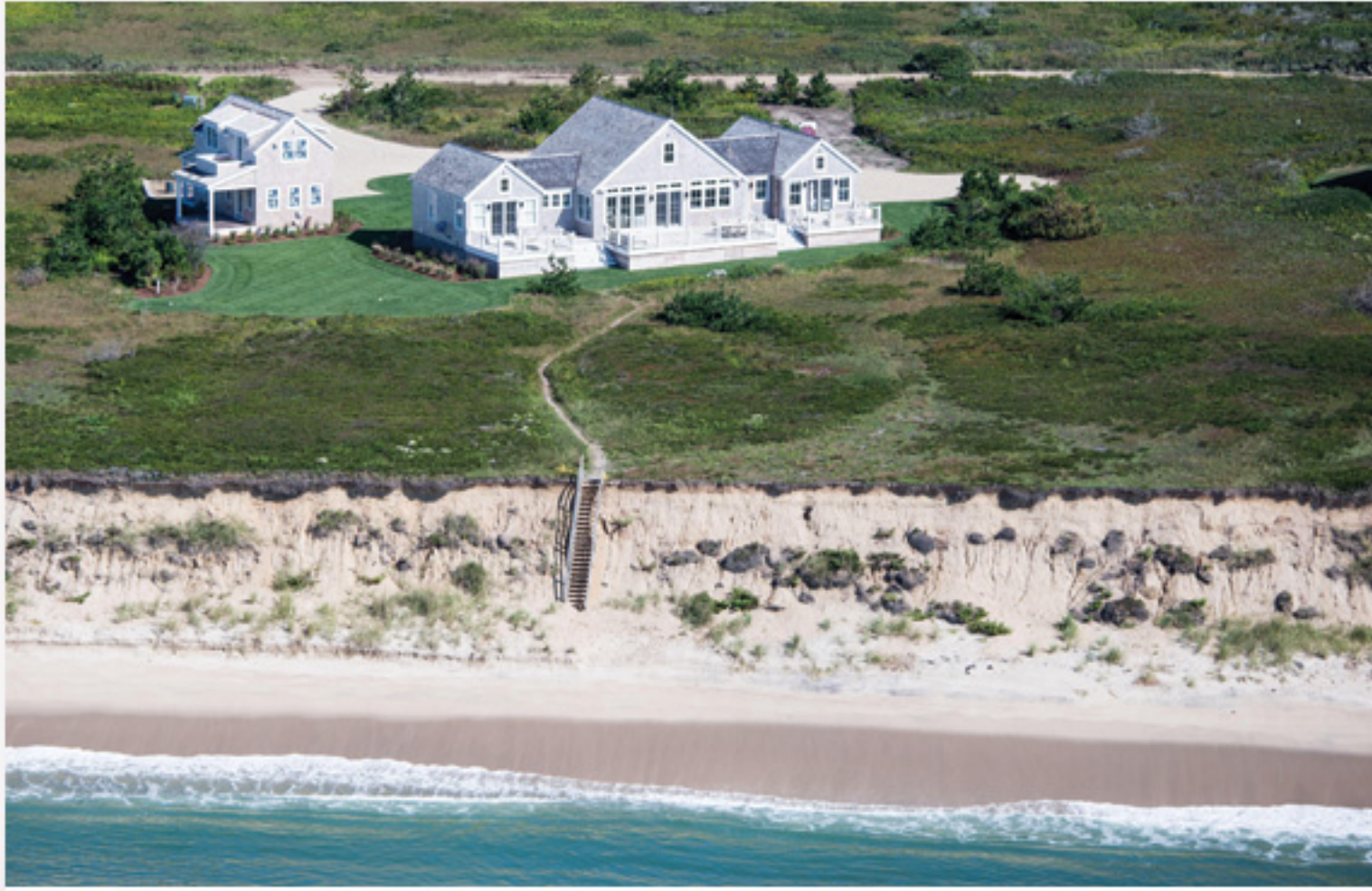
MADEQUECHAM 18 MADEQUECHAM VALLEY RD 5 Bed/3 bath 2 half Weekly Rental: $15,000 - $30,000