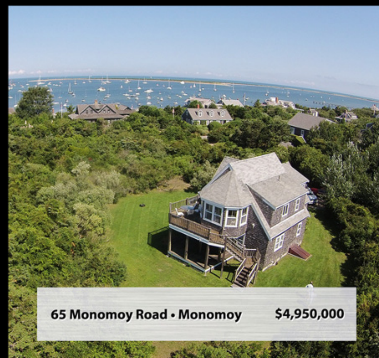
65 Monomoy Road • Monomoy $4,950,000