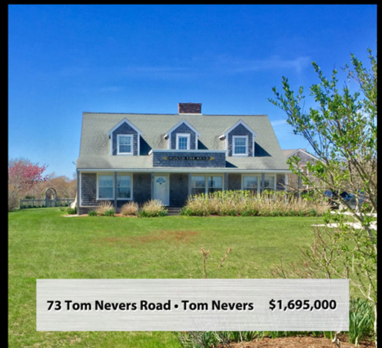
73 Tom Nevers Road • Tom Nevers $1,695,000