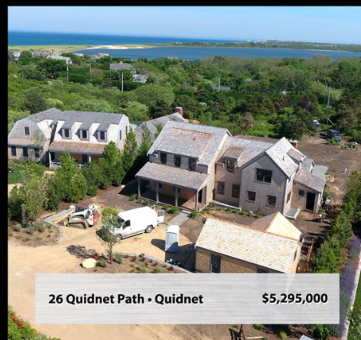
26 Quidnet Path • Quidnet $5,295,000