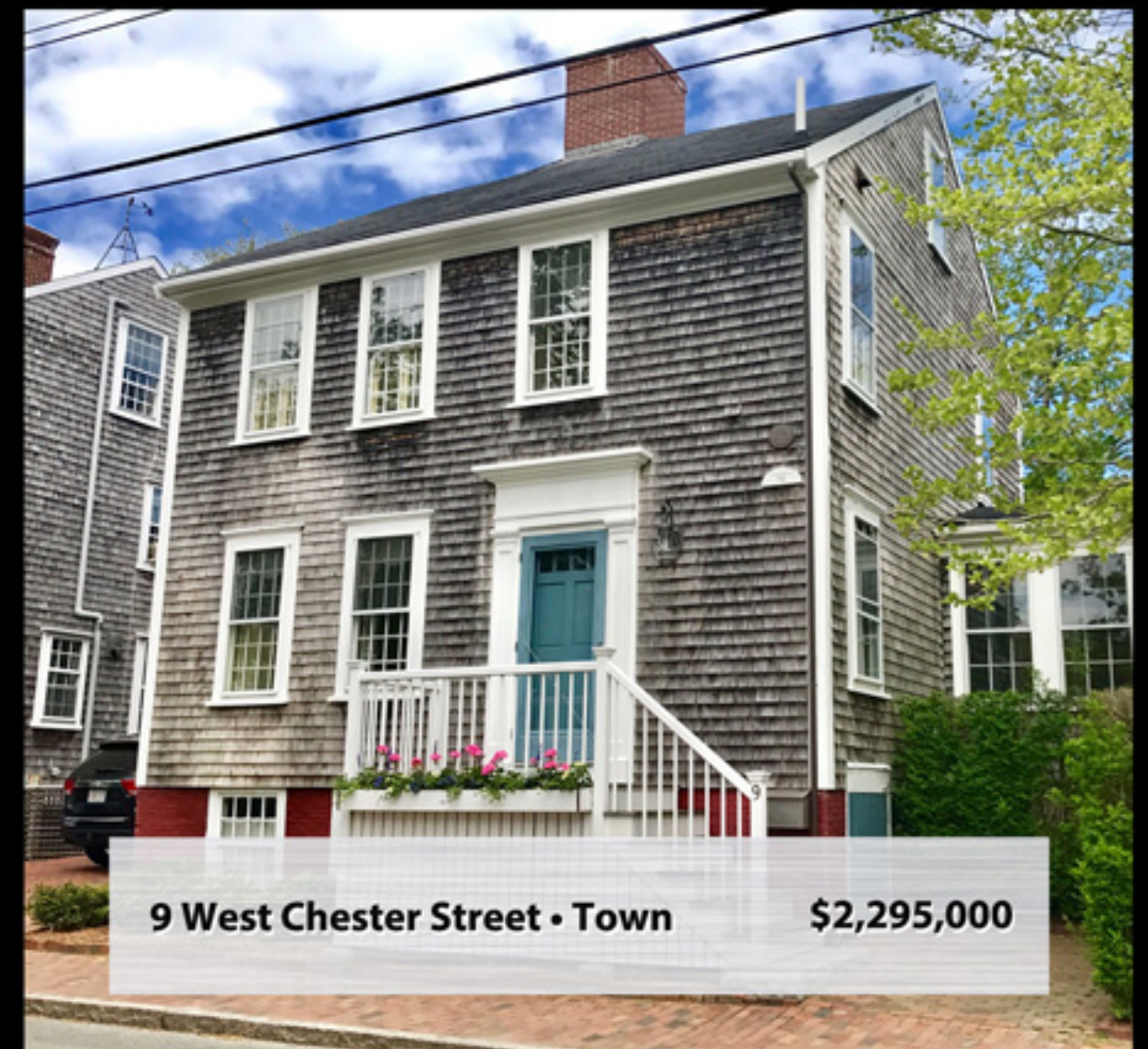
9 West Chester Street • Town $2,295,000