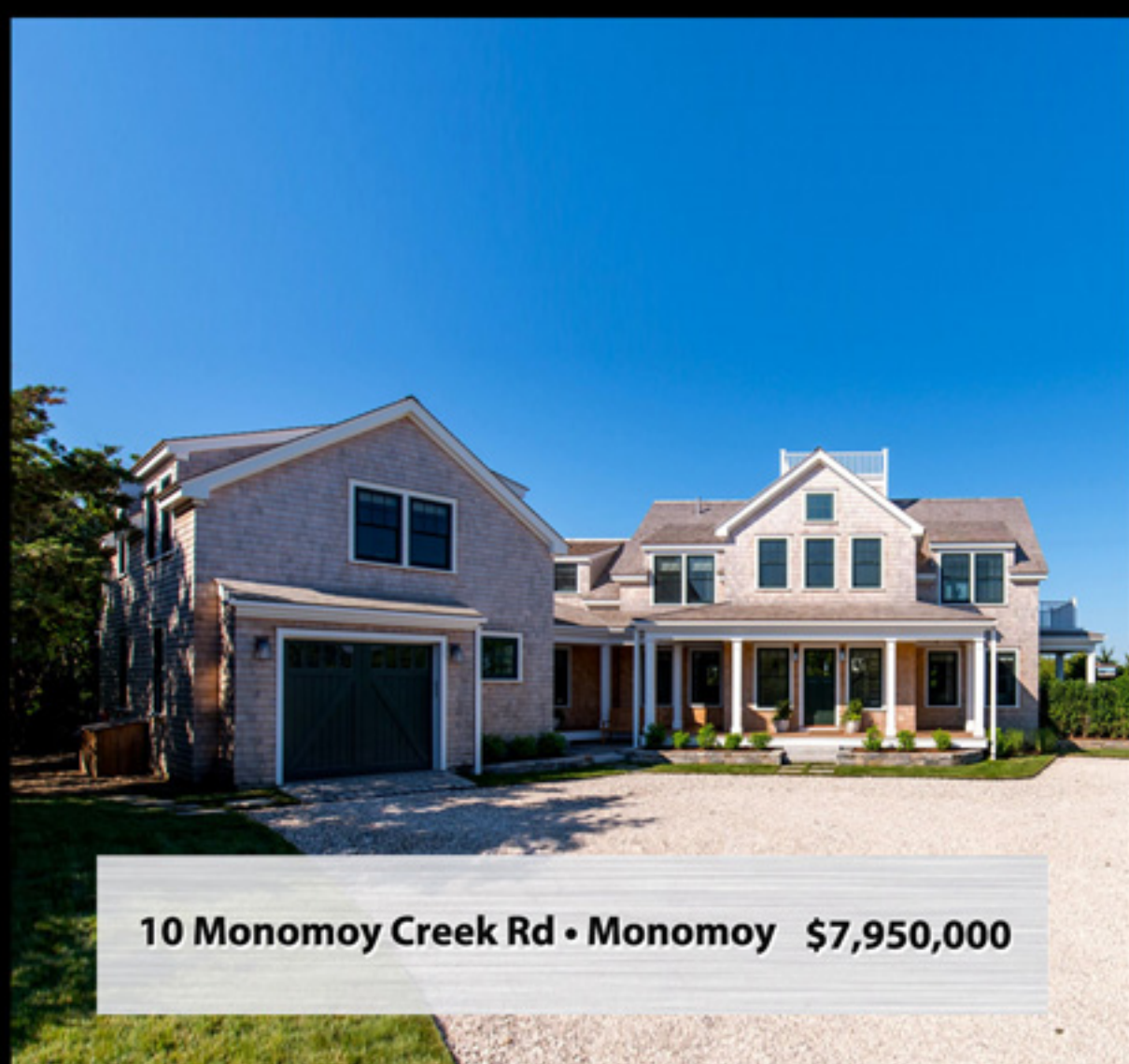
10 Monomoy Creek Rd • Monomoy $7,950,000