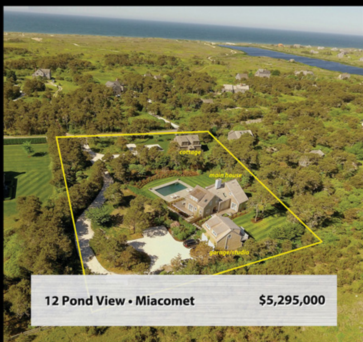
12 Pond View • Miacomet $5,295,000