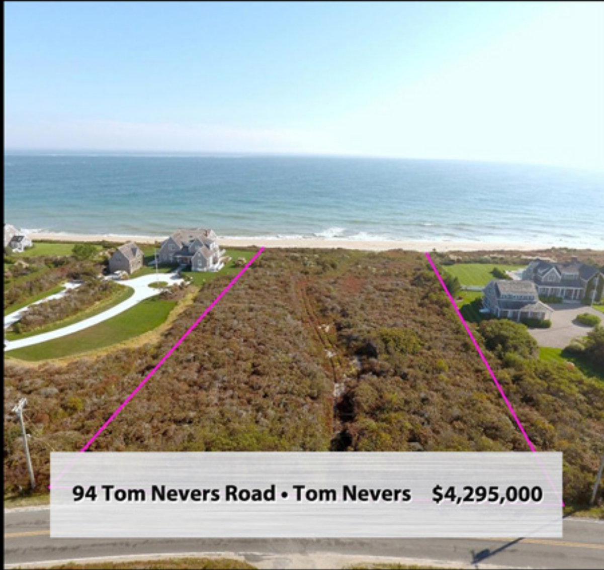
94 Tom Nevers Road • Tom Nevers $4,295,000