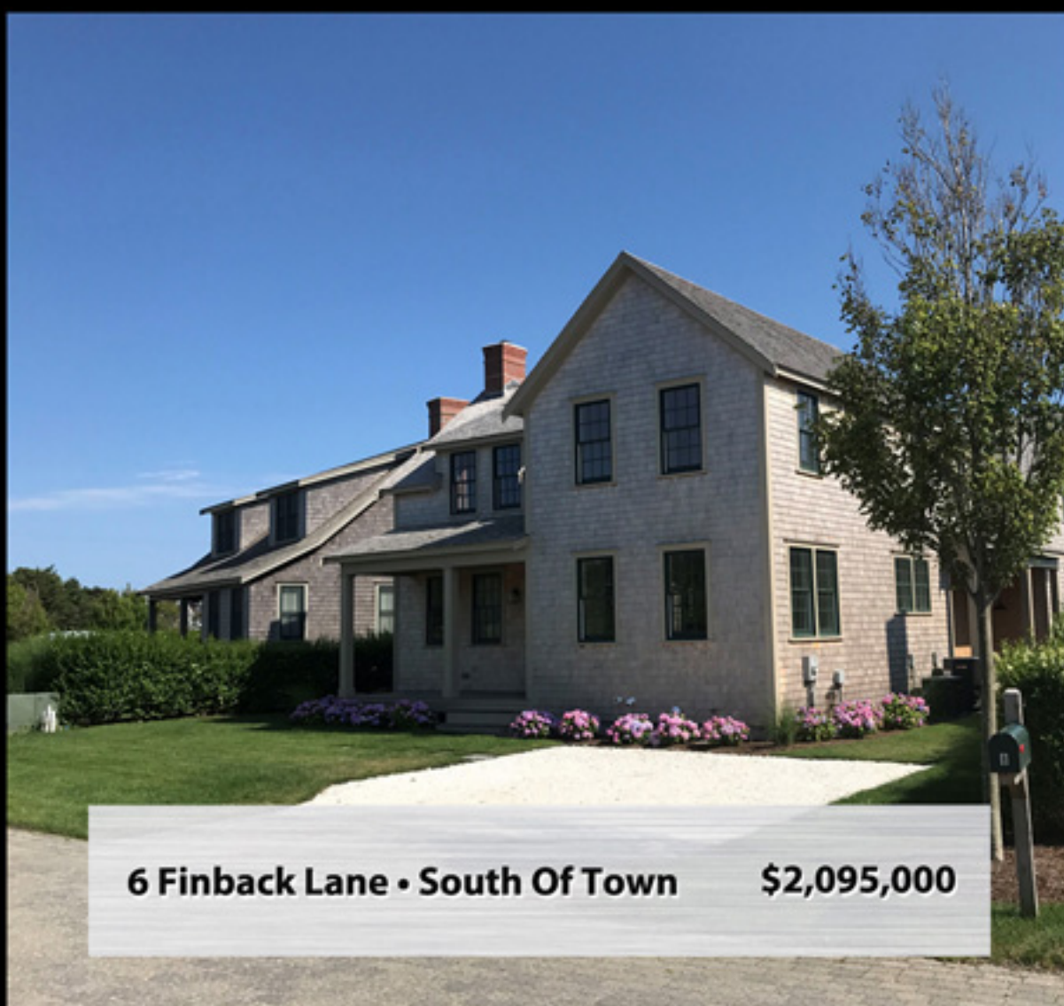
6 Finback Lane • South Of Town $2,095,000