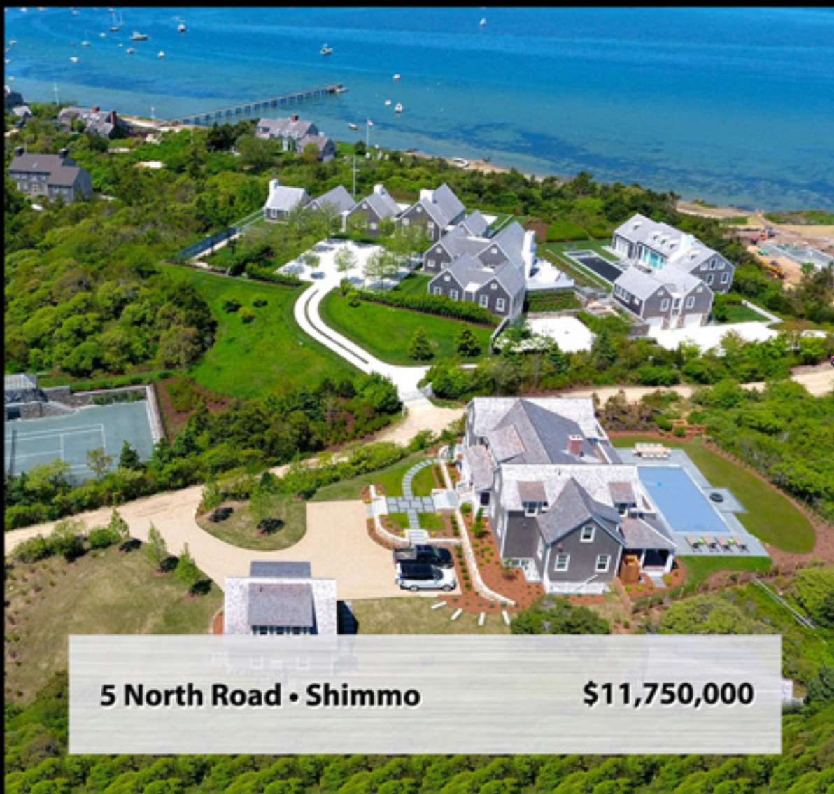
5 North Road • Shimmo $11,750,000