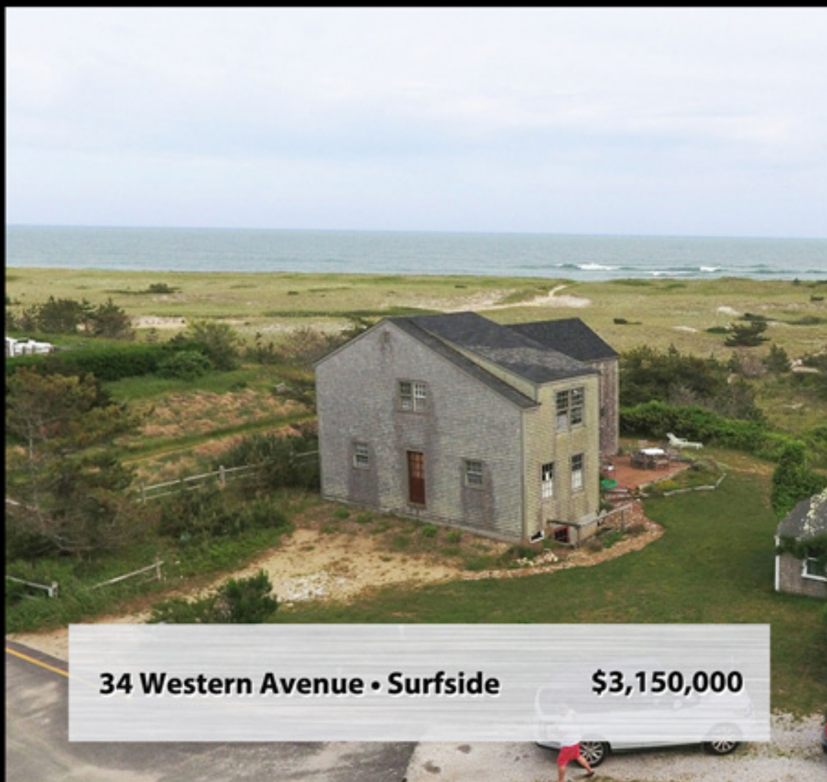
34 Western Avenue • Surfside $3,150,000