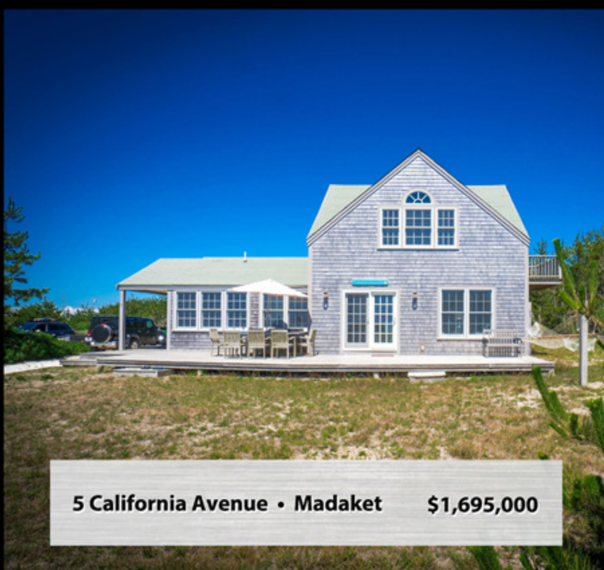
5 California Avenue • Madaket $1,695,000