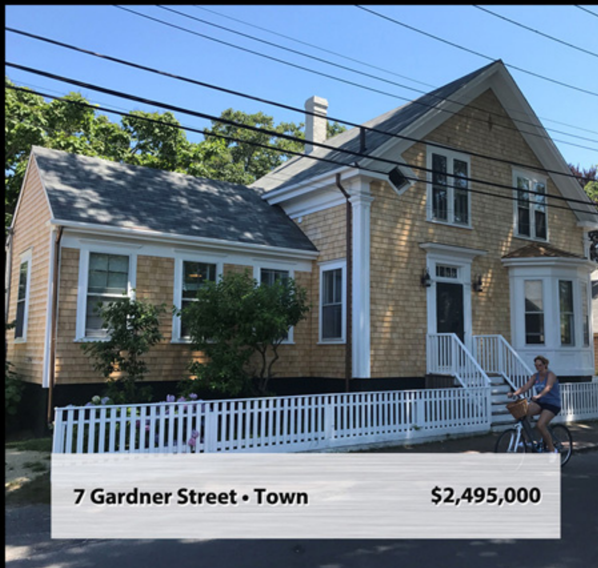
7 Gardner Street • Town $2,495,000