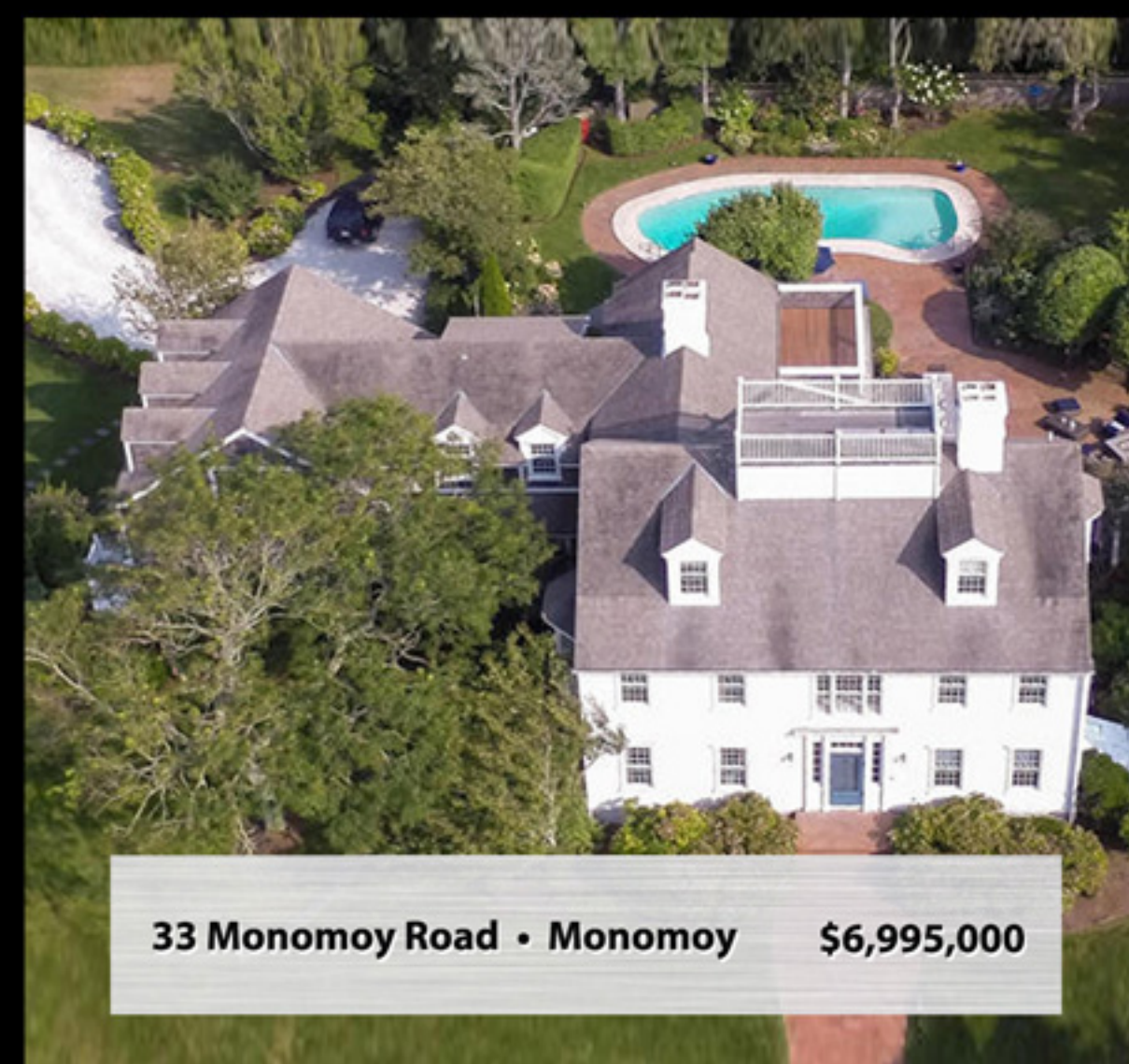
33 Monomoy Road • Monomoy $6,995,000