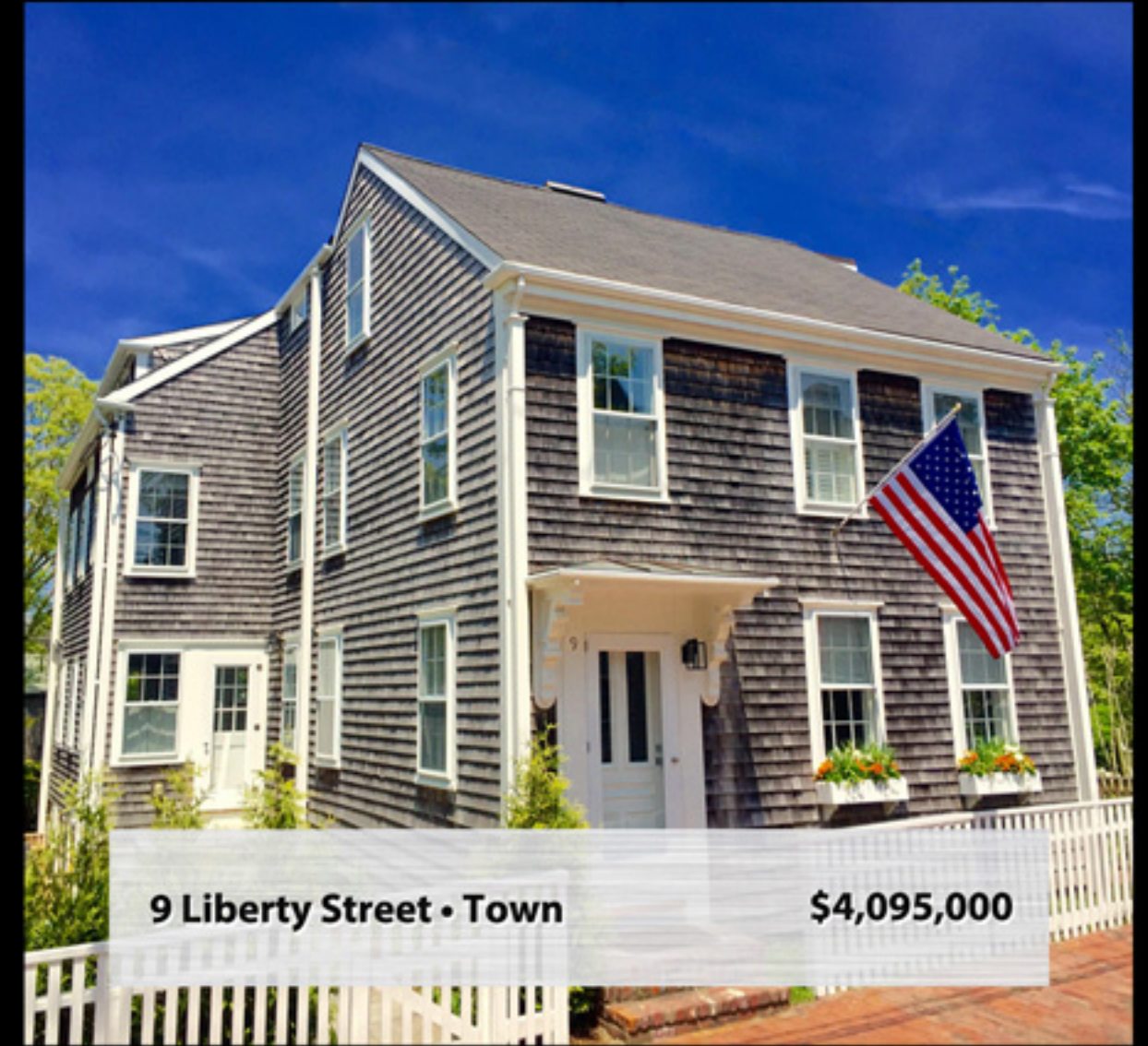
9 Liberty Street • Town $4,095,000