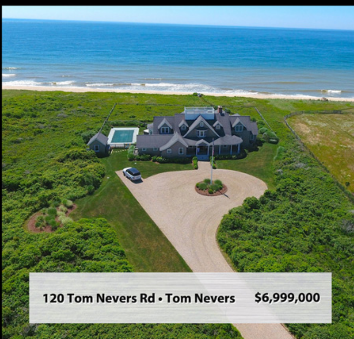
120 Tom Nevers Rd • Tom Nevers $6,999,000