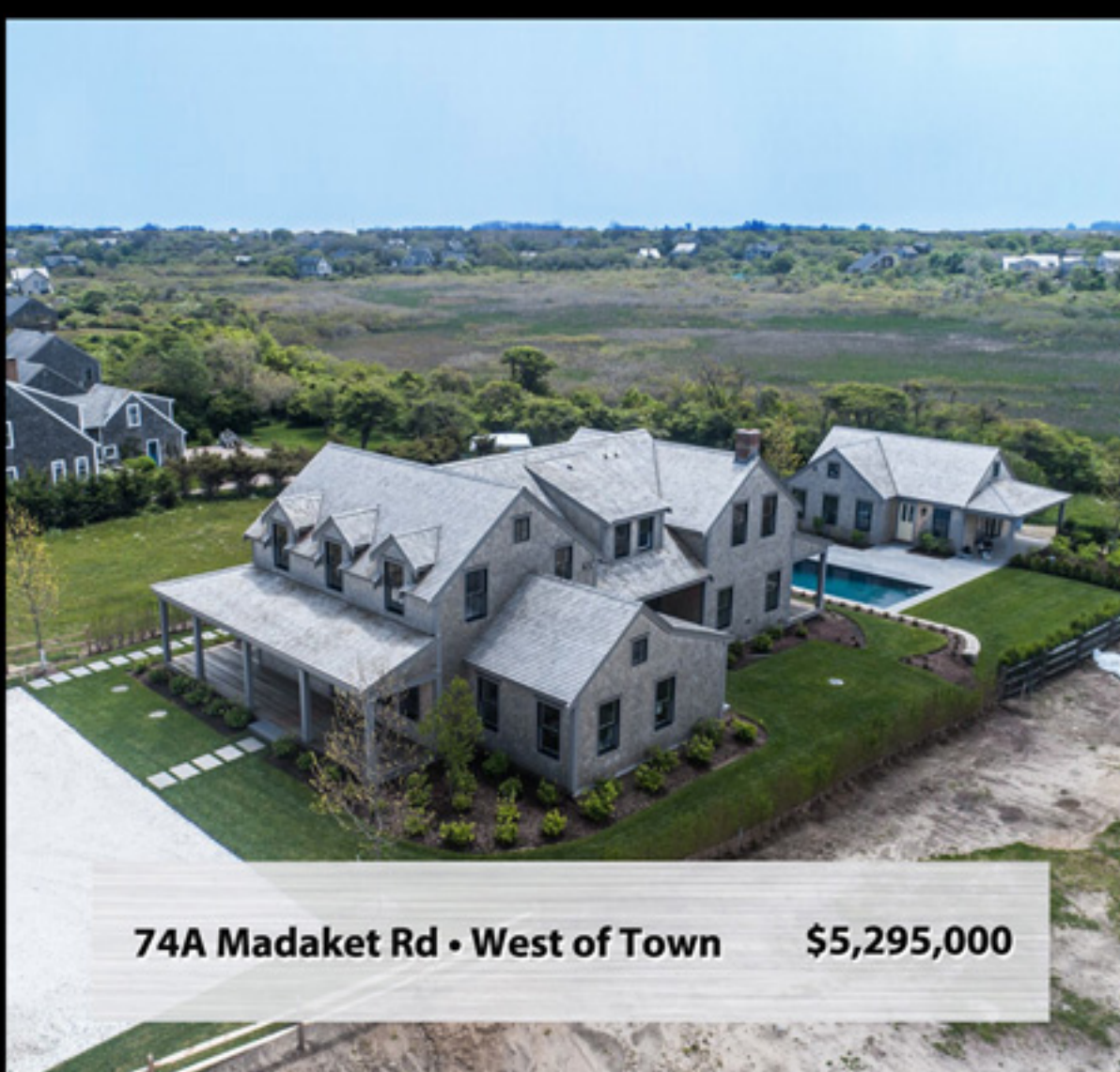
74A Madaket Rd • West of Town $5,295,000