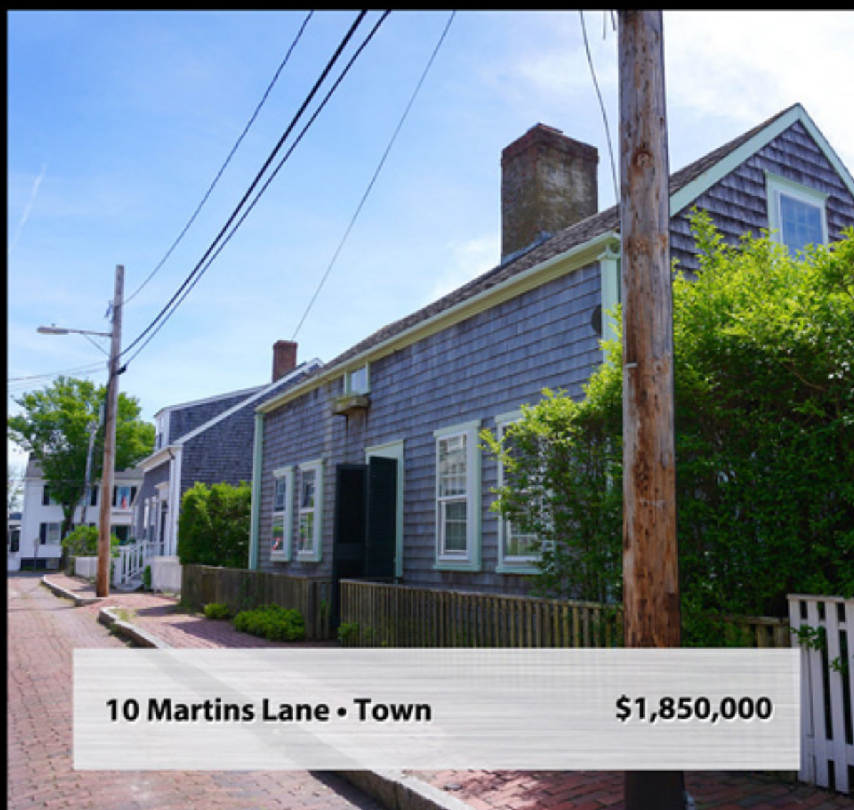
10 Martins Lane • Town $1,850,000