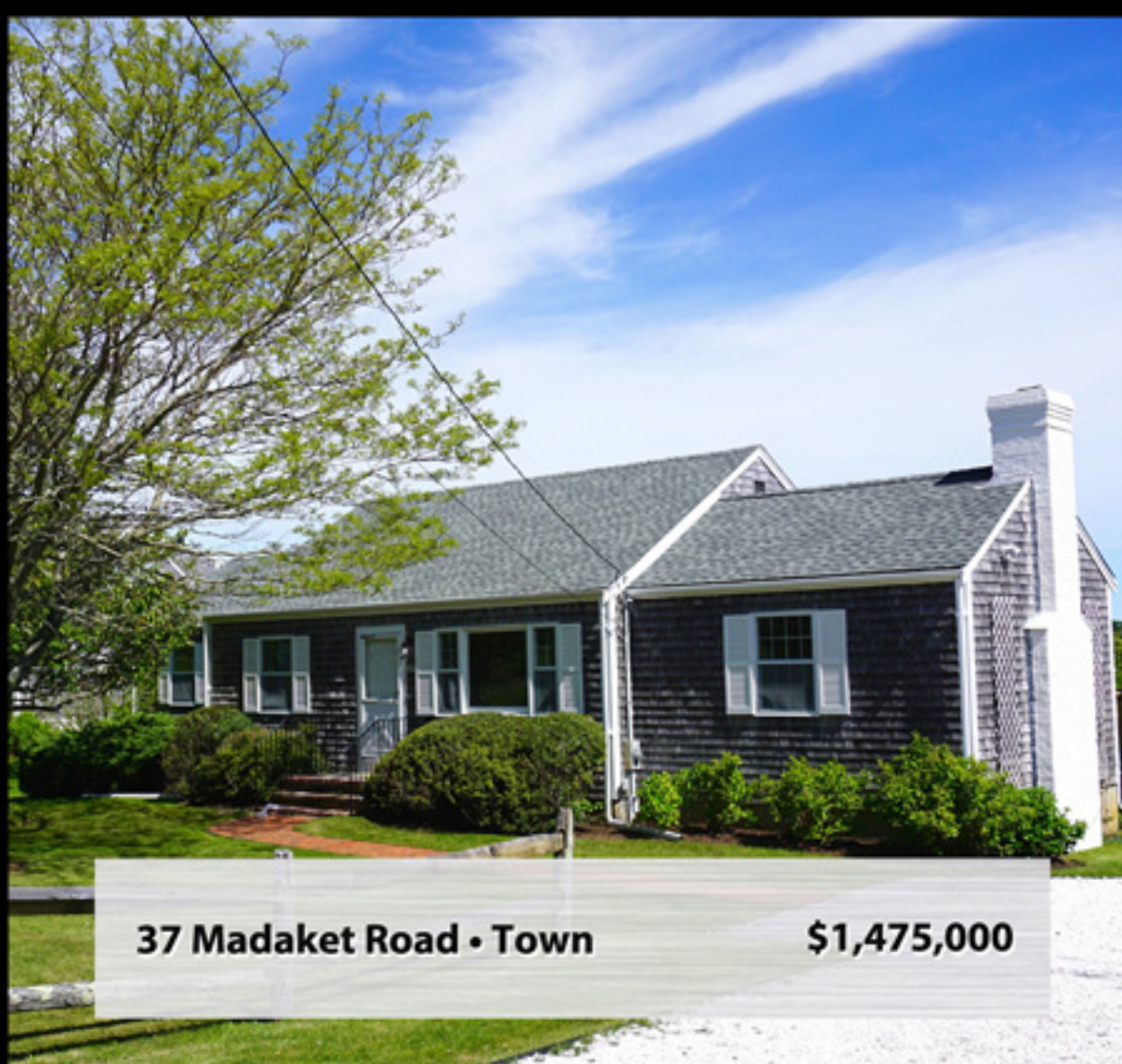
37 Madaket Road • Town $1,475,000