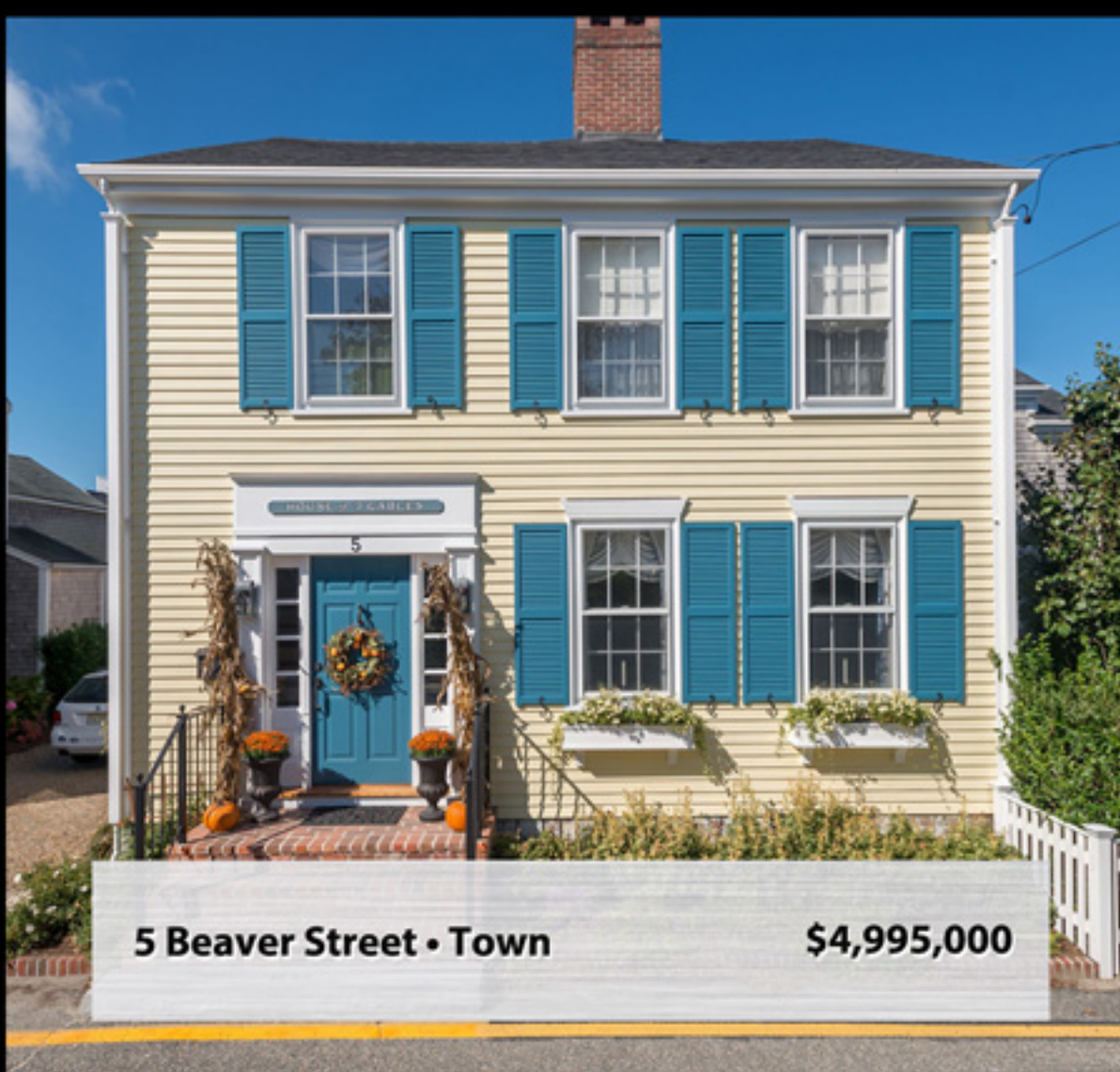
5 Beaver Street • Town $4,995,000