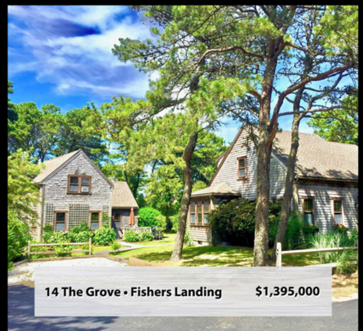
14 The Grove • Fishers Landing $1,395,000