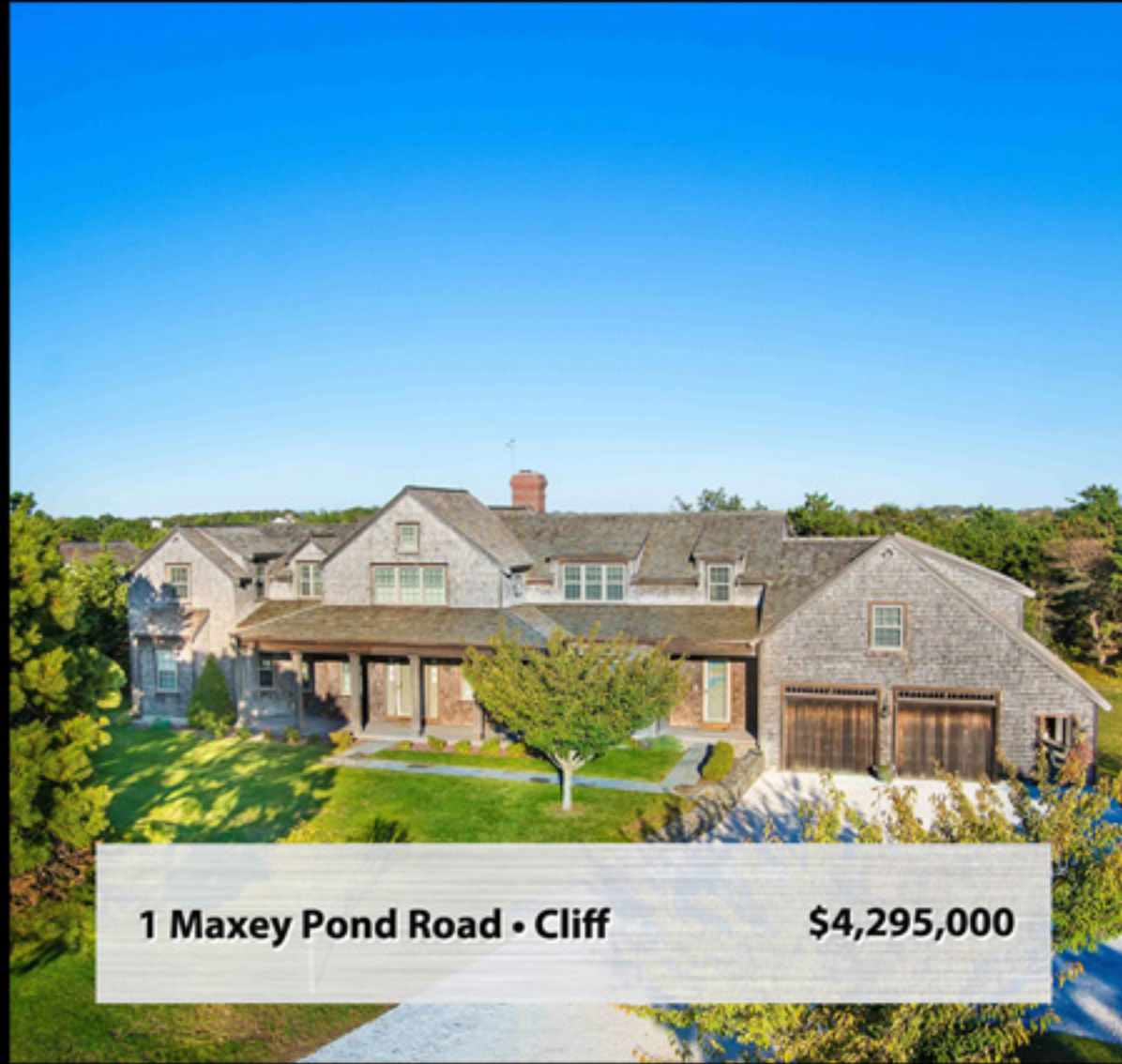
1 Maxey Pond Road • Cliff $4,295,000