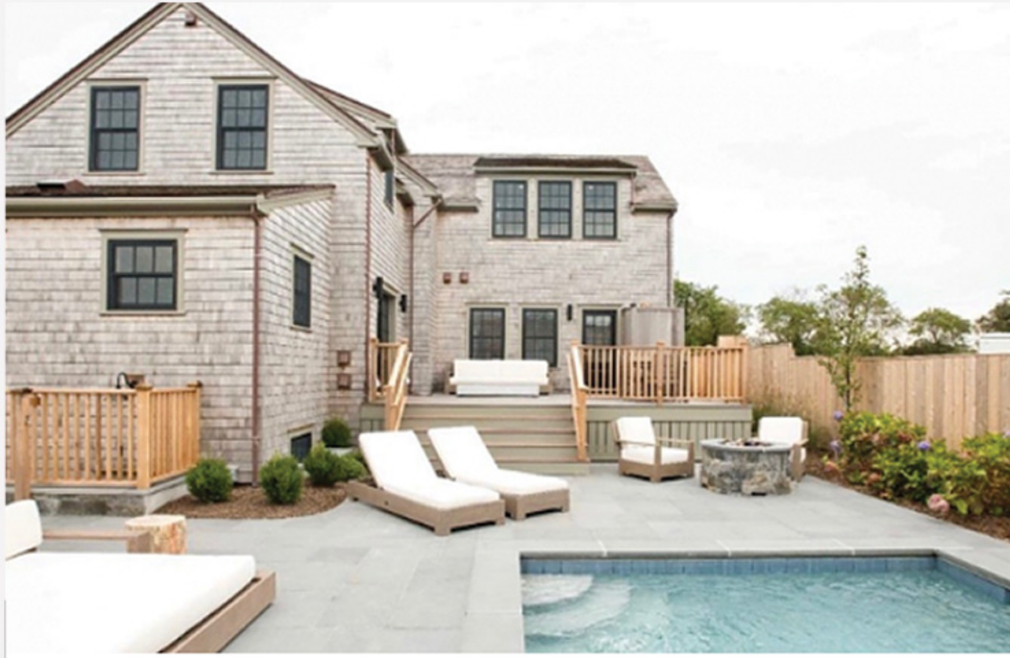
TOWN 2 OLD MILL COURT 5 bed / 5 baths 2 half Weekly Rental: $12,500 - $25,000