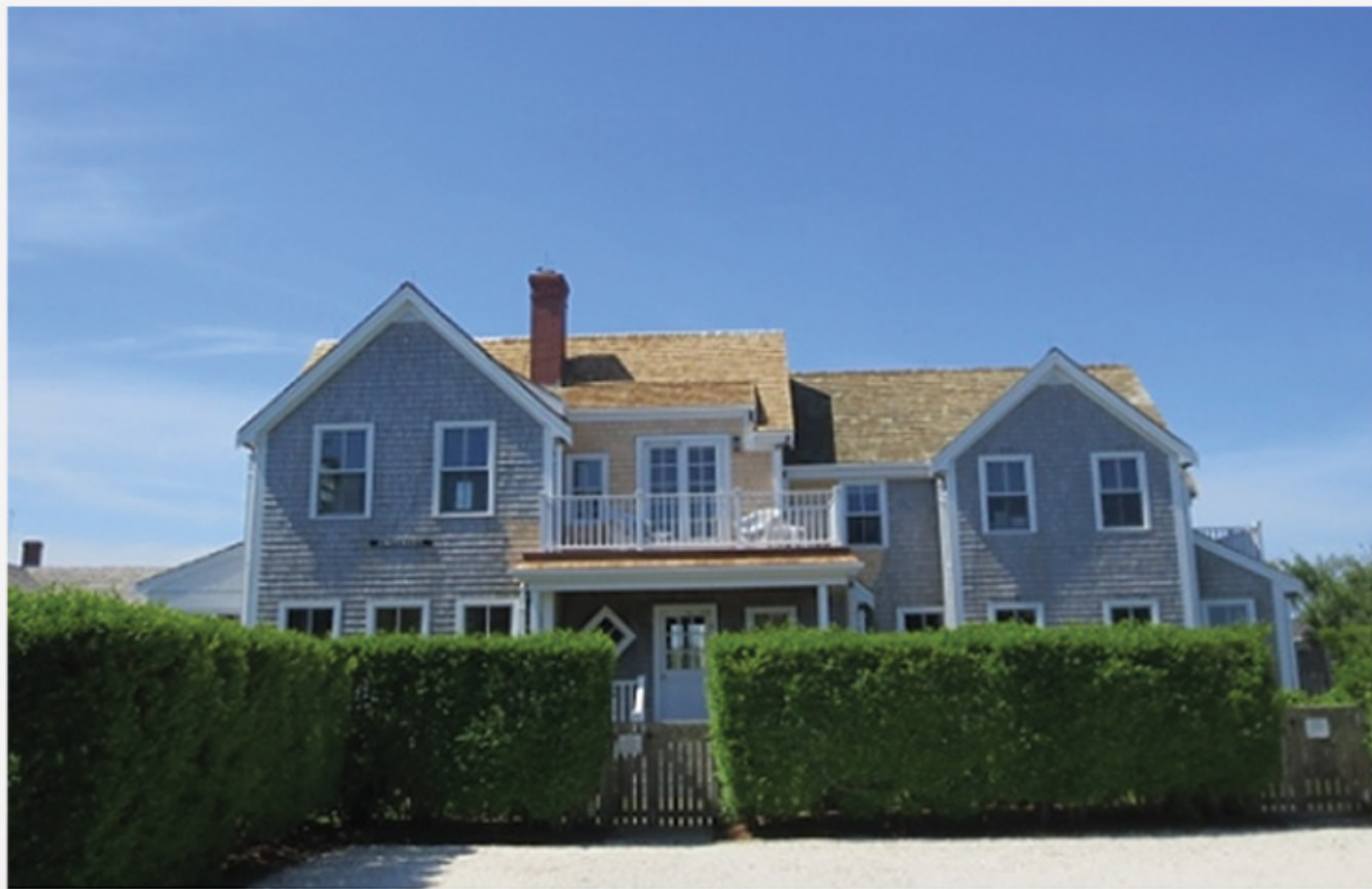
BRANT POINT 8 HULBERT AVE 4 bed / 6 baths 1 half Weekly Rental: $12,000 - $15,000