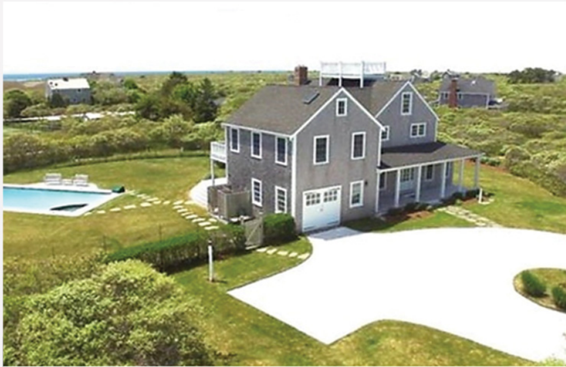
MADEQUECHAM 22 WIGWAM ROAD 5 bed / 4 baths 1 half Weekly Rental: $15,000 - $18,000