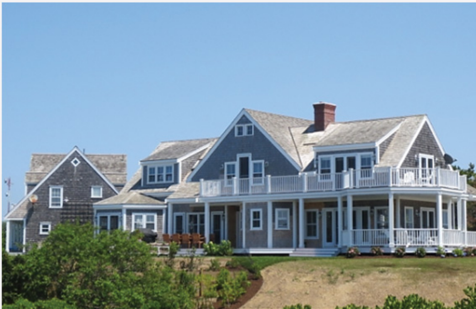
DIONIS 14 BISHOPS RISE 7 bed / 6 baths 1 half Weekly Rental: $15,000 - $26,500