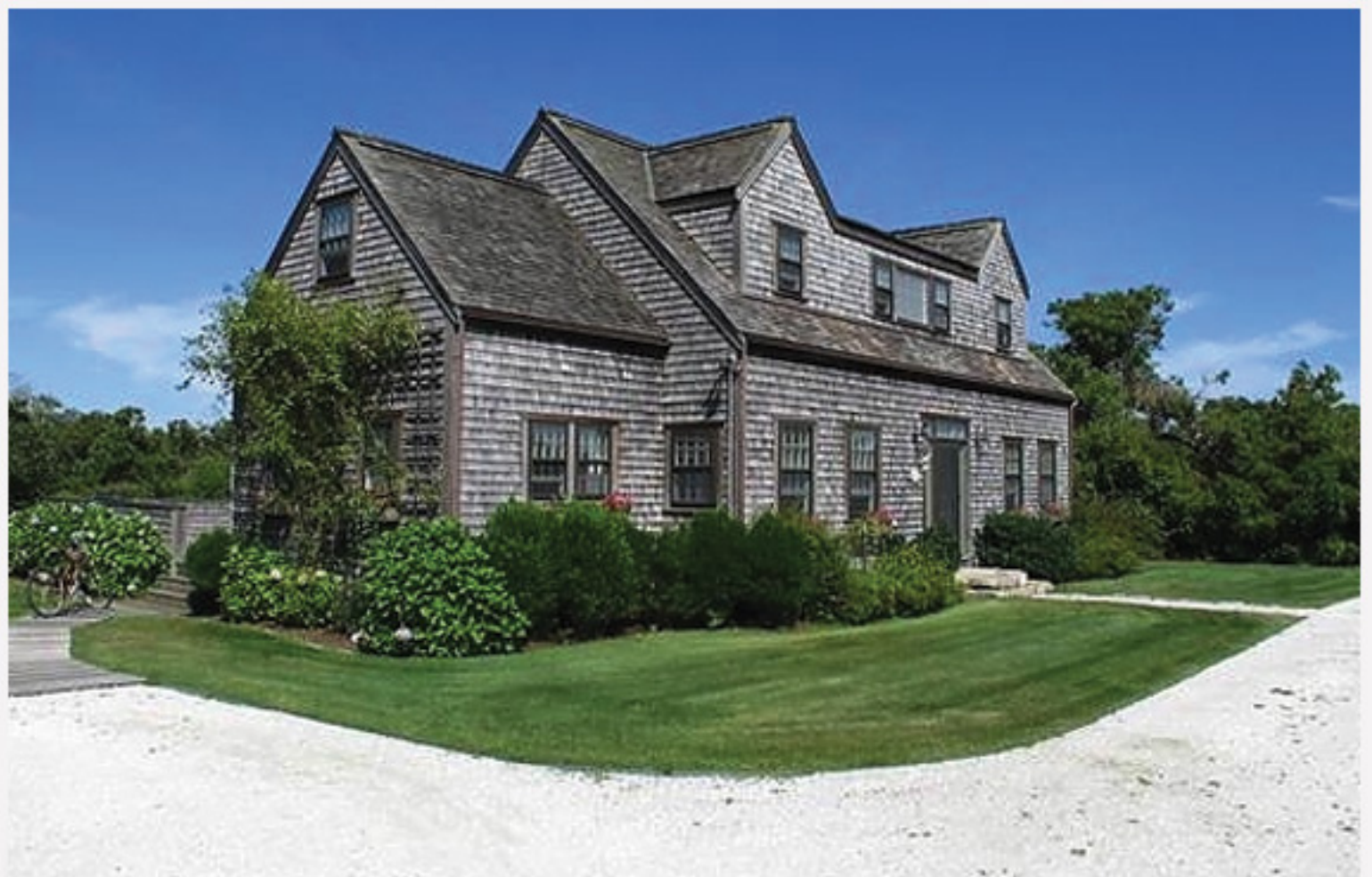
SURFSIDE 32 WOODBINE STREET 3 bed / 3 baths 1 half Weekly Rental: $10,000 - $15,000