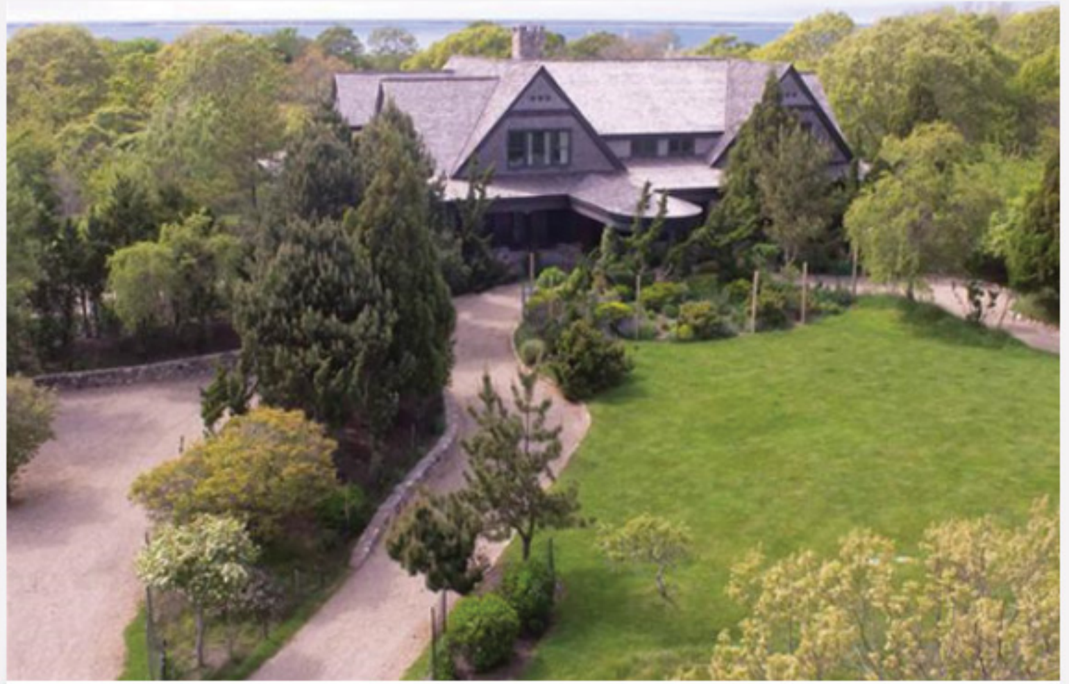
QUAISE 6 QUAISE PASTURE ROAD 6 bed / 6 baths 2 half Weekly Rental: $18,500 - $25,000