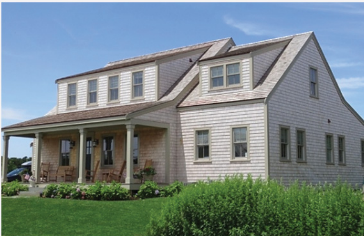
CISCO 19 NANAHUMACKE LANE 4 bed / 4 baths 1 half Weekly Rental: $13,000 - $15,000