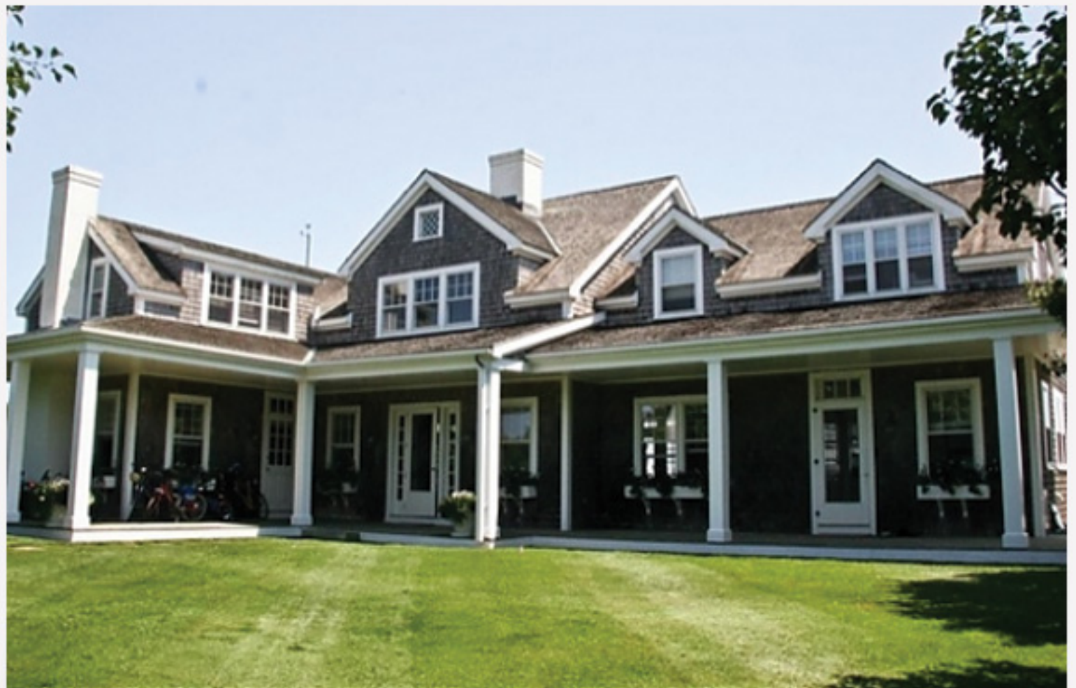
SCONSET 69 BAXTER ROAD 4 bed / 4 baths 1 half Weekly Rental: $15,000 - $22,000