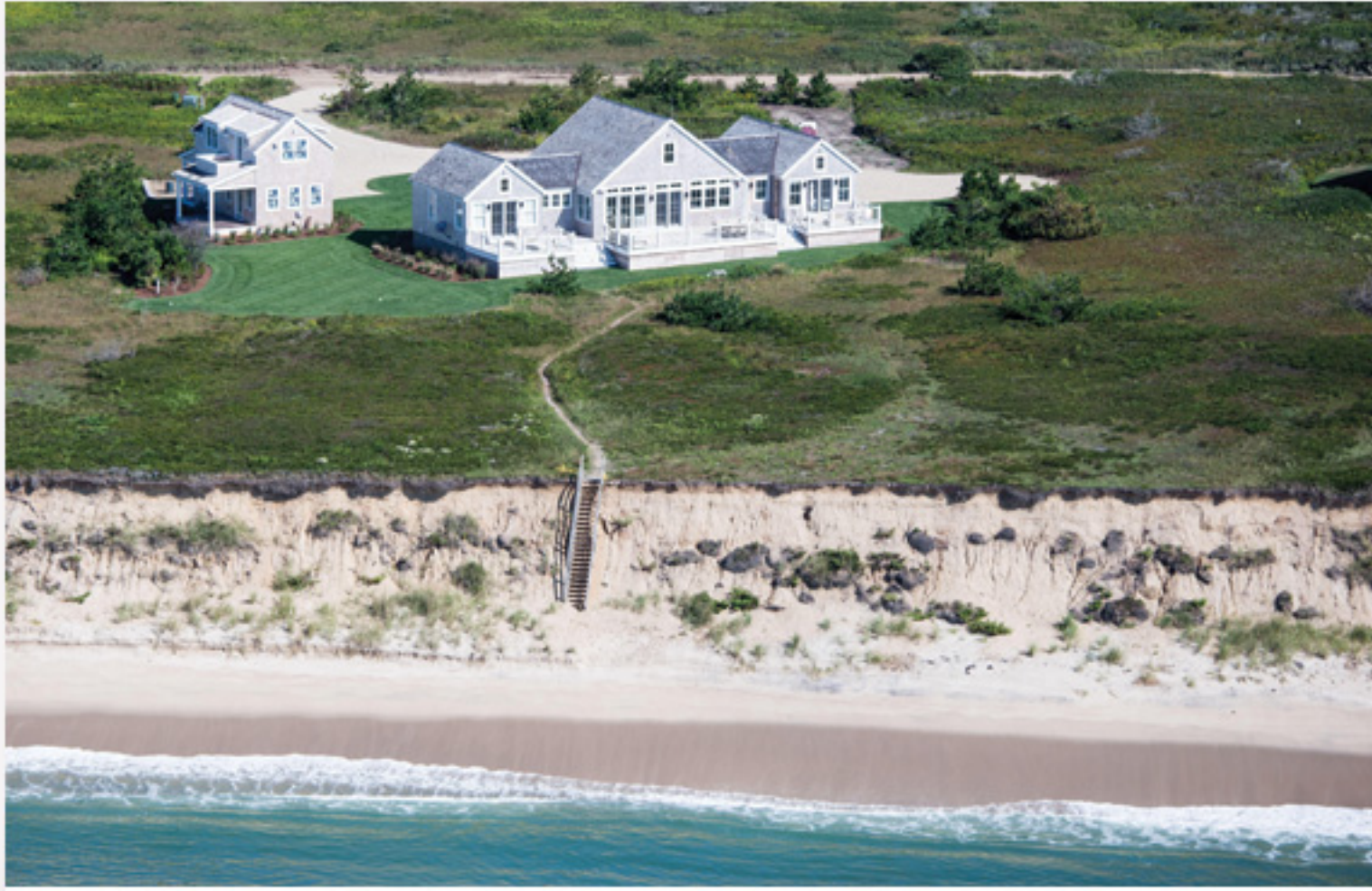
MADEQUECHAM 18 MADEQUECHAM VALLEY RD 5 Bed/3 bath 2 half Weekly Rental: $15,000 - $30,000