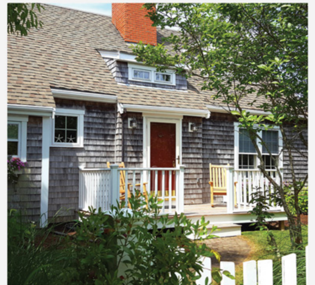
NASHAQUISSET 12 NETOWA LANE 3 bed / 3 baths Weekly Rental: $2,950 - $5,250