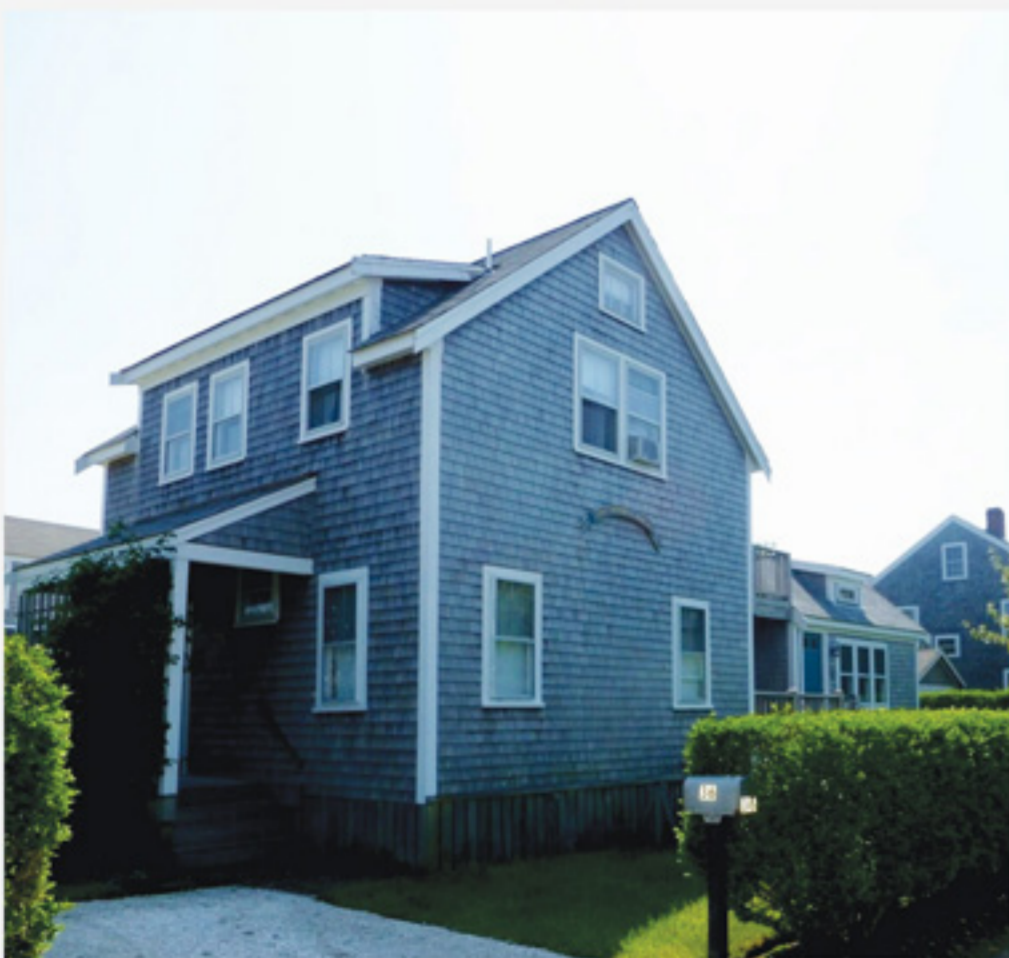
BRANT POINT 36 WALSH STREET 4 bed / 2 bath 1 half Weekly Rental: $8,500 - $10,500