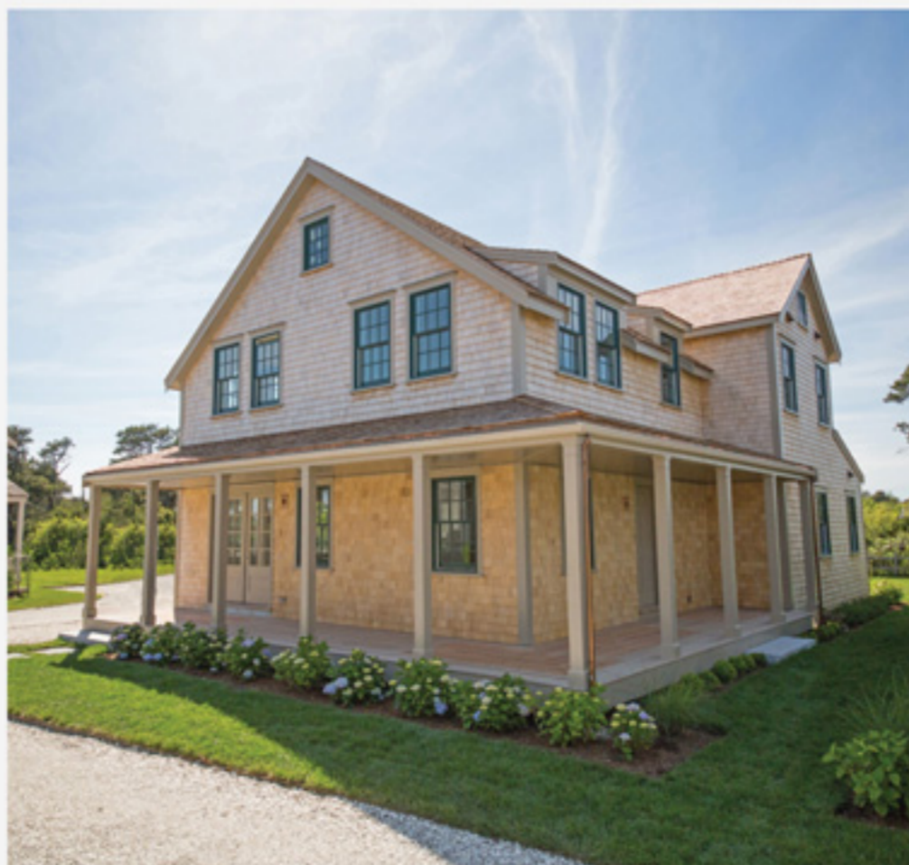
SURFSIDE 8 FOX GRAPE LANE 4 bed / 3 baths 1 half Weekly Rental: $4,500 - $8,000