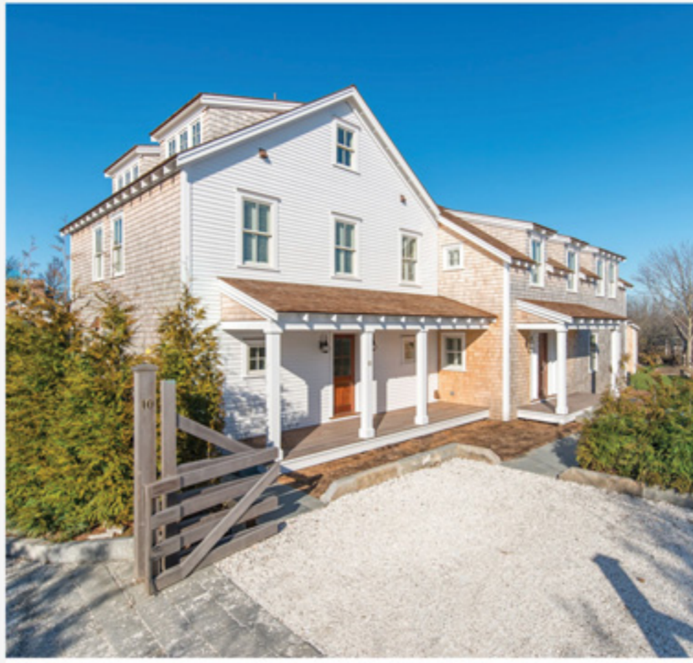
CLIFF 10 OLD WESTMOOR FARM RD 9 bed / 8 baths 2 half Weekly Rental: $35,000