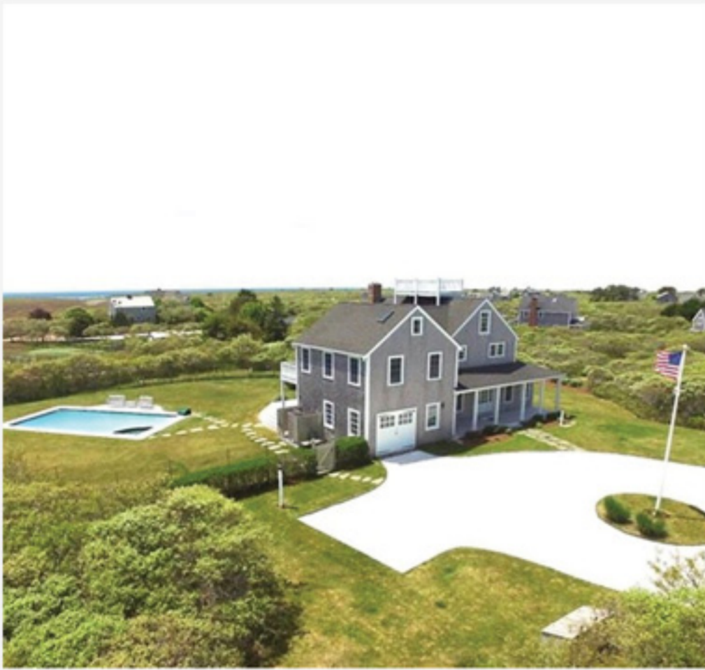
MADEQUECHAM 22 WIGWAM ROAD 5 bed / 4 baths 1 half Weekly Rental: $15,000 - $18,000