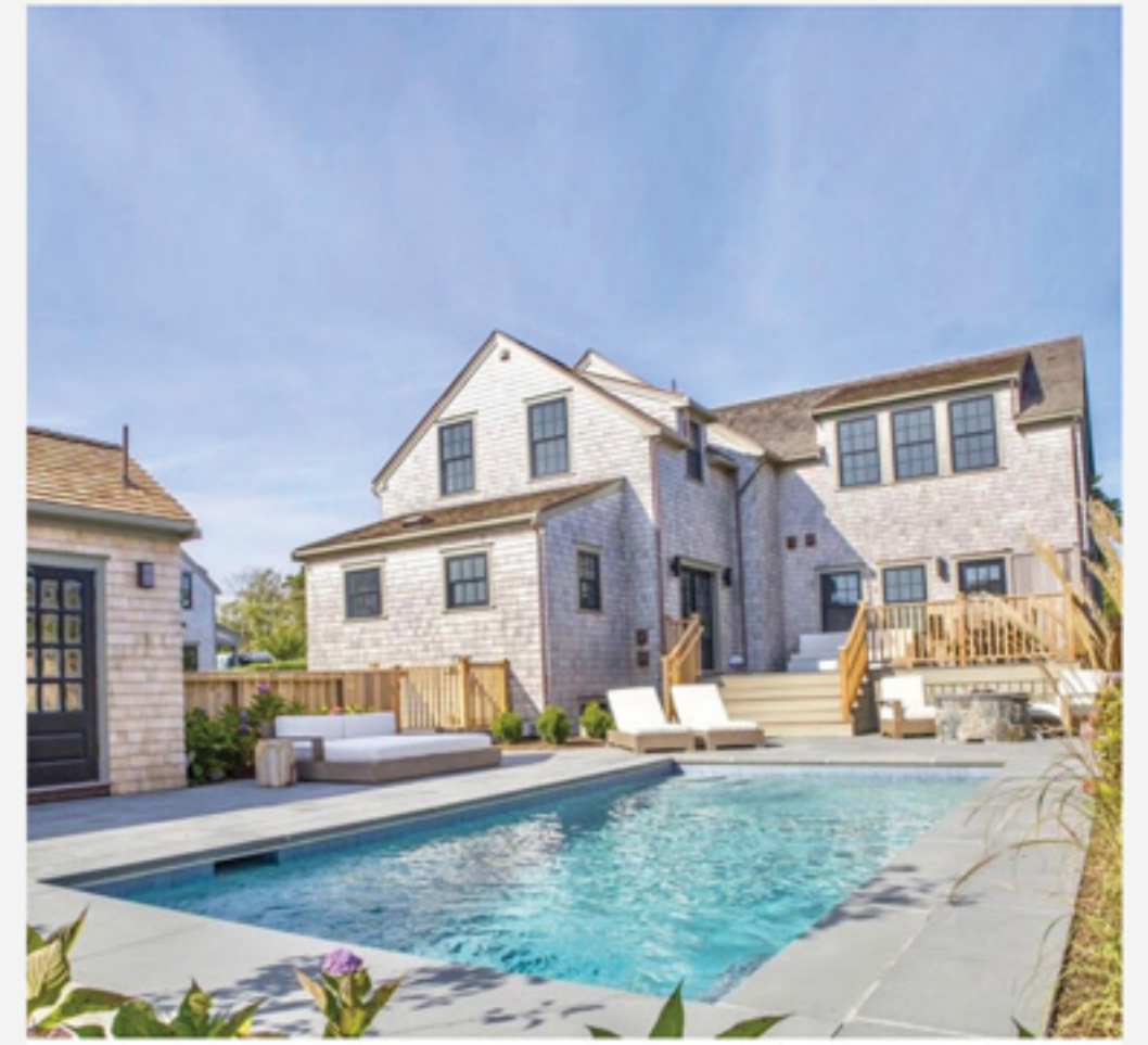
TOWN 2 OLD MILL COURT 5 bed / 5 baths 2 half Weekly Rental: $12,500 - $25,000