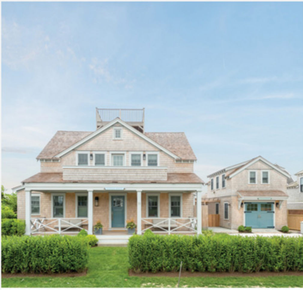
TOWN 33 JEFFERSON AVE 8 bed / 8 baths 2 half Weekly Rental: $15,000 - $50,000