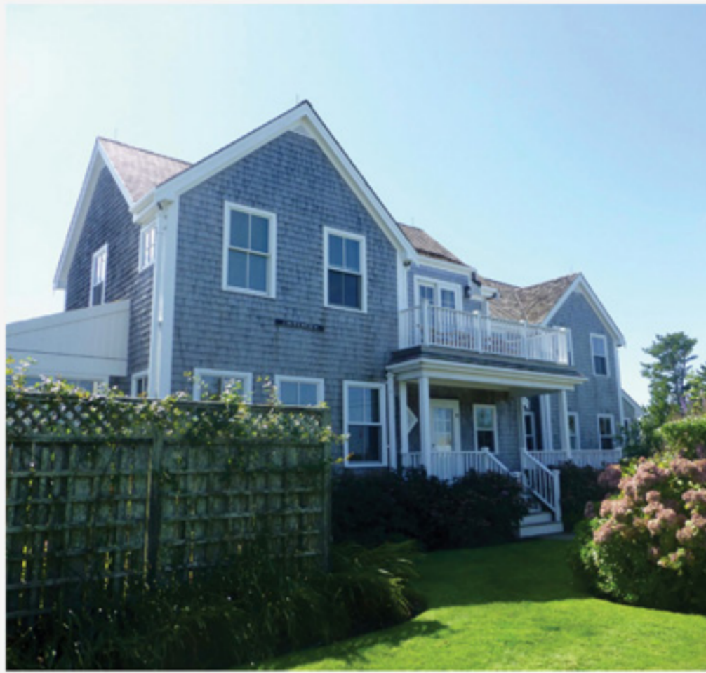
BRANT POINT 8 HULBERT AVE 4 bed / 6 baths 1 half Weekly Rental: $12,000 - $15,000