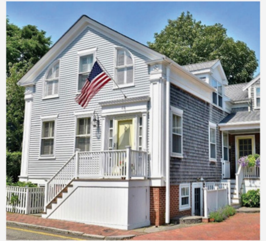
TOWN 26 PINE STREET 4 bed / 4 baths 1 half Weekly Rental: $6,000 - $12,500