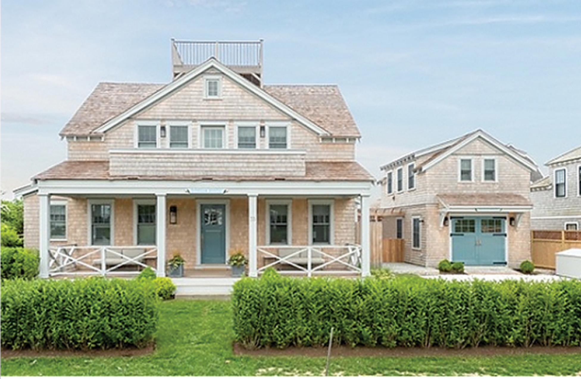
BRANT POINT 33 JEFFERSON AVE 8 bed / 8 baths 2 half Weekly Rental: $15,000 - $50,000