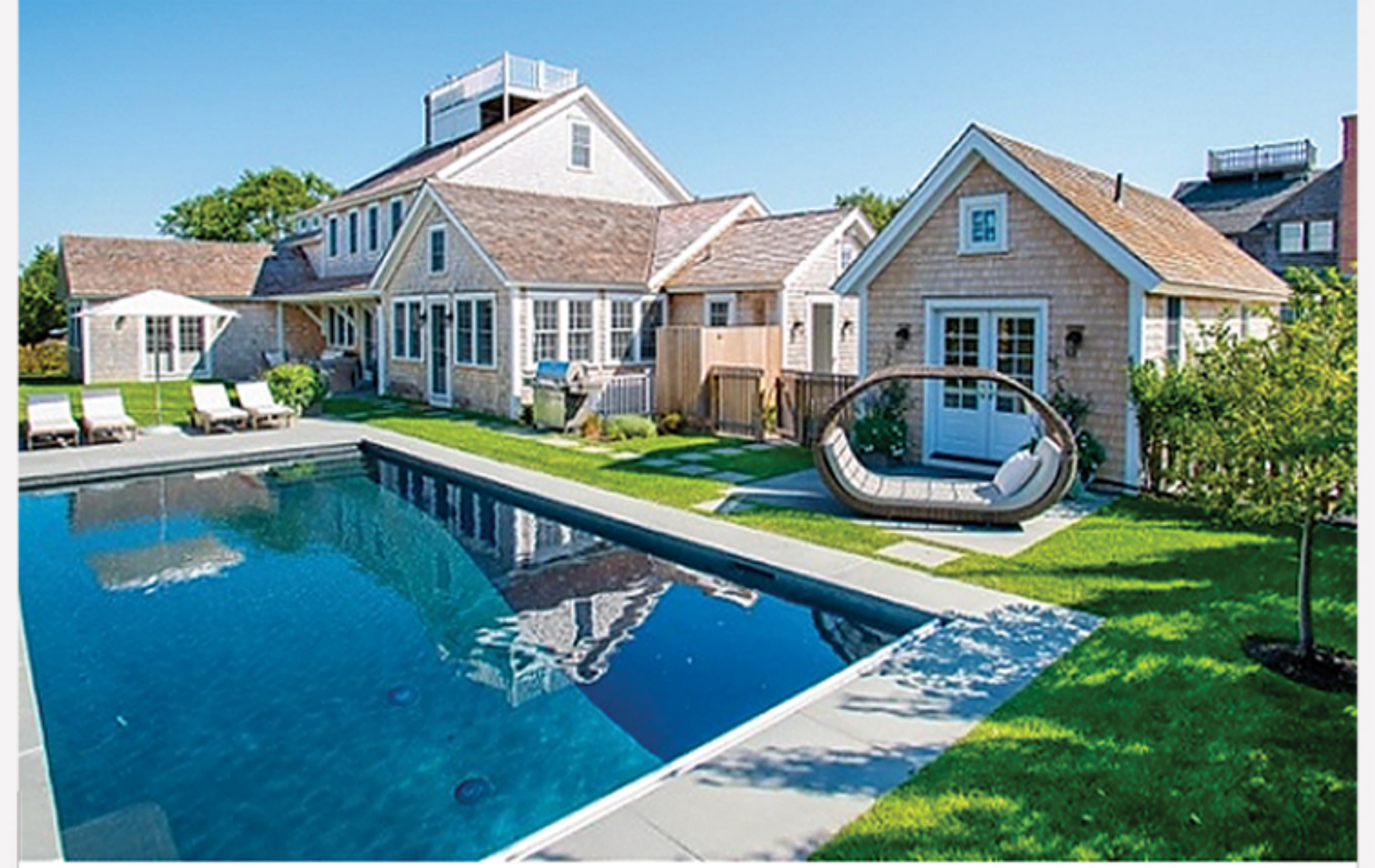
CLIFF 2 HAMBLIN ROAD 5 bed / 5 baths 1 half Weekly Rental: $15,000 - $48,000