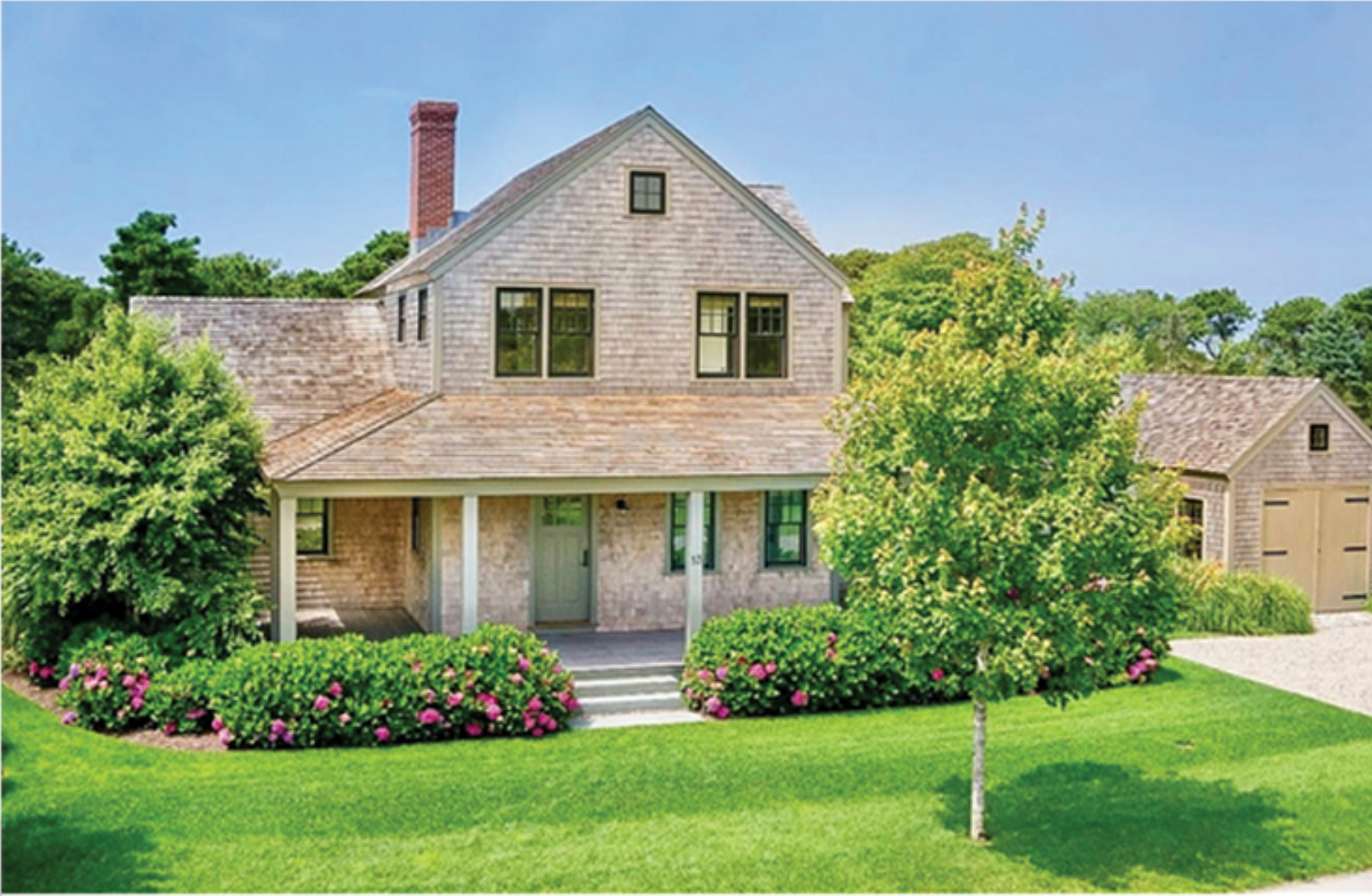
MIACOMET 13 ELLENS WAY 4 bed / 4 baths 1 half Weekly Rental: $10,000 - $18,000