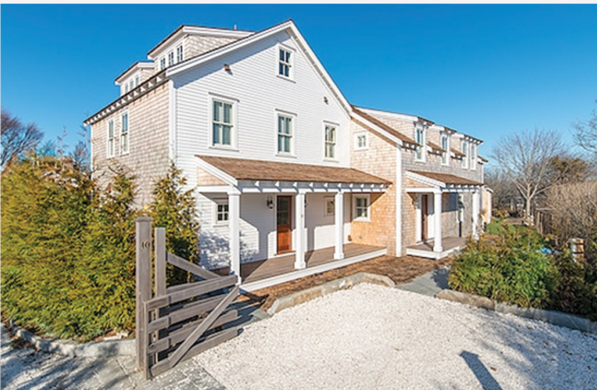
CLIFF 10 OLD WESTMOOR FARM RD 9 bed / 8 baths 2 half Weekly Rental: $35,000