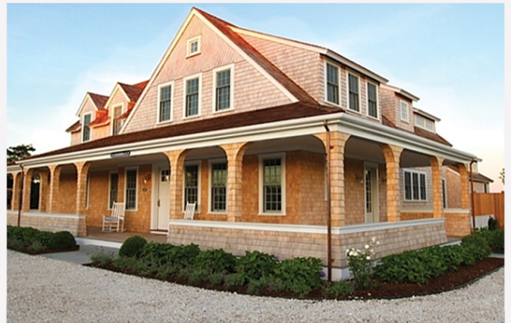
SCONSET 22 BLACKFISH LANE 7 bed / 7 baths Weekly Rental: $23,000 - $30,000