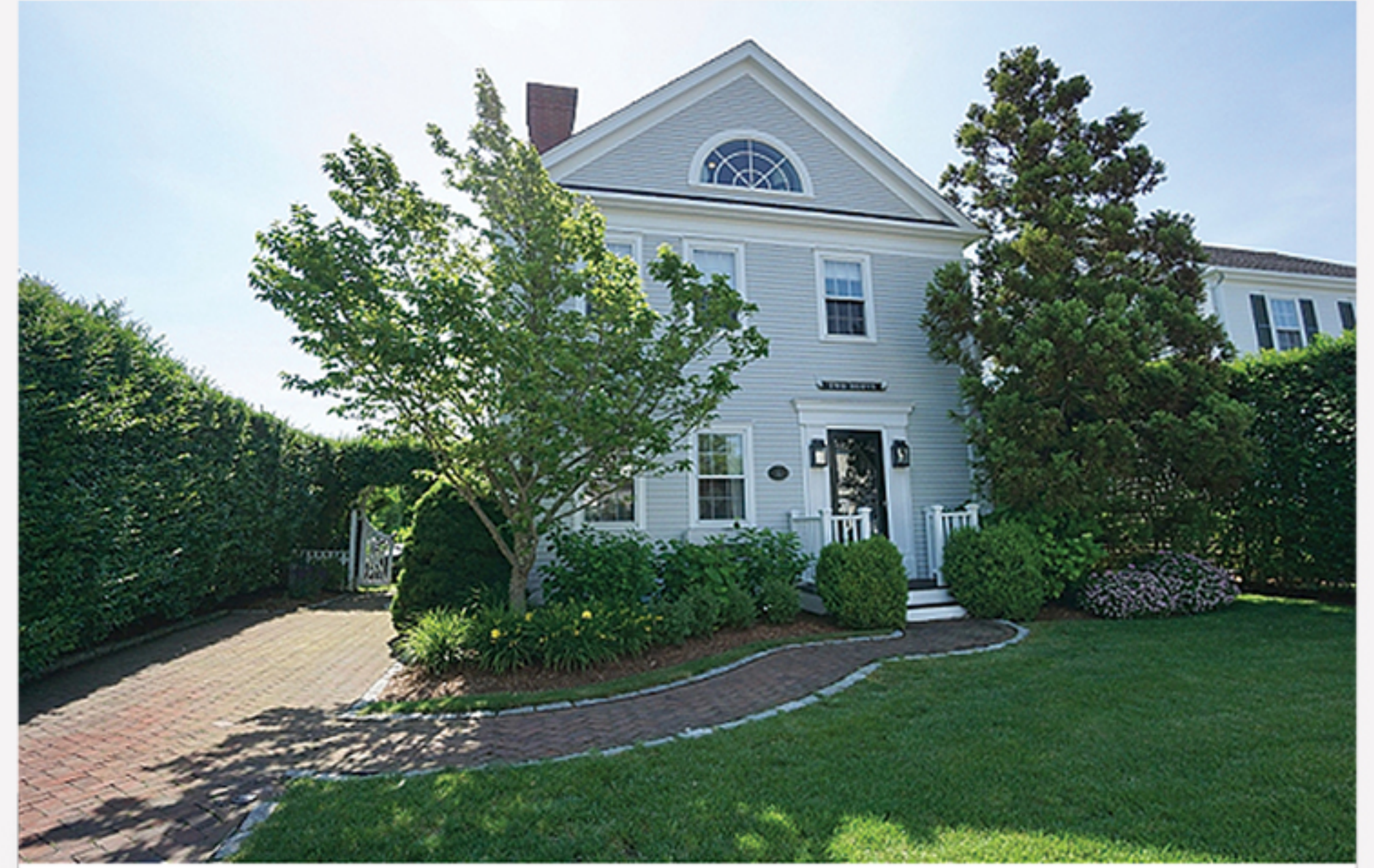
NAUSHOP 4 KITTIWAKE LANE 4 bed / 3 bath 1 half Weekly Rental: $8,500