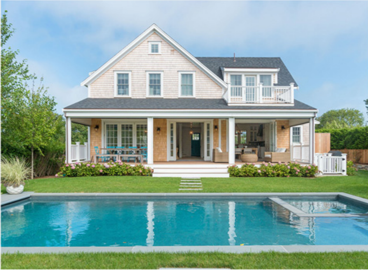
CLIFF 2 Lightship Lane $5,375,000