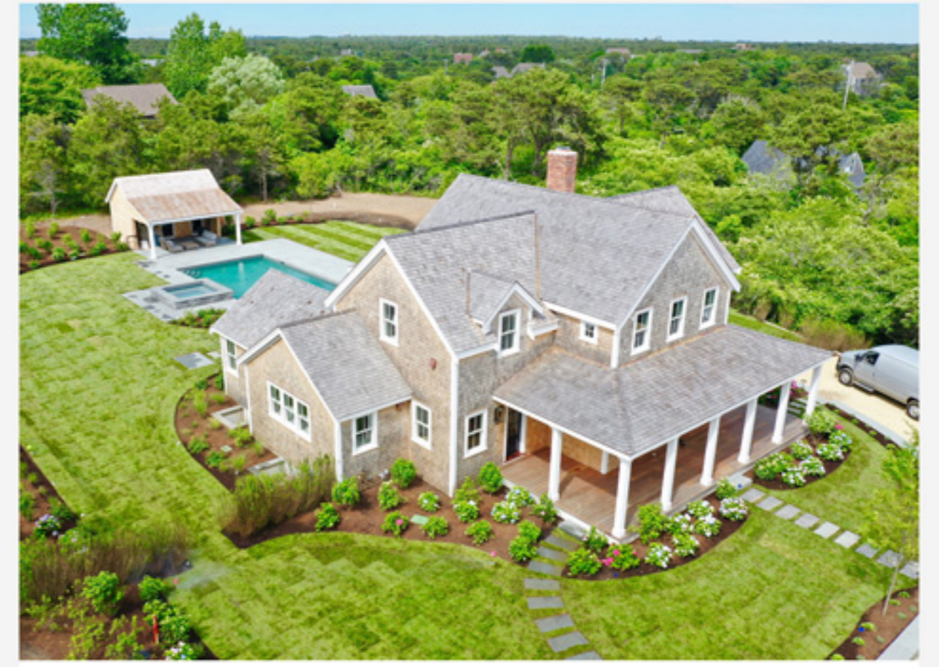
SURFSIDE 8 Masaquet Avenue $5,795,000