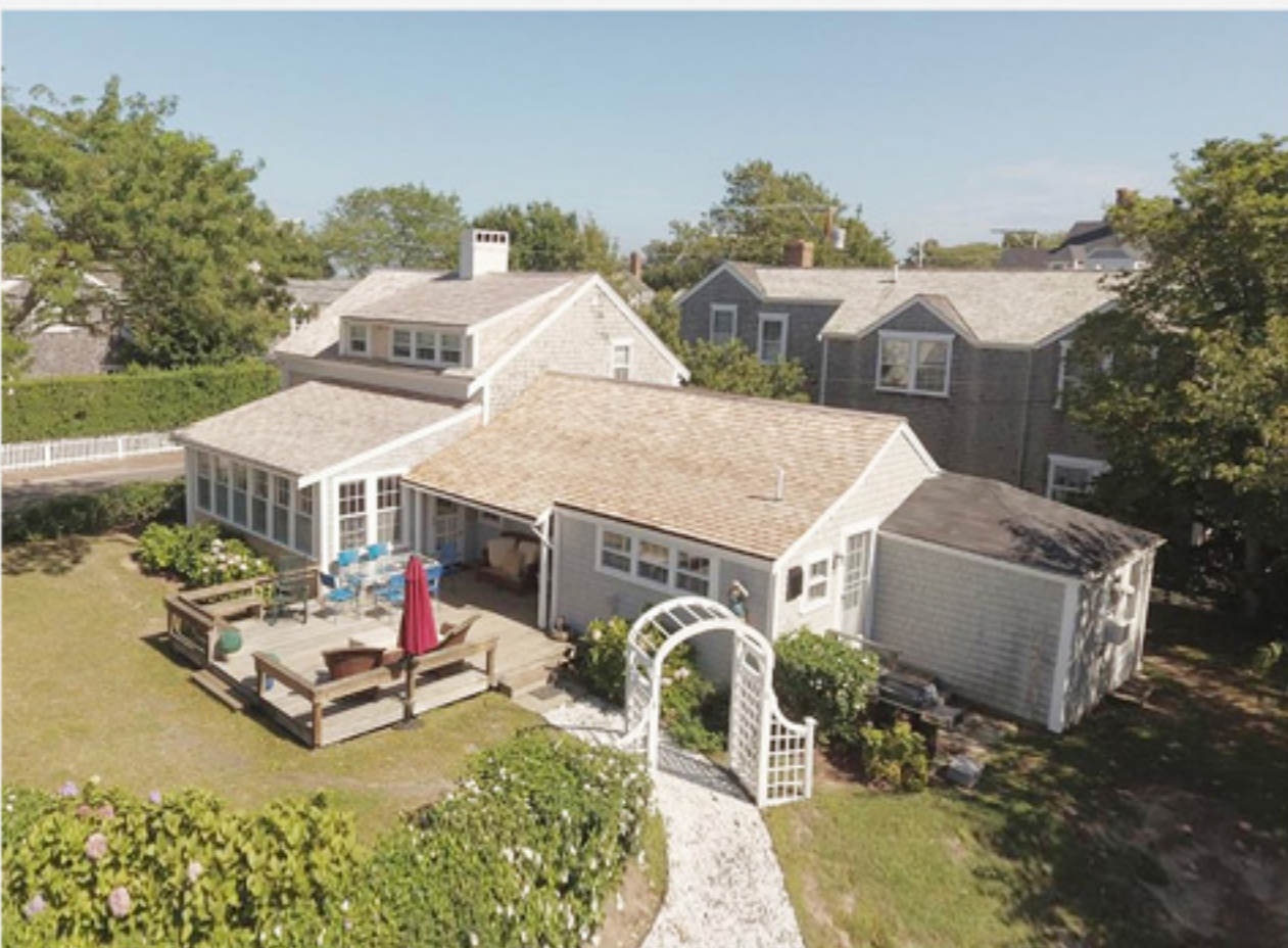
CLIFF 38/40 Cliff Road $3,695,000