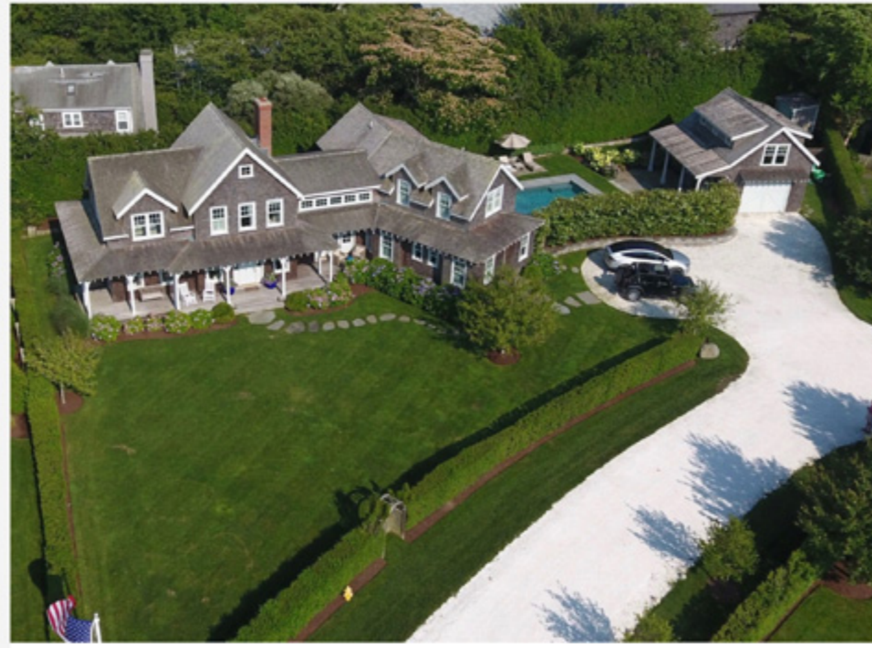
CLIFF 14 Old Westmoor Farm $6,000,000