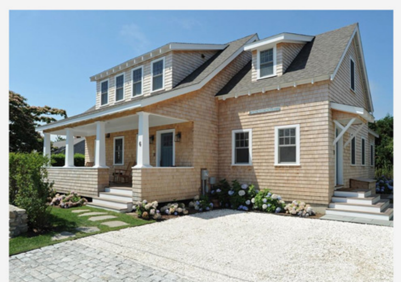
CLIFF 6 Delaney Road $3,498,000