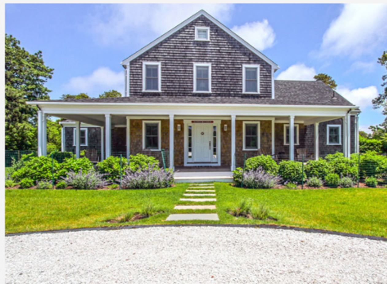
MIACOMET 32 Somerset Lane $4,295,000