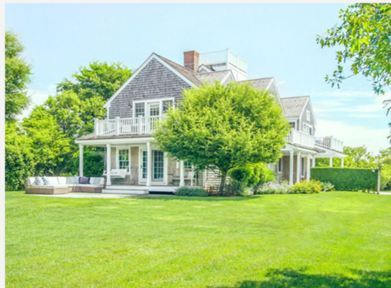
SURFSIDE 12 Pequot Street $3,595,000