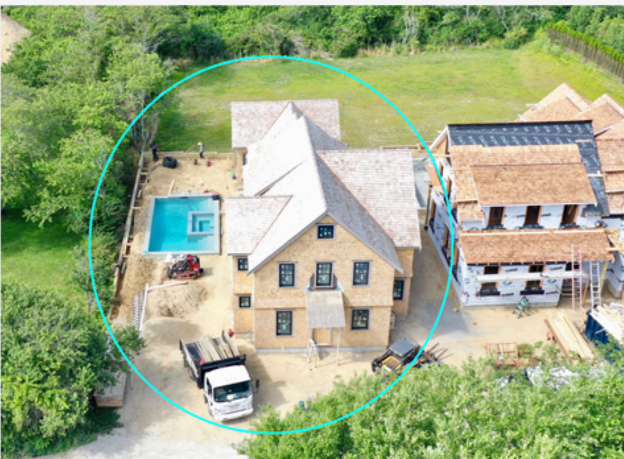
CLIFF 9A Pilgrim Road $4,650,000