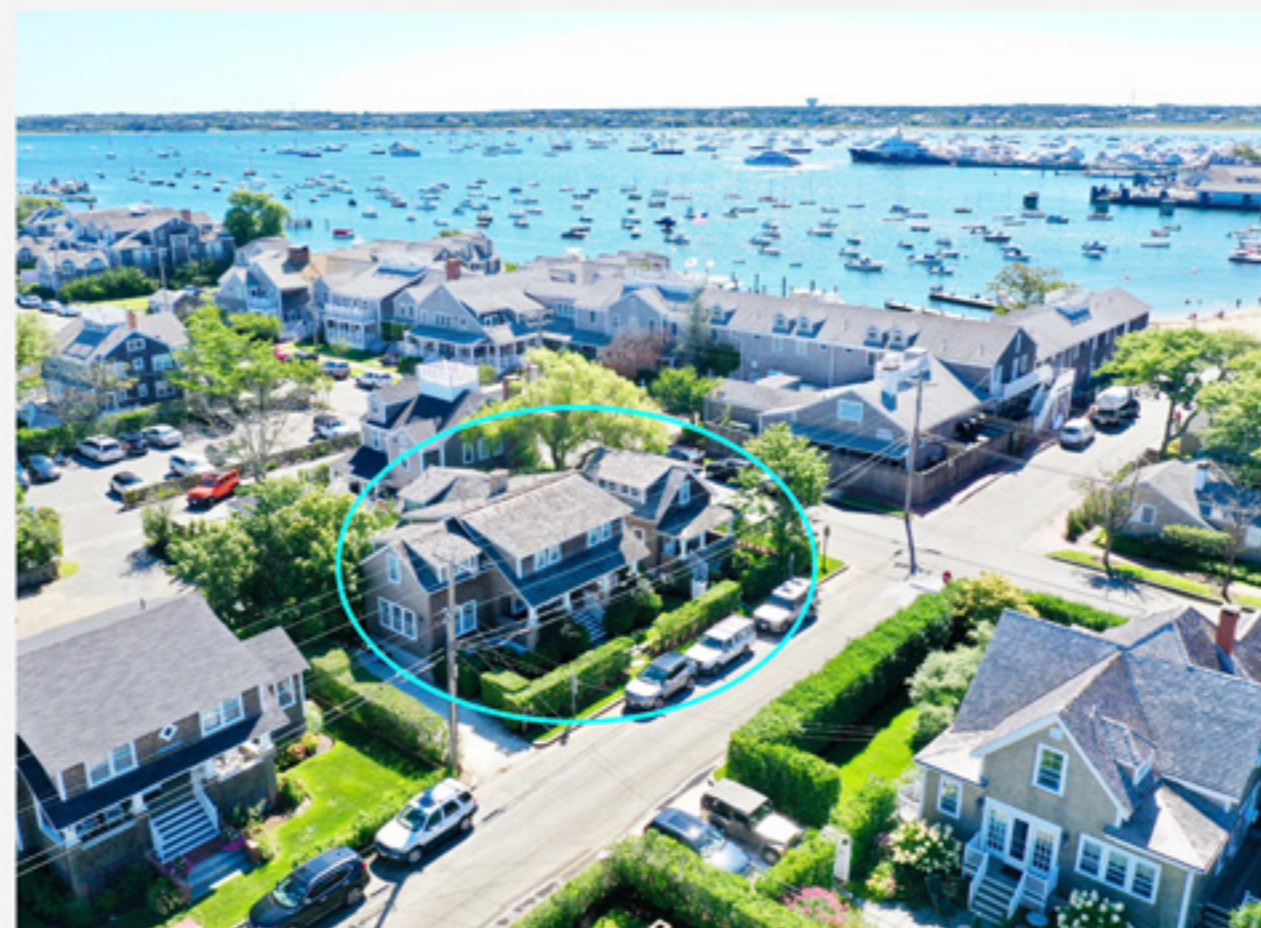
BRANT POINT 1 Walsh Street $3,995,000