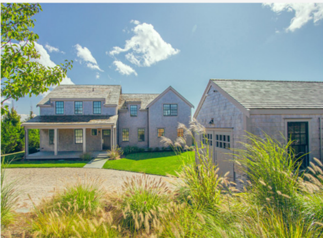
QUIDNET 26 Quidnet Path $4,250,000