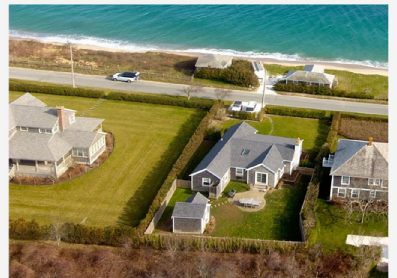
SCONSET 98 Baxter Road $1,675,000

19 Centre Street, Nantucket, MA 508.228.3202 www.jpfc.com