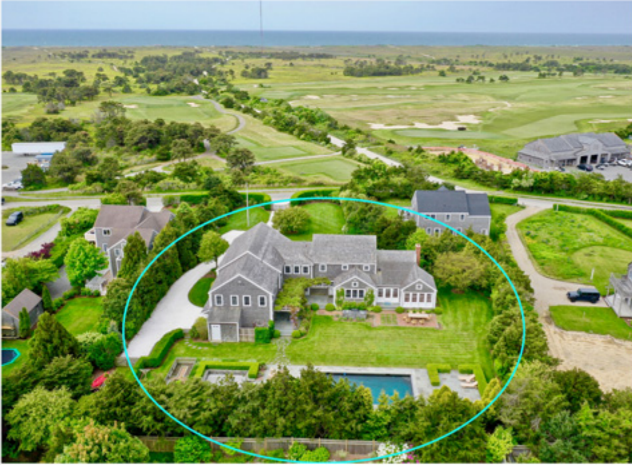
MIACOMET 2 W Miacomet Road $4,995,000