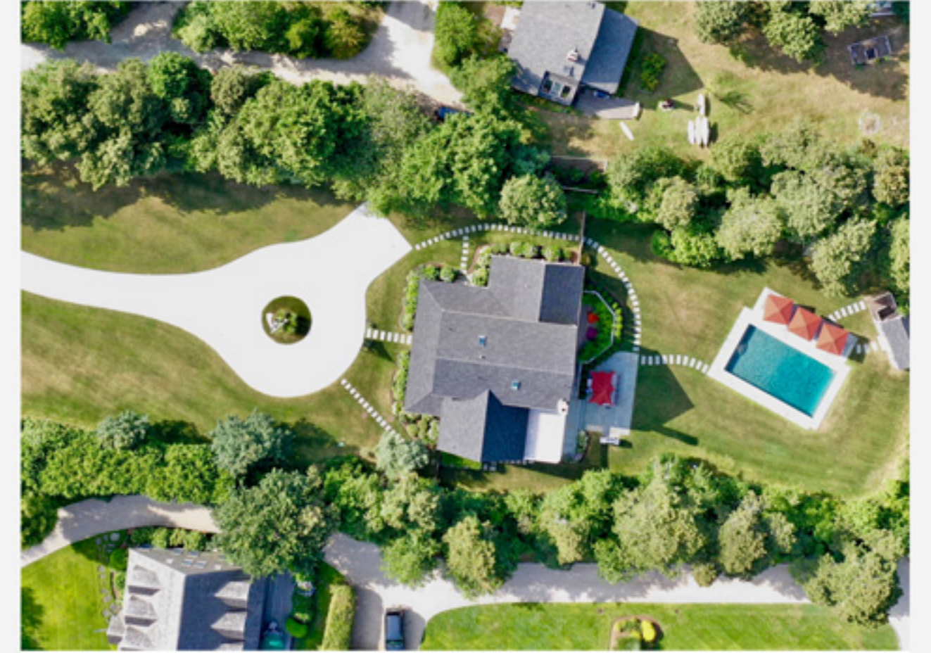
MIACOMET 32 Somerset Lane $4,295,000