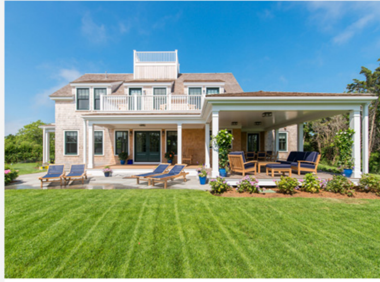
MONOMOY 10 Monomoy Creek Road $5,495,000