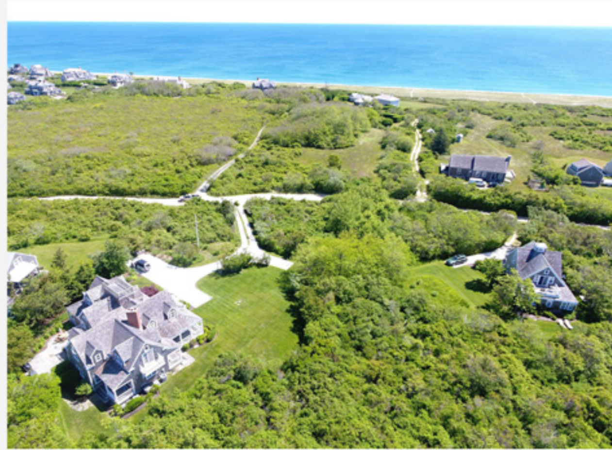
SQUAM 60 Squam Road $4,995,000