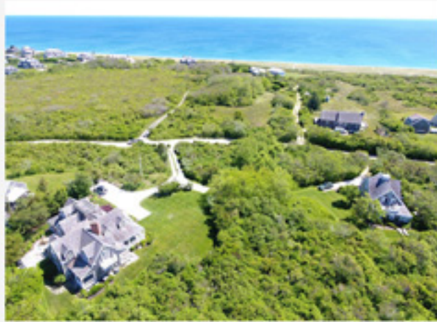
SQUAM 60 Squam Road $4,995,000