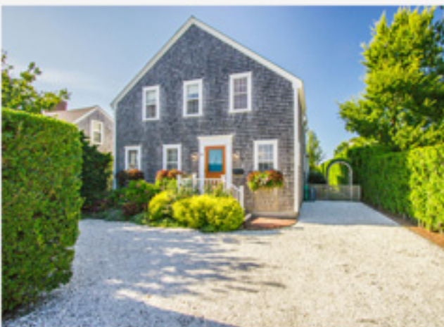
TOWN 39 Milk Street $2,495,000