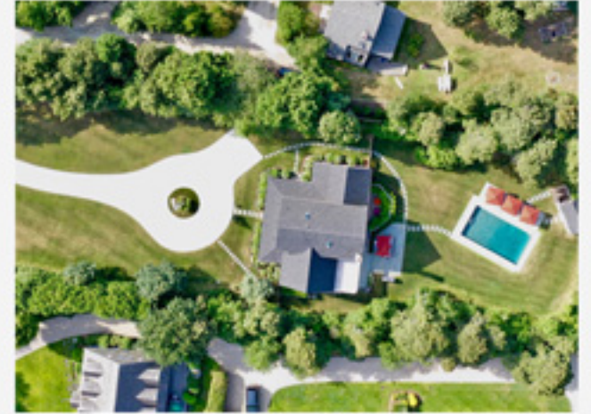
MIACOMET 32 Somerset Lane $4,295,000