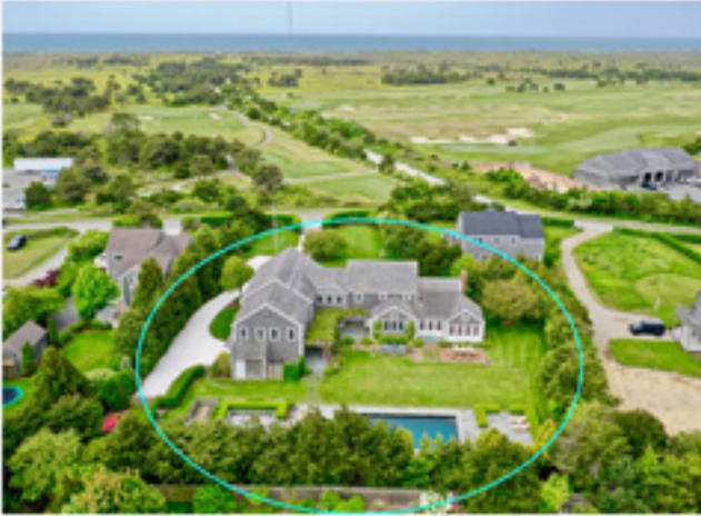
MIACOMET 2 W Miacomet Road $4,995,000