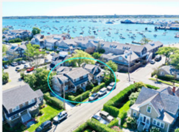
BRANT POINT 1 Walsh Street $3,995,000