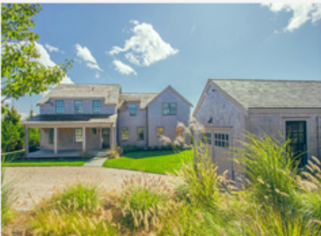
QUIDNET 26 Quidnet Path $4,250,000