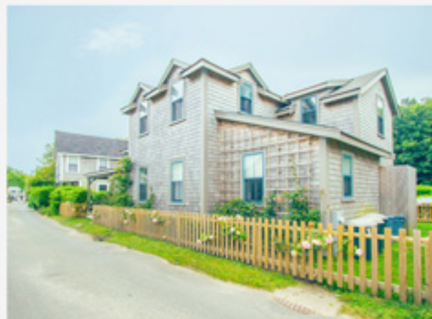
SCONSET 12 Shell Street $2,195,000