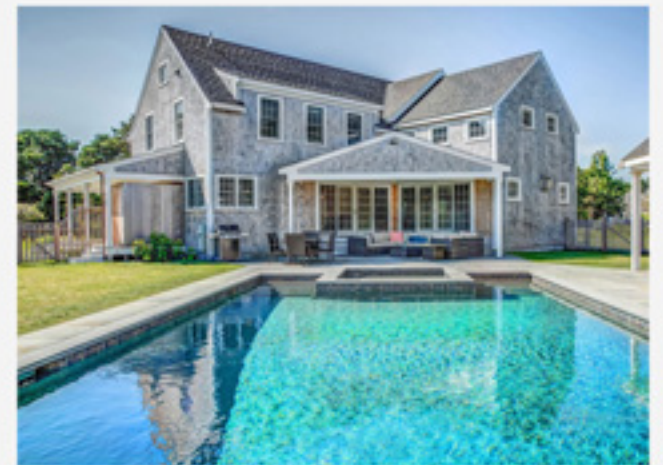
SURFSIDE 50 Lovers Lane $3,300,000