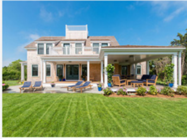
MONOMOY 10 Monomoy Creek Road $5,495,000