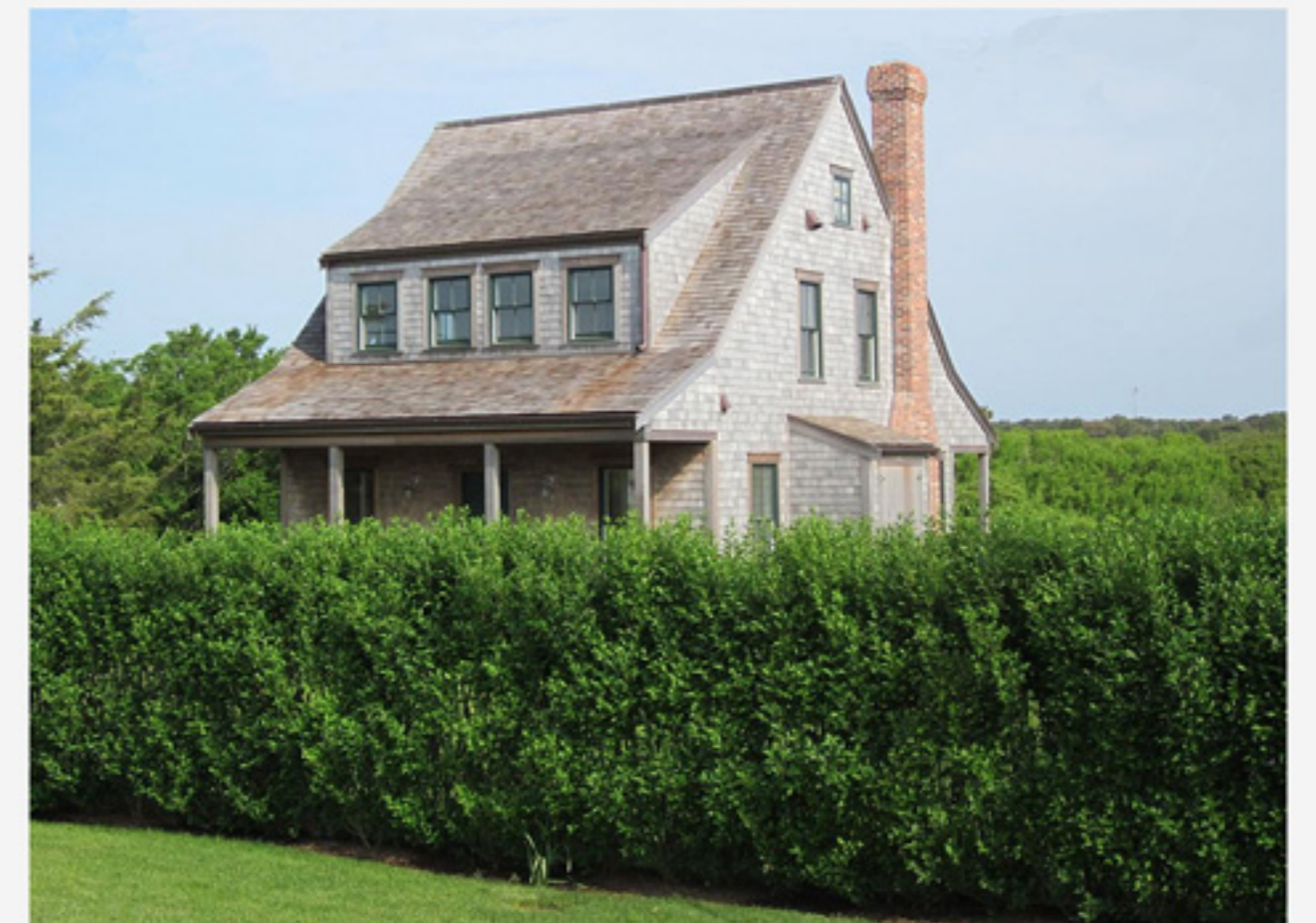
CISCO 11 Hummock Pond Road $1,424,000