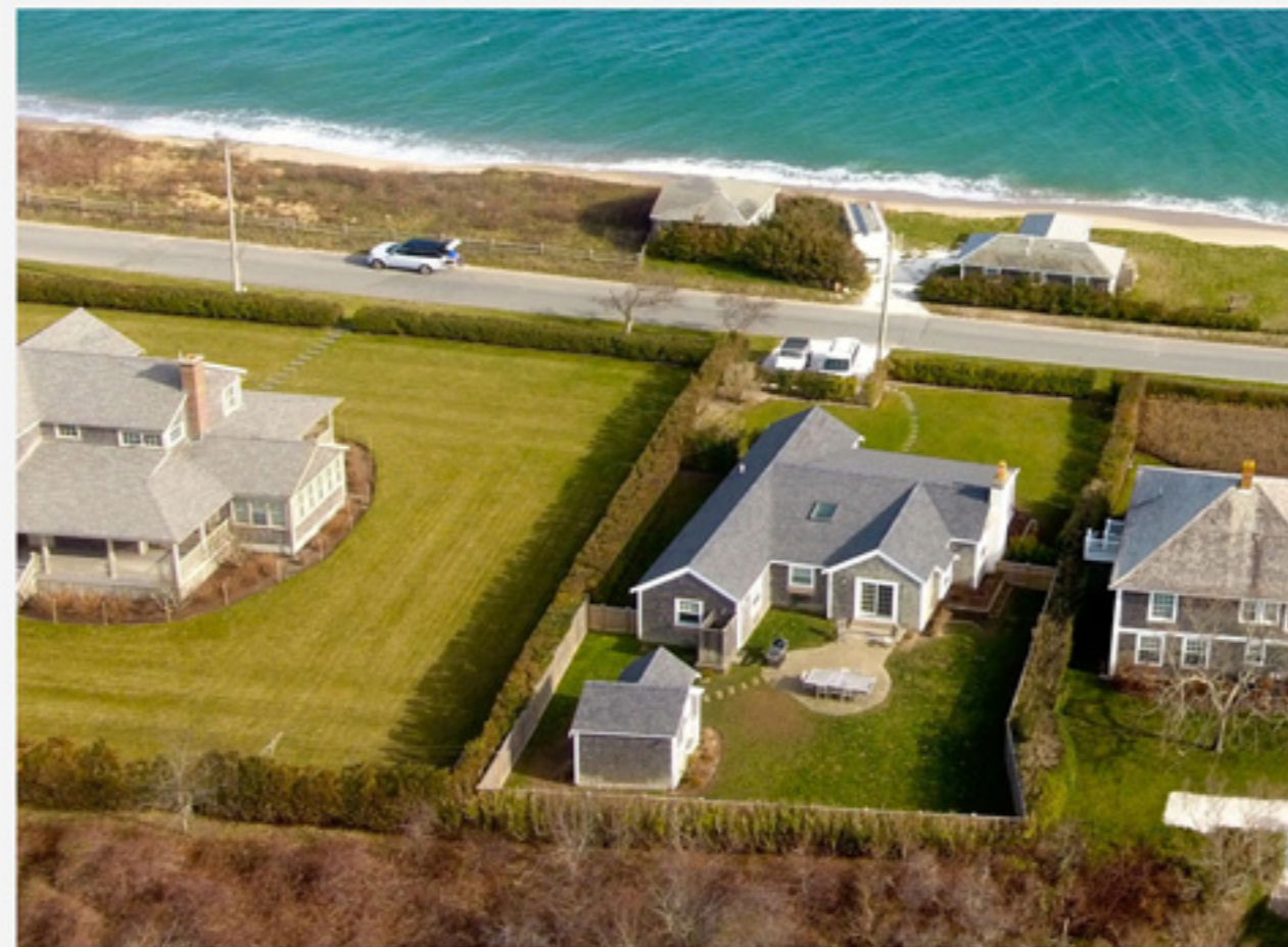
SCONSET 98 Baxter Road $1,675,000