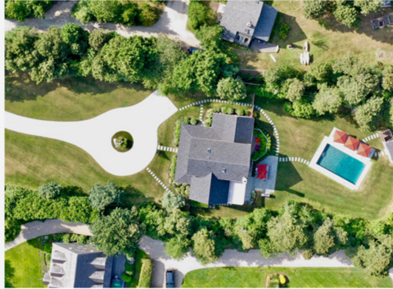
MIACOMET 32 Somerset Lane $4,295,000