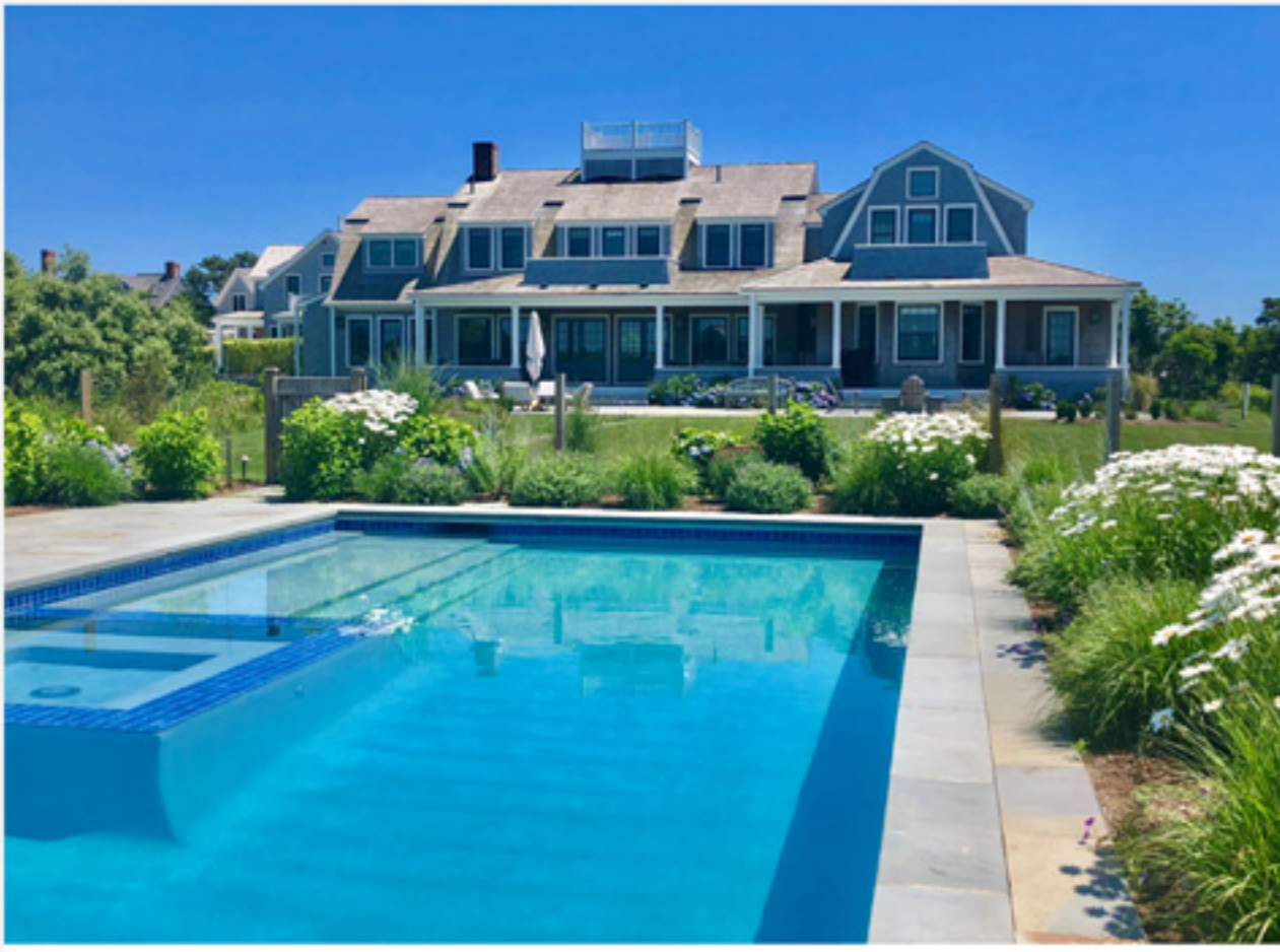
MONOMOY 12 Monomoy Creek Road $15,995,000