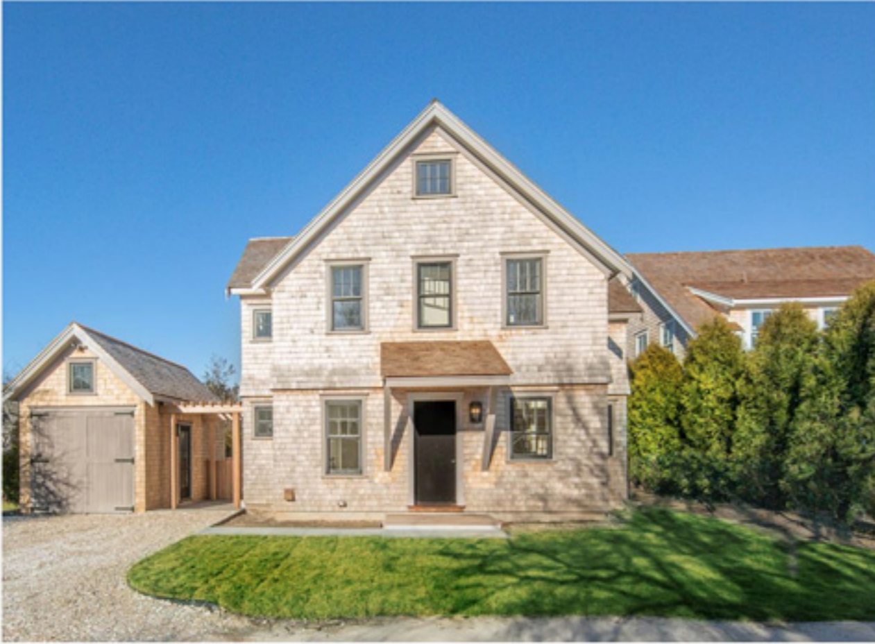
CLIFF 9B Pilgrim Road $4,695,000