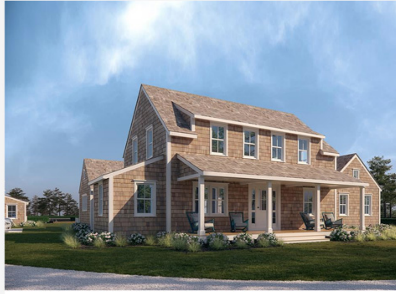
SURFSIDE 22 Boulevarde $5,995,000