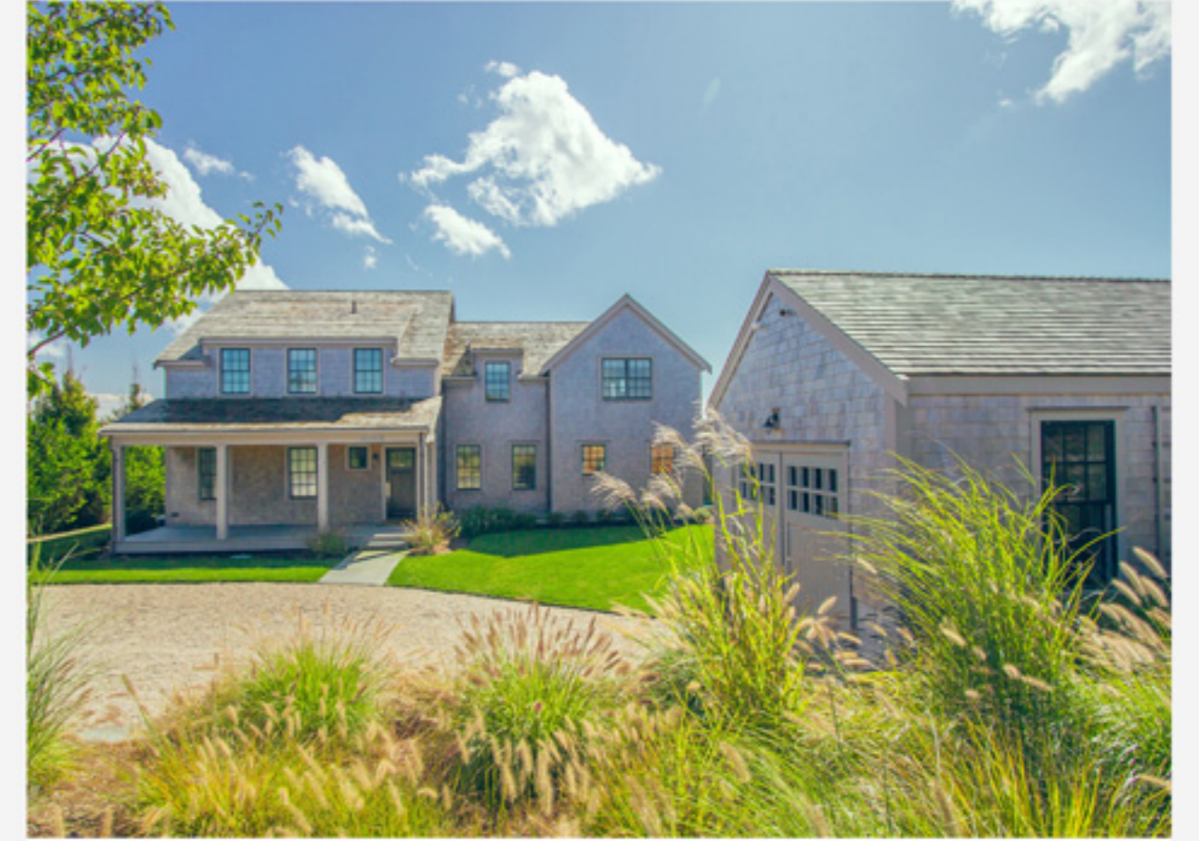
QUIDNET 26 Quidnet Path $4,250,000