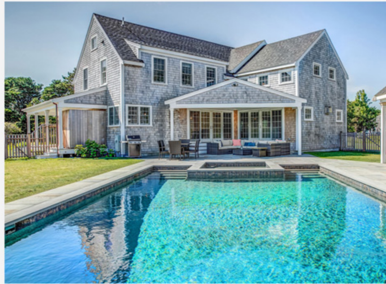
SURFSIDE 50 Lovers Lane $3,300,000