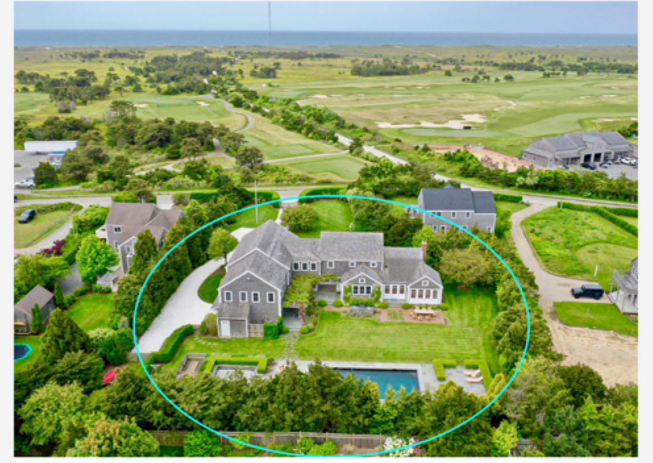
MIACOMET 2 W Miacomet Road $4,995,000