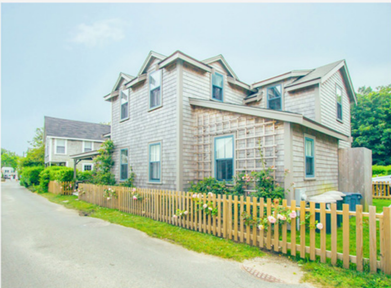
SCONSET 12 Shell Street $2,195,000