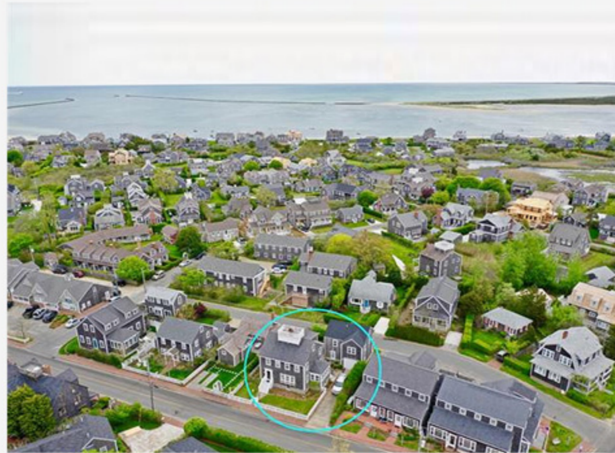
BRANT POINT 3 North Beach Street $3,495,000