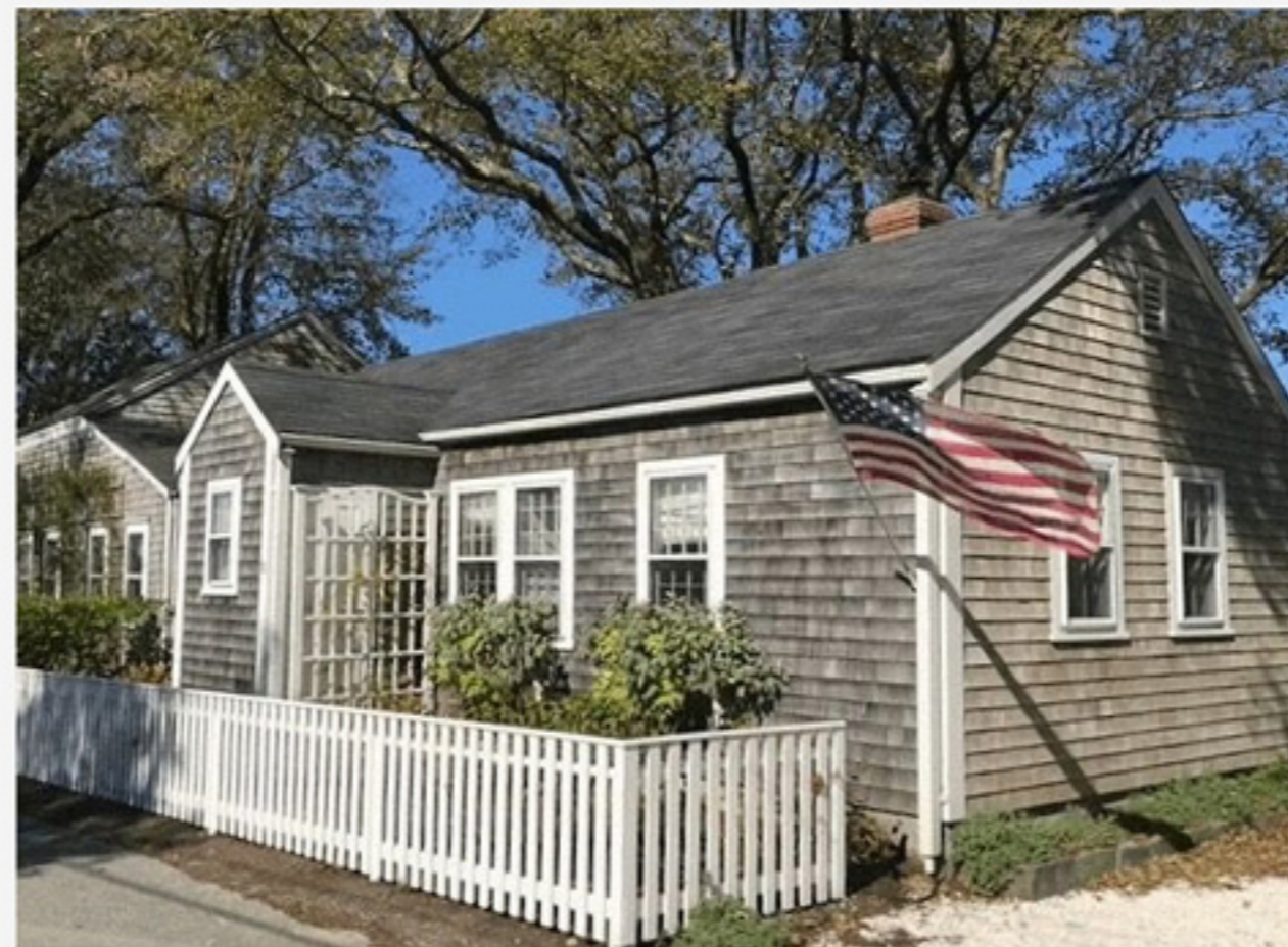
TOWN 15 Vestal Street #1 $1,895,000