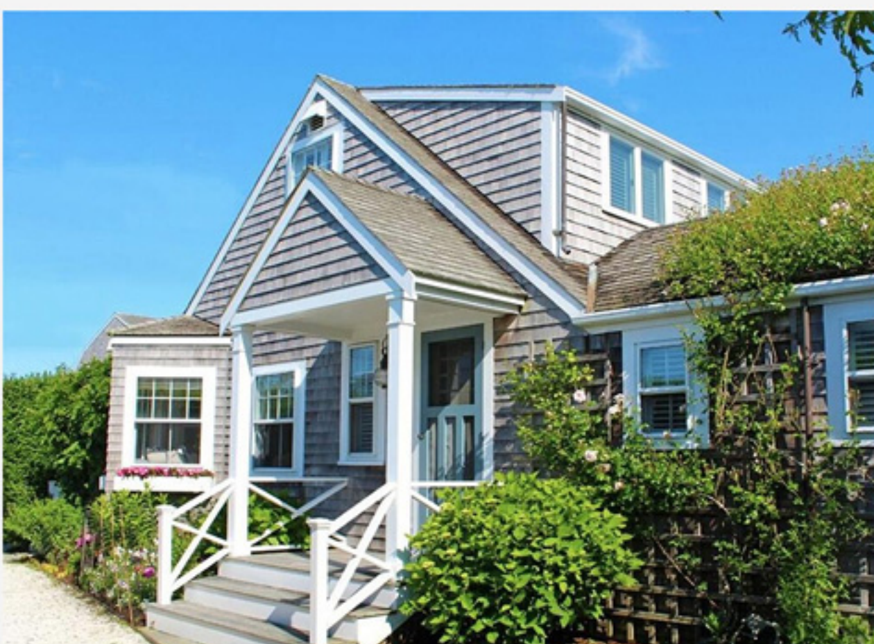
SCONSET 28 Morey Lane $2,875,000