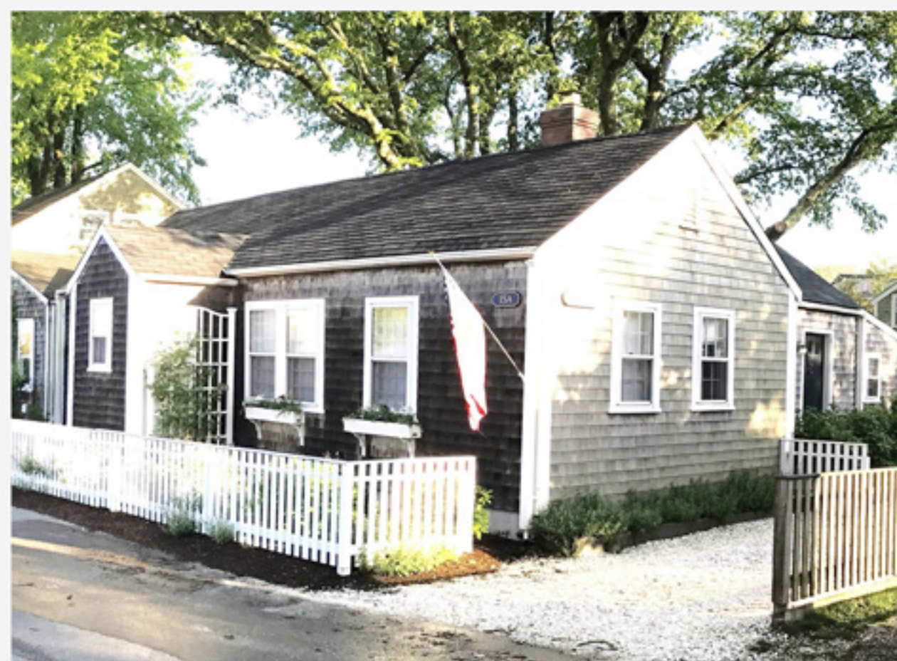
TOWN 15 Vestal Street #1 $1,895,000