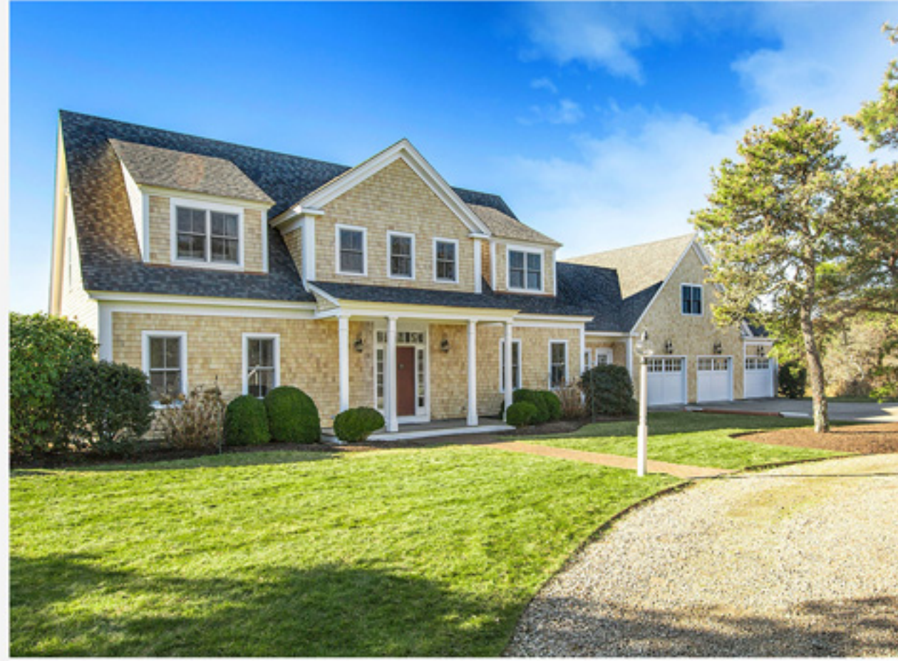
SURFSIDE 1 Waterview Drive $4,375,000