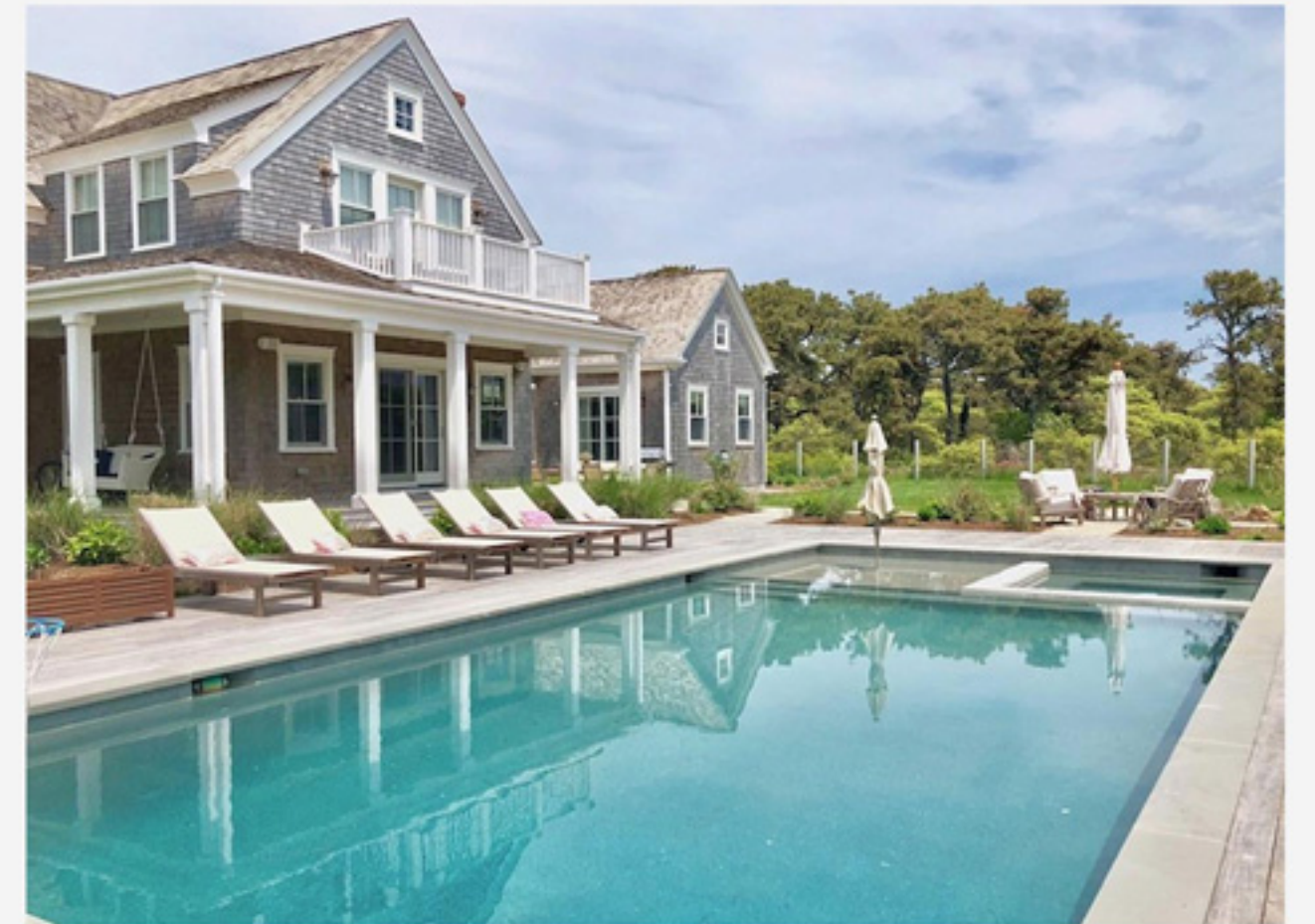
SURFSIDE 5 Monohansett Road $3,295,000