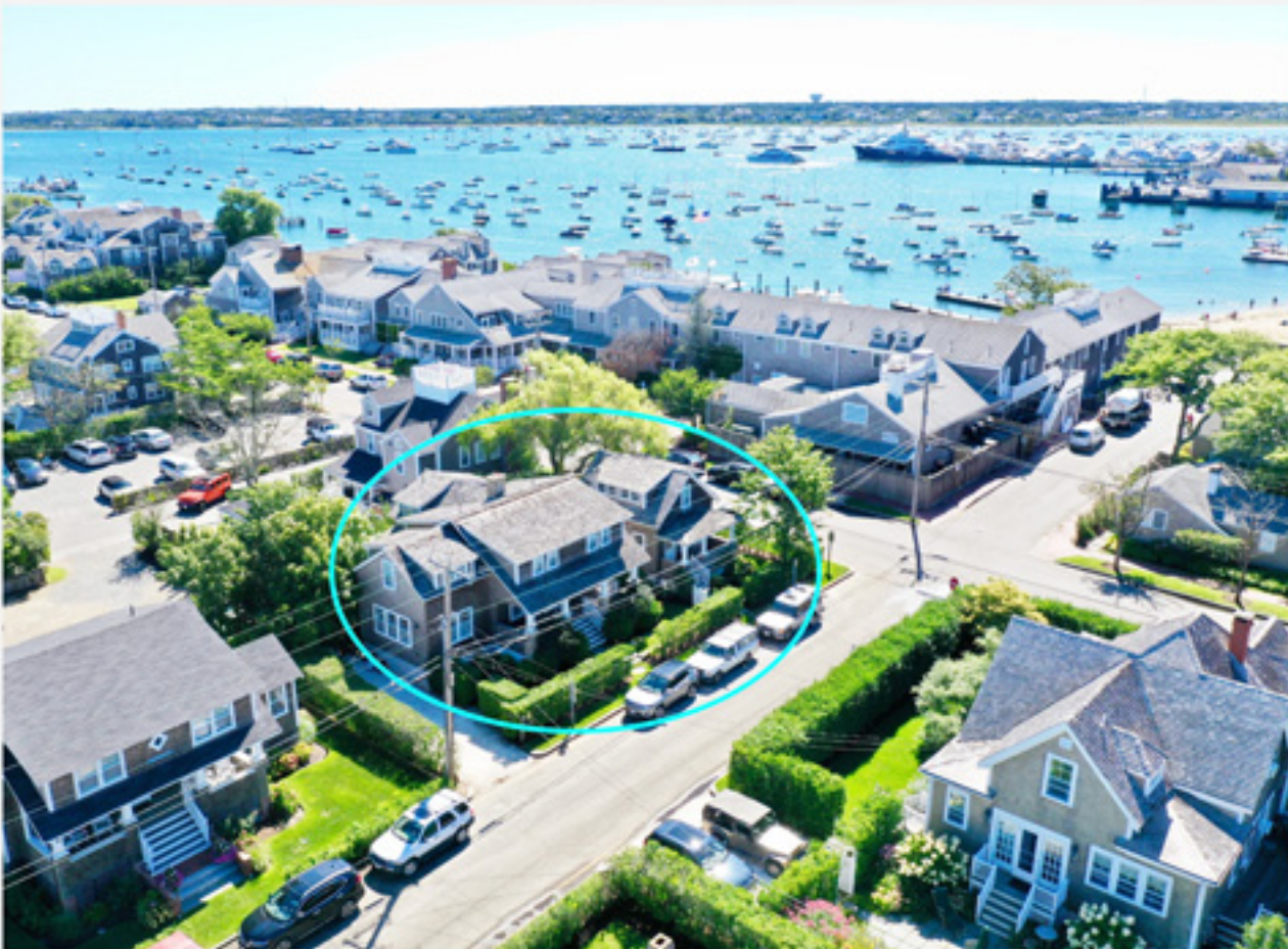
BRANT POINT 1 Walsh Street $3,695,000