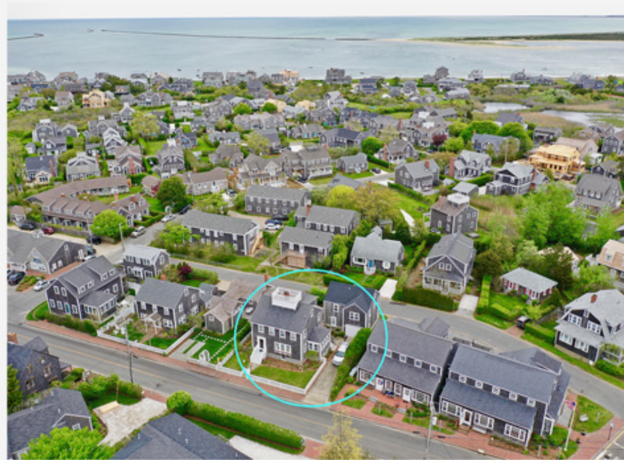
BRANT POINT 3 North Beach Street $3,495,000