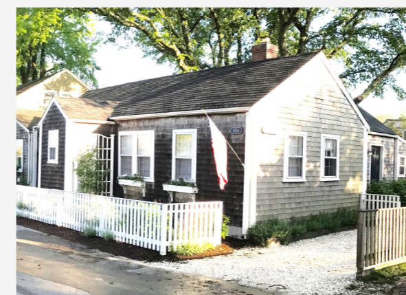
TOWN 15 Vestal Street #1 $1,895,000