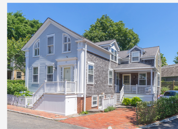
MONOMOY 26 Pine Street $3,495,000