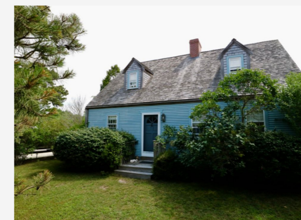
SURFSIDE 111 Surfside Road $1,495,000