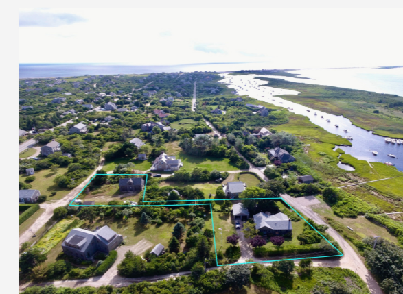
MADAKET 8 M Street $2,499,000