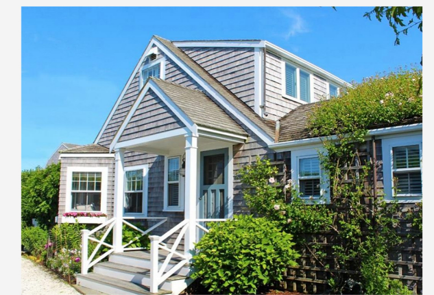
SCONSET 28 Morey Lane $2,875,000