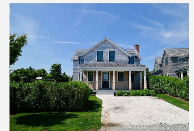
SOUTH OF TOWN 9 Finback Lane $2,195,000