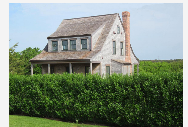
CISCO 111 Hummock Pond Road $1,424,000