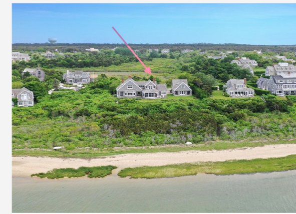
MONOMOY 56 Monomoy Road $20,000,000

Search by your vacation dates! Add filters to match your ideal locations, bedroom count and price point.