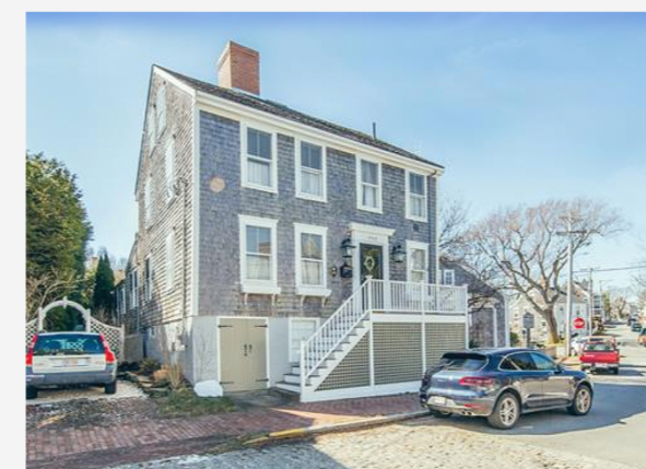
TOWN 28 North Water Street $2,845,000