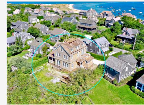
BRANT POINT 34 Walsh Street $4,995,000