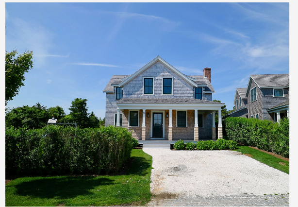
SOUTH OF TOWN 9 Finback Lane $2,195,000