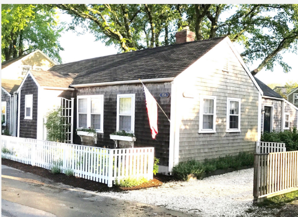
TOWN 15 Vestal Street #1 $1,895,000