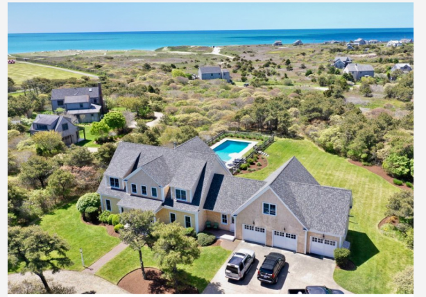
SURFSIDE 1 Waterview Drive $3,995,000