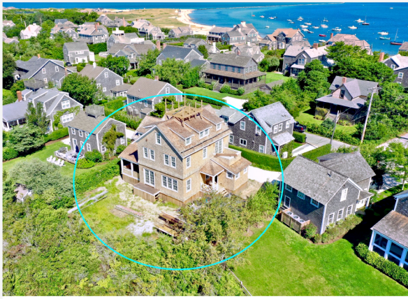
BRANT POINT 34 Walsh Street $4,995,000