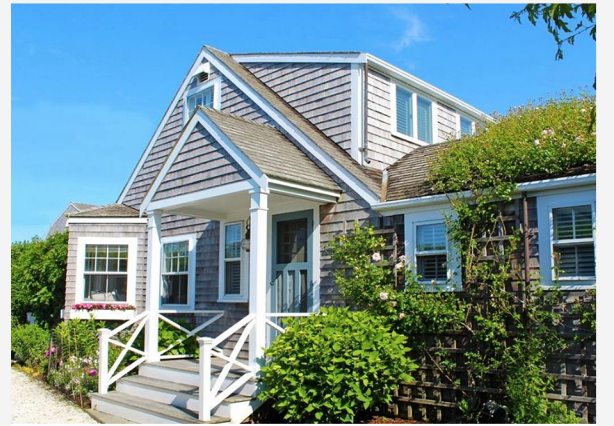
SCONSET 28 Morey Lane $2,875,000