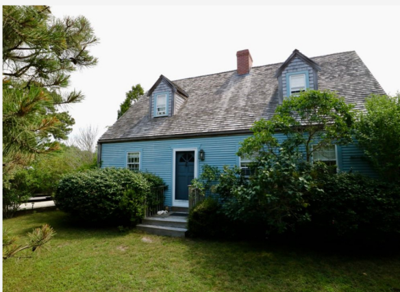
SURFSIDE 111 Surfside Road $1,495,000