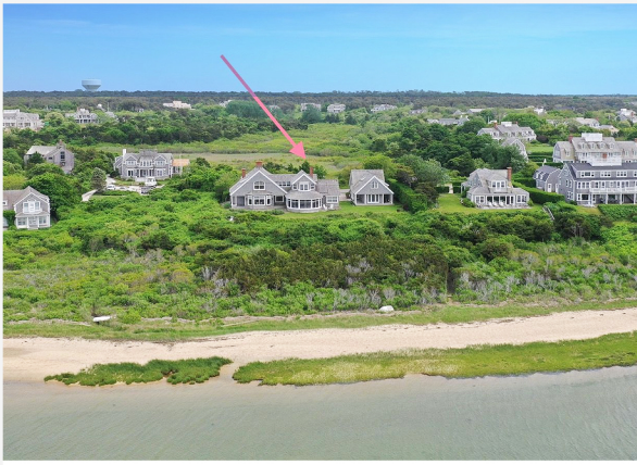
MONOMOY 56 Monomoy Road $20,000,000