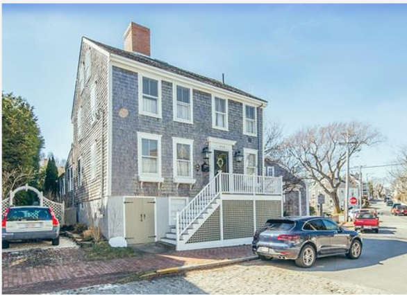
TOWN 28 North Water Street $2,845,000