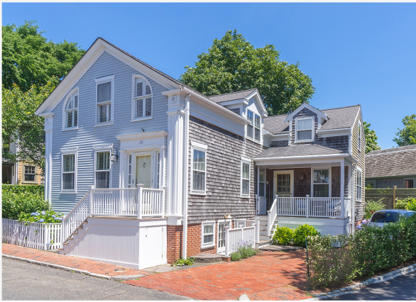
TOWN 26 Pine Street $3,495,000