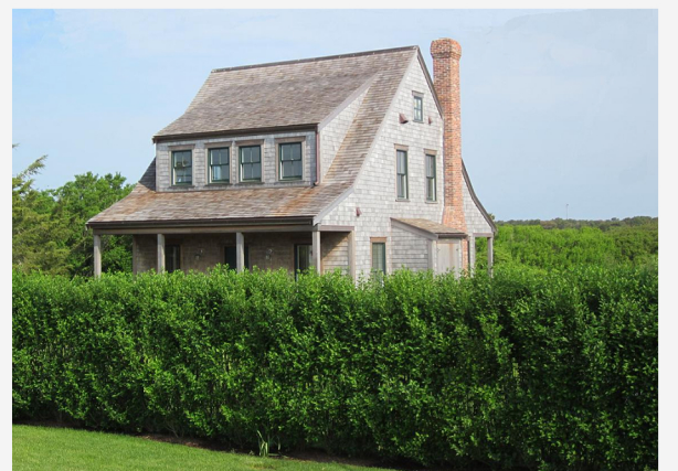
CISCO 111 Hummock Pond Road $1,424,000