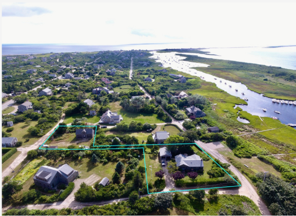
MADAKET 8 M Street $2,499,000