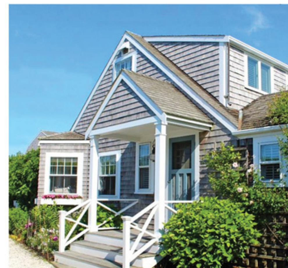
SCONSET 28 Morey Lane Listing Price: $2,875,000