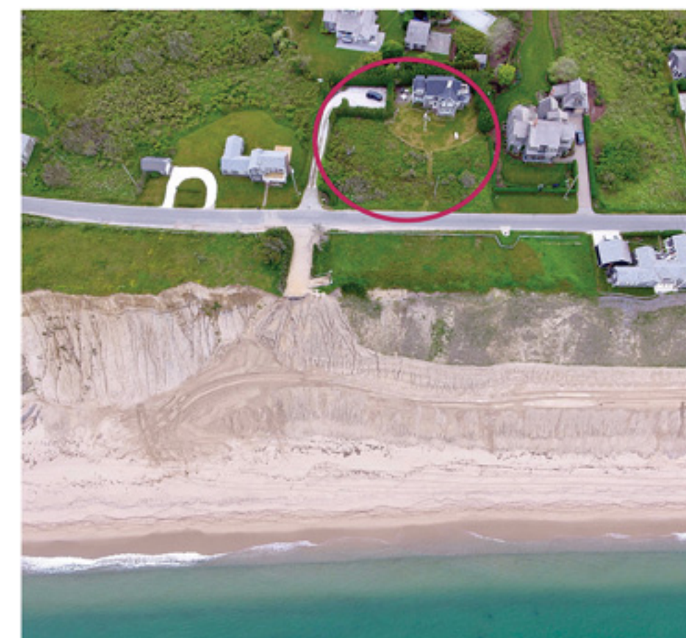
SCONSET 90 Baxter Road Listing Price: $1,995,000