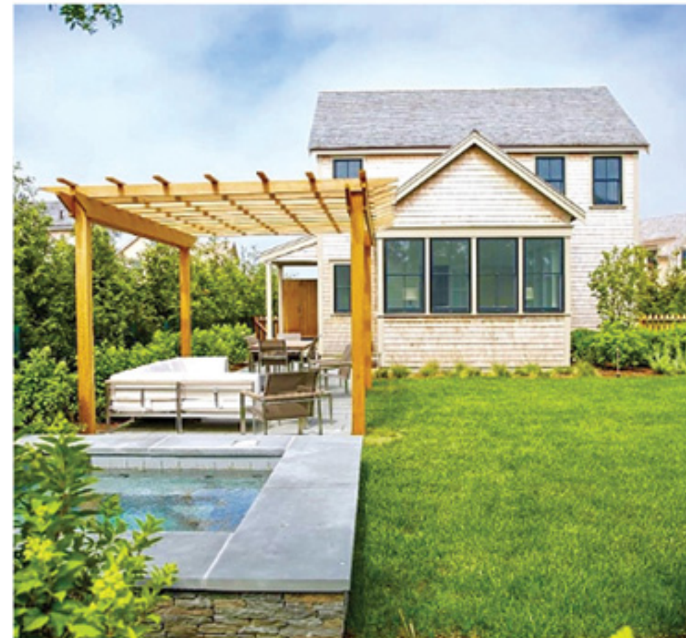
BEACH PLUM 2 CRANBERRY LANE 4 beds / 4 baths 1 half Weekly Price: $5,000 – $13,000