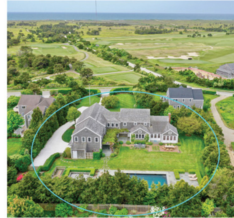
MIACOMET 2 W Miacomet Listing Price: $4,495,000