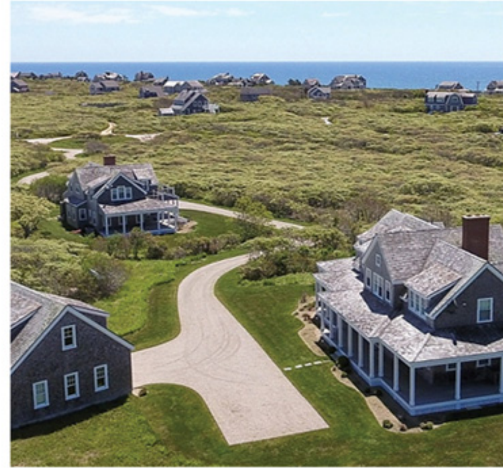
TOM NEVERS 12 VAN FLEET CIRCLE 7 beds / 10 bath 1 half Weekly Price: $14,000 – $17,000