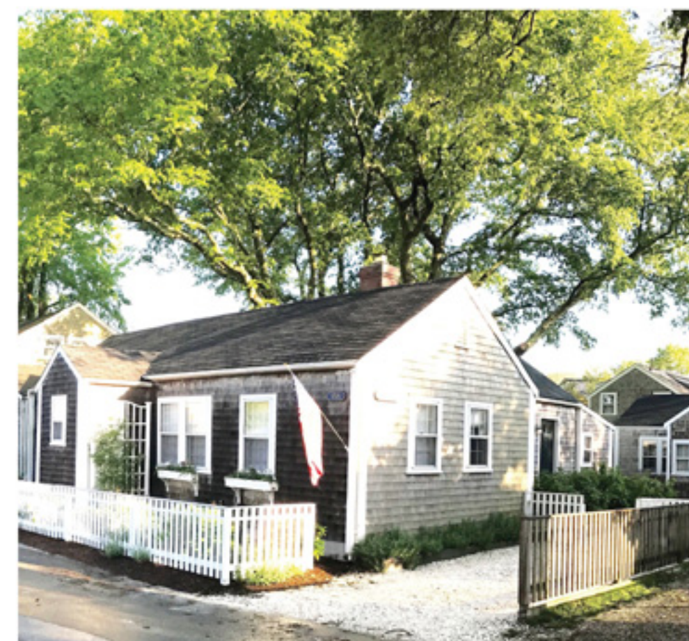
TOWN 15 Vestal Street Listing Price: $3,595,000