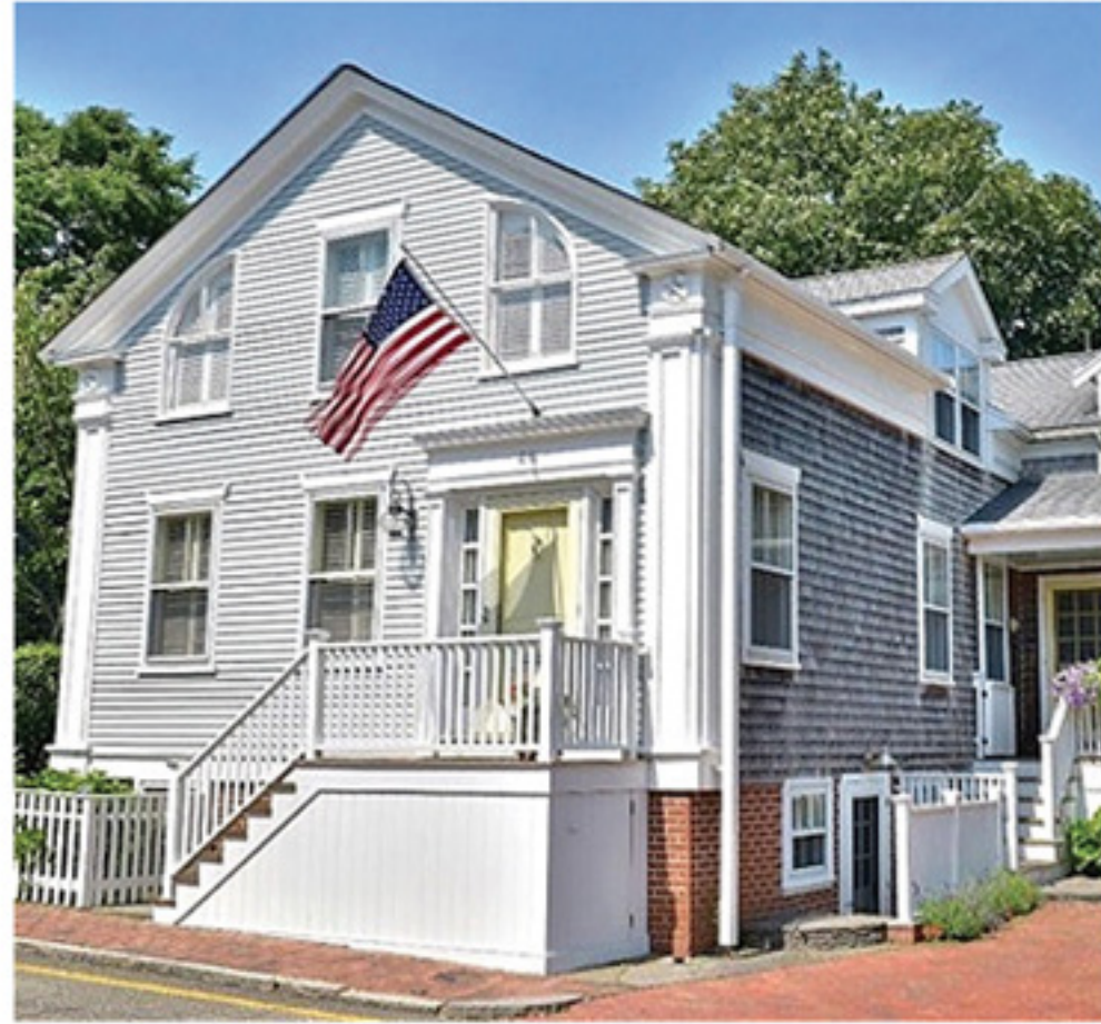
TOWN 26 PINE STREET 4 beds / 4 baths 1 half Weekly Price: $6,000 – $12,500