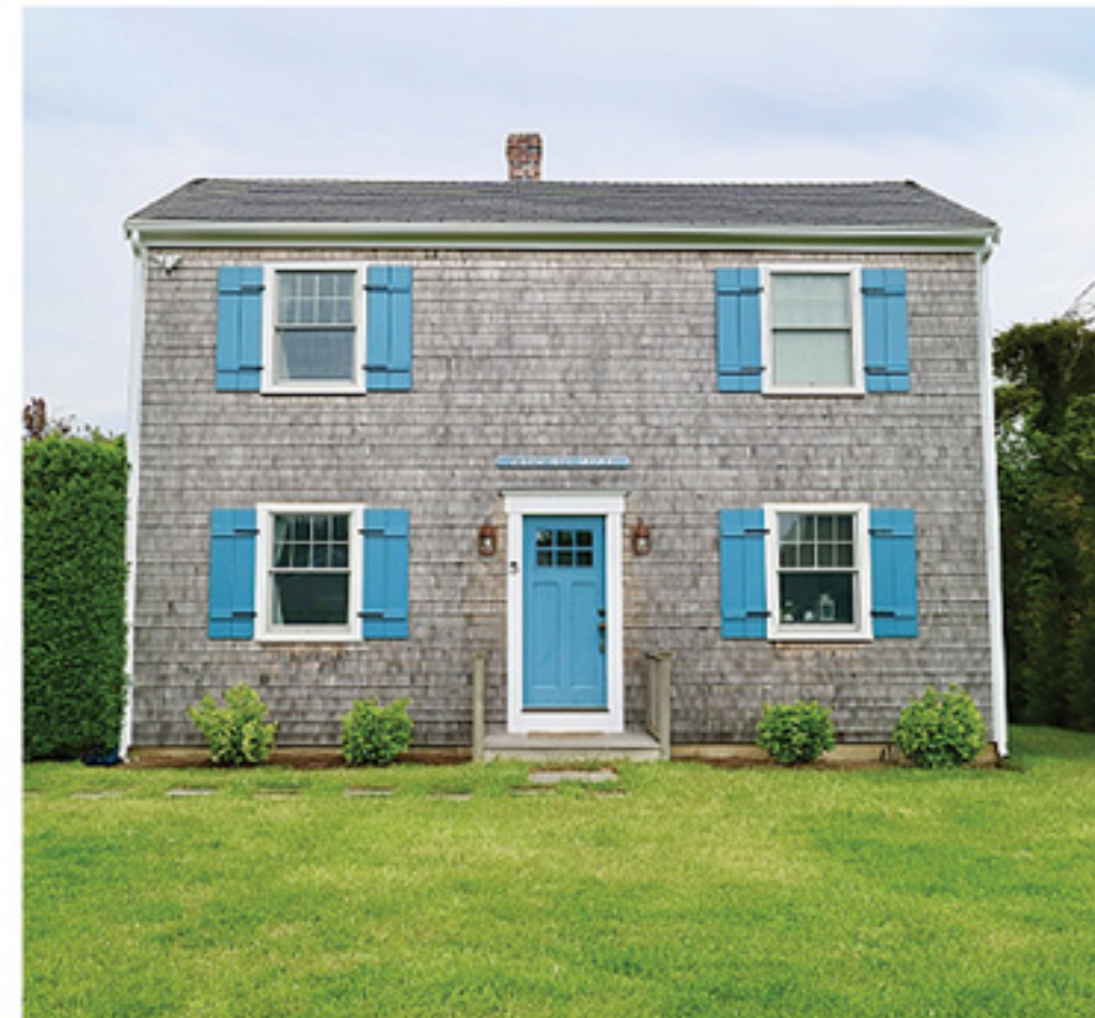
SURFSIDE 5 TASHAMA LANE 3 beds / 2 baths Weekly Price: $4,000 – $5,000