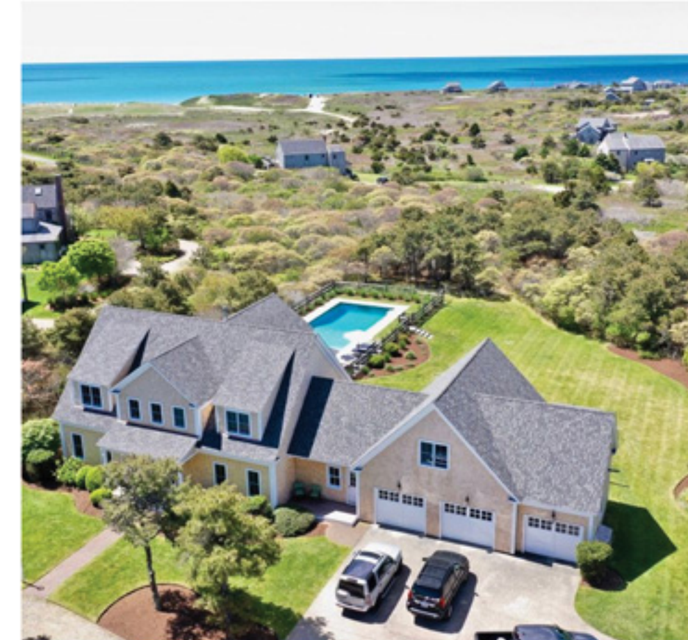
SURFSIDE 1 Waterview Drive Listing Price: $3,995,000