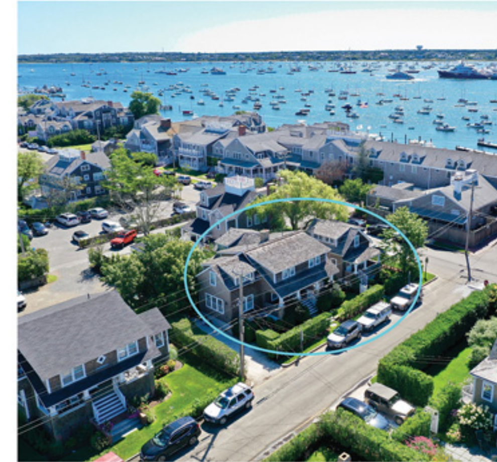
BRANT POINT 1 Walsh Street Listing Price: $3,695,000