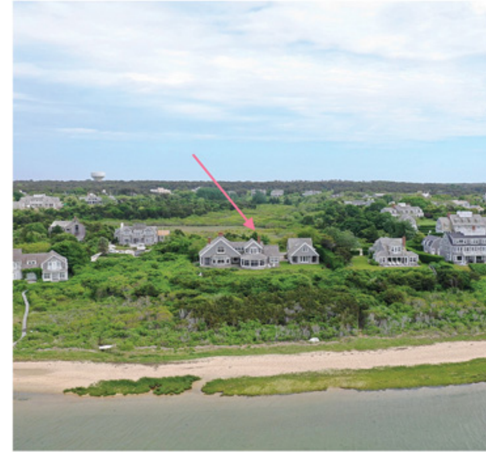
MONOMOY 56 Monomoy Road Listing Price: $20,000,000