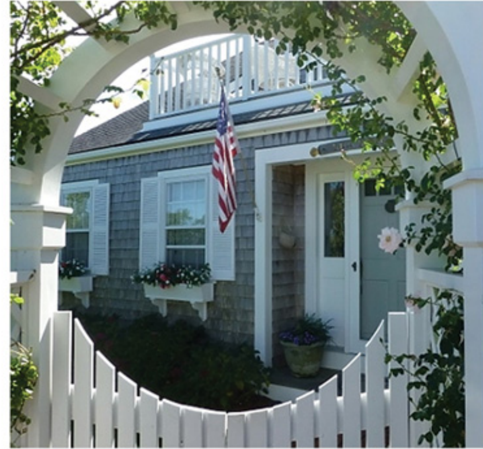
BRANT POINT 4 STONE BARN 2 beds / 3 baths Weekly Price: $7,000 – $11,500