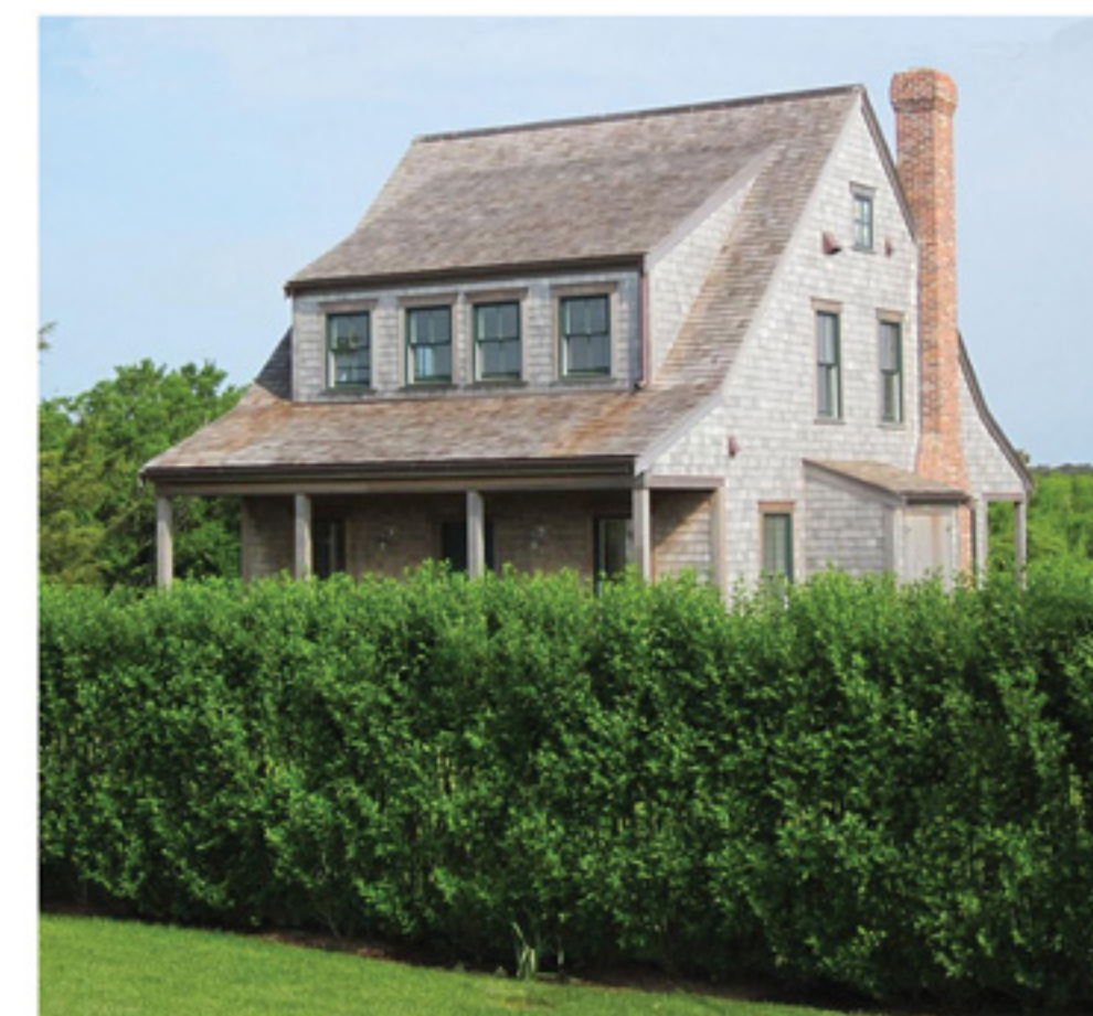
CISCO 111 Hummock Pond Listing Price: $1,424,000