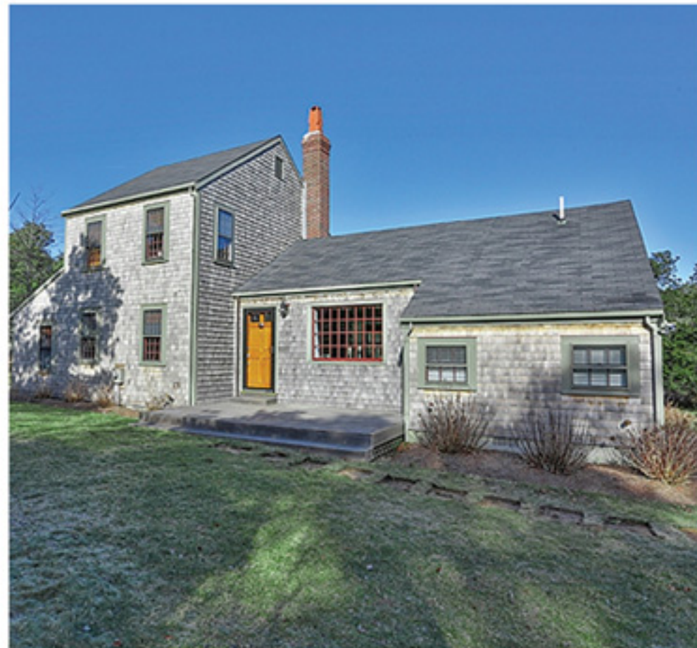
MIACOMET 79 SOMERSET ROAD 3 beds / 2 baths Weekly Price: $7,800 – $10,000