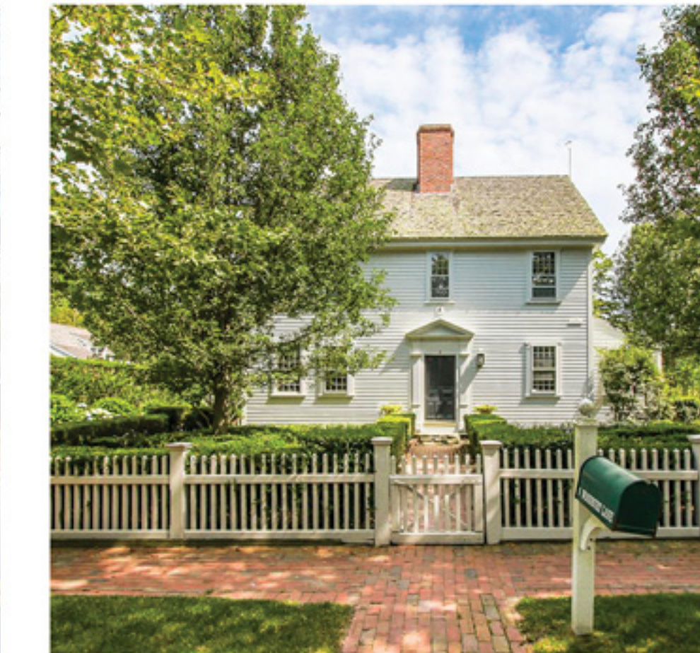
TOWN 6 Woodbury Lane Listing Price: $3,895,000