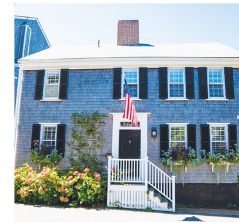
TOWN 3 Traders Lane Listing Price: $4,695,000