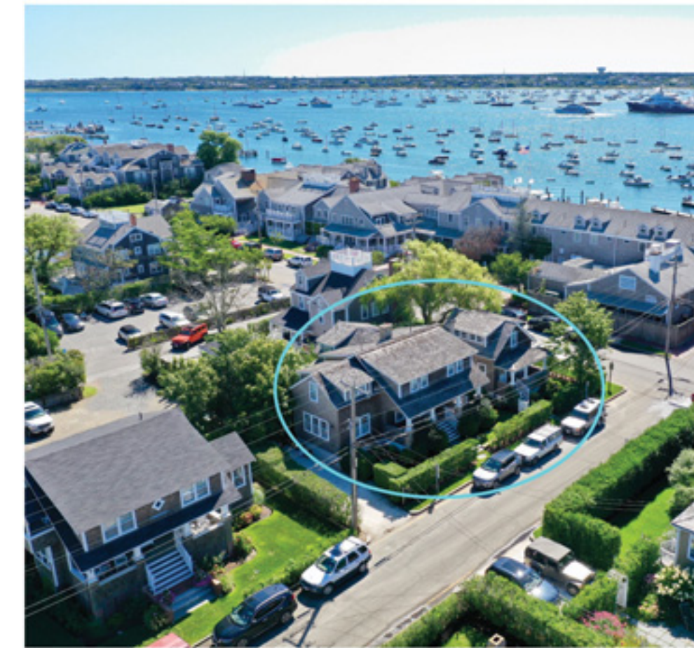
BRANT POINT 1 Walsh Street Listing Price: $3,795,000