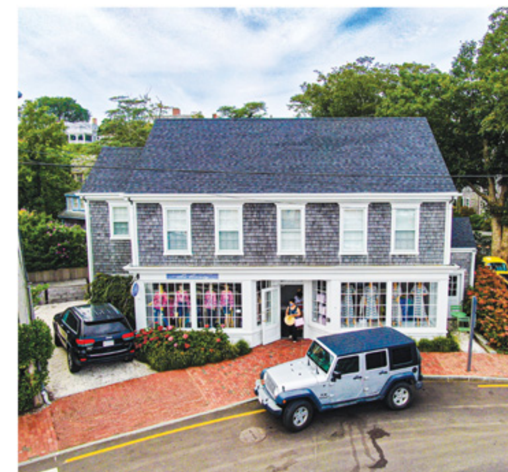
TOWN 11 Washington Street & 8a Union Listing Price: $3,995,000