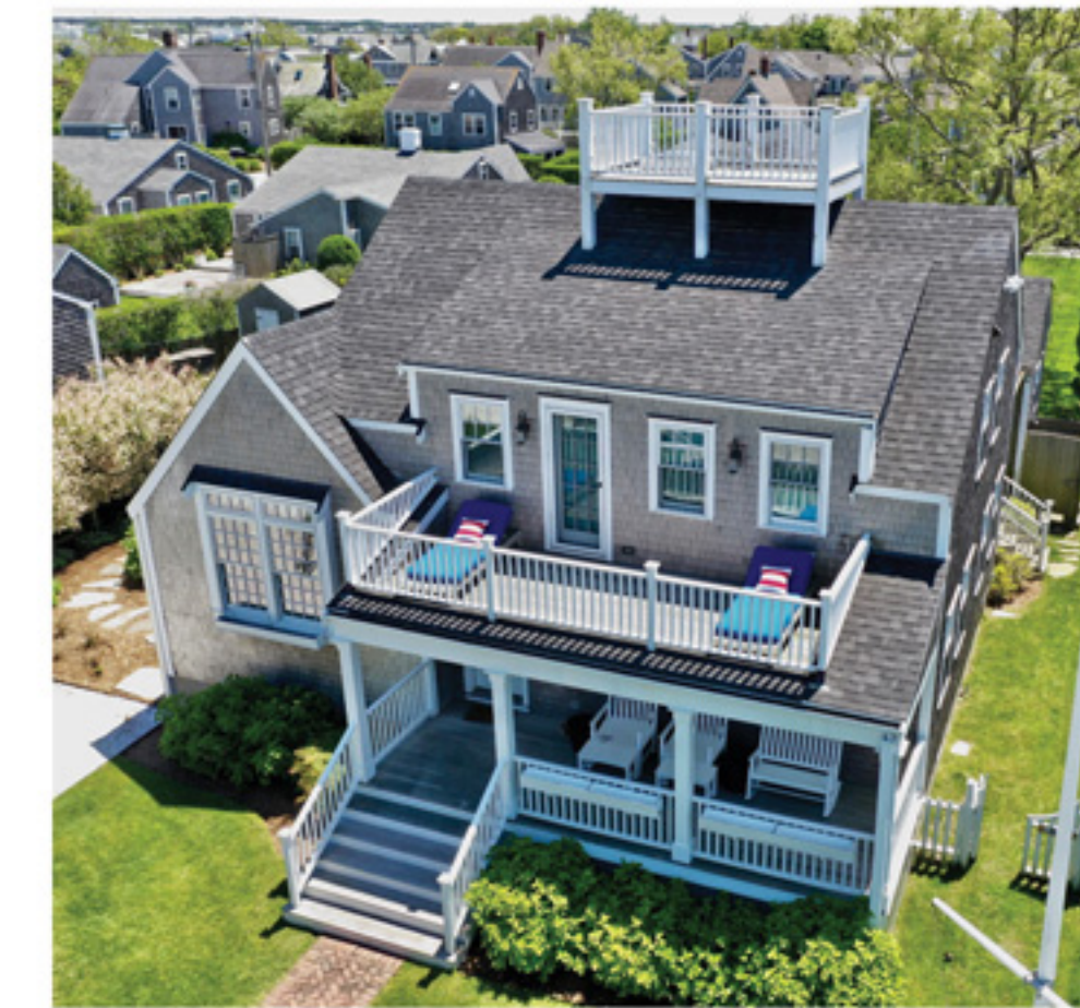
BRANT POINT 8 Galen Avenue Listing Price: $4,895,000