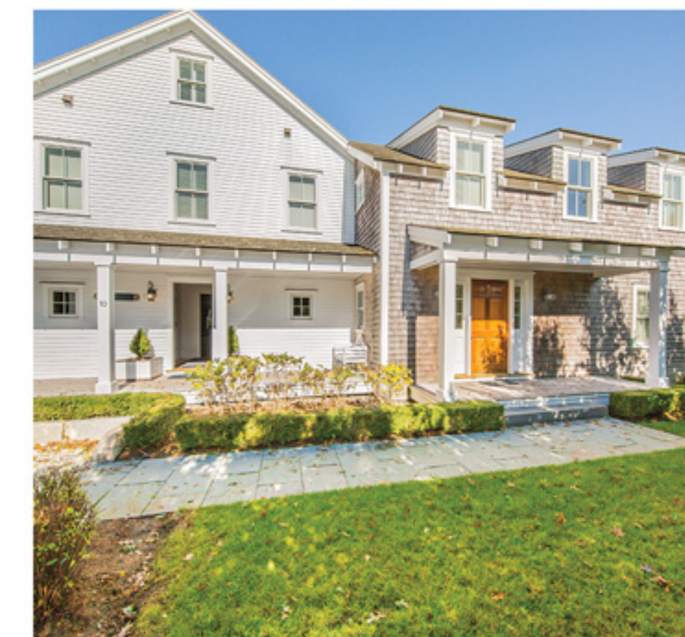
CLIFF 10 Old Westmoor Farm Road Listing Price: $8,325,000