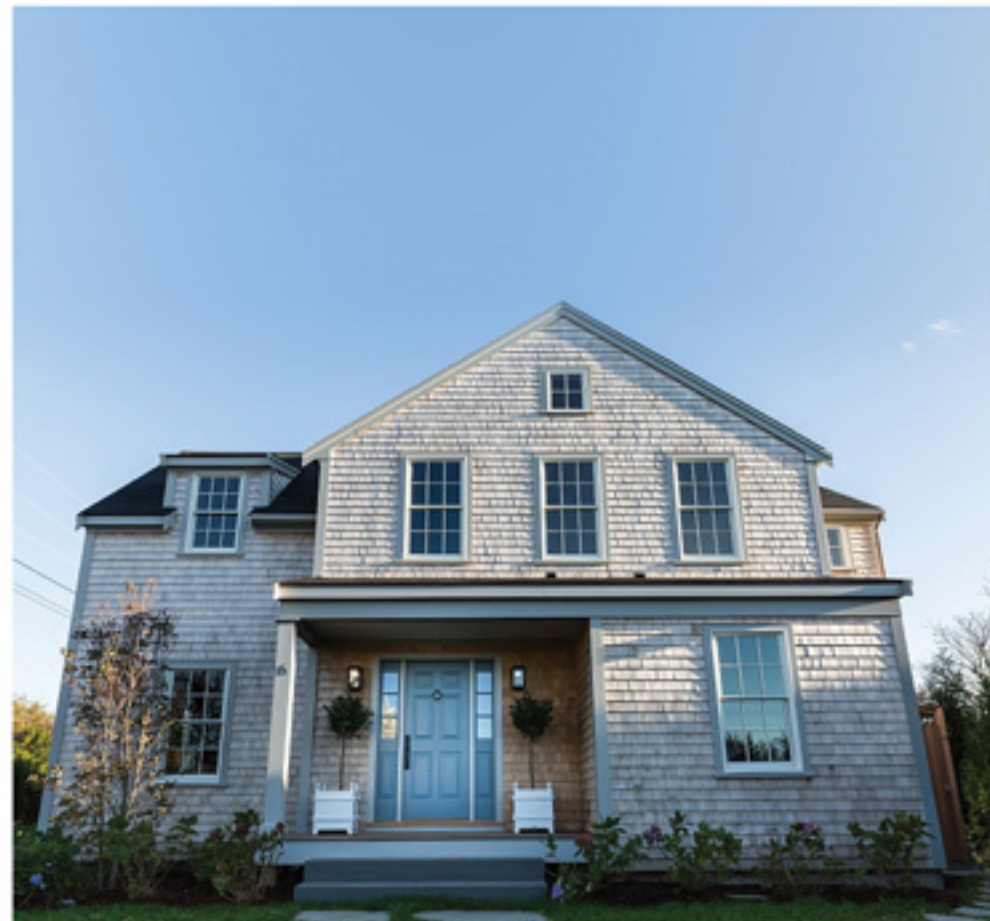
TOWN 6 NEW LANE 5 beds / 5 baths 1 half Weekly Price: $18,500 – $30,000