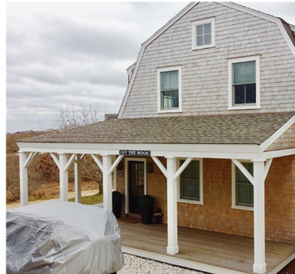
TOM NEVERS 35 FLINTLOCK ROAD 3 beds / 3 baths Weekly Price: $10,000 – $12,500