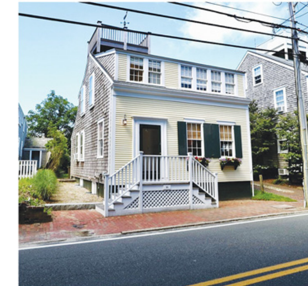
CLIFF 22 Cliff Road Listing Price: $2,149,000