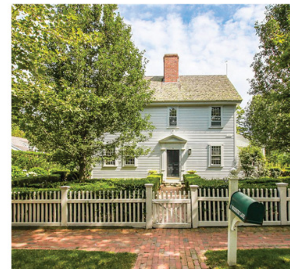
TOWN 6 Woodbury Lane Listing Price: $3,895,000