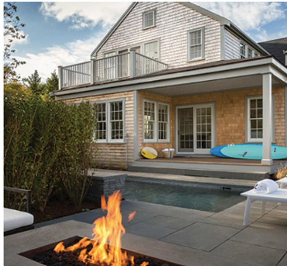
TOWN 6 NEW LANE 5 beds / 5 baths 1 half Weekly Price: $18,500 – $30,000