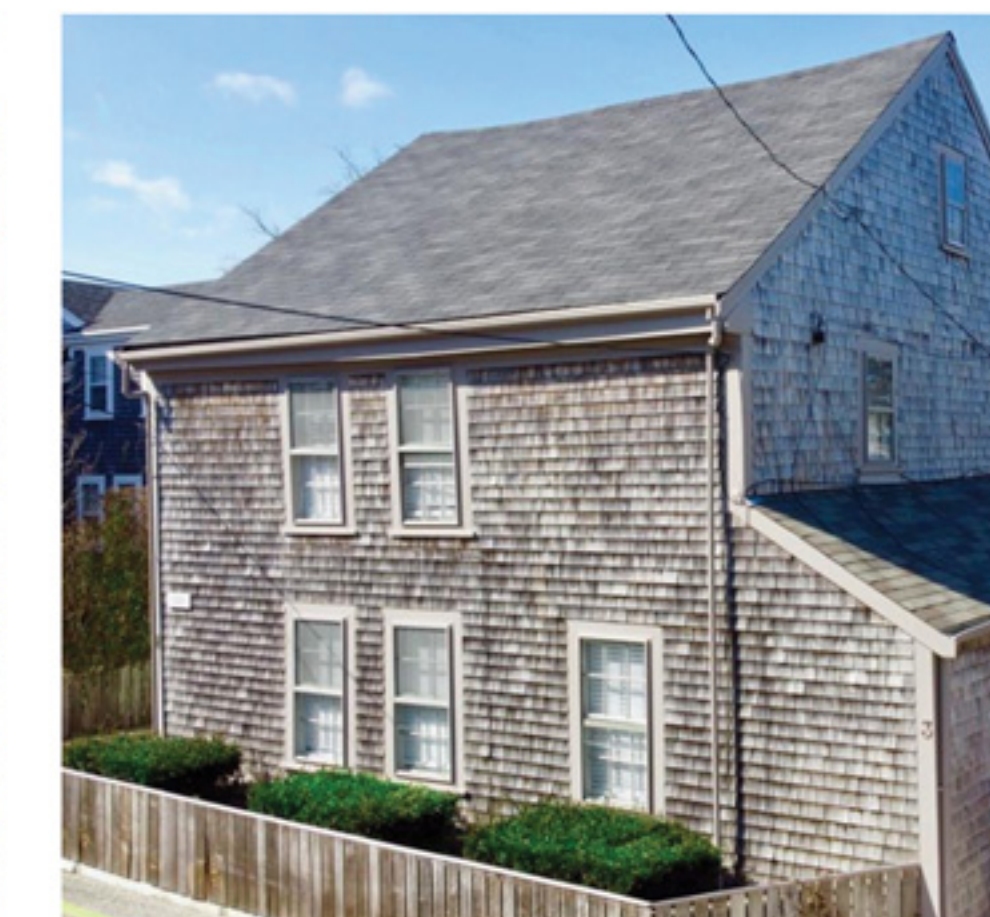
TOWN 3 A & B Beaver Street Listing Price: $2,125,000