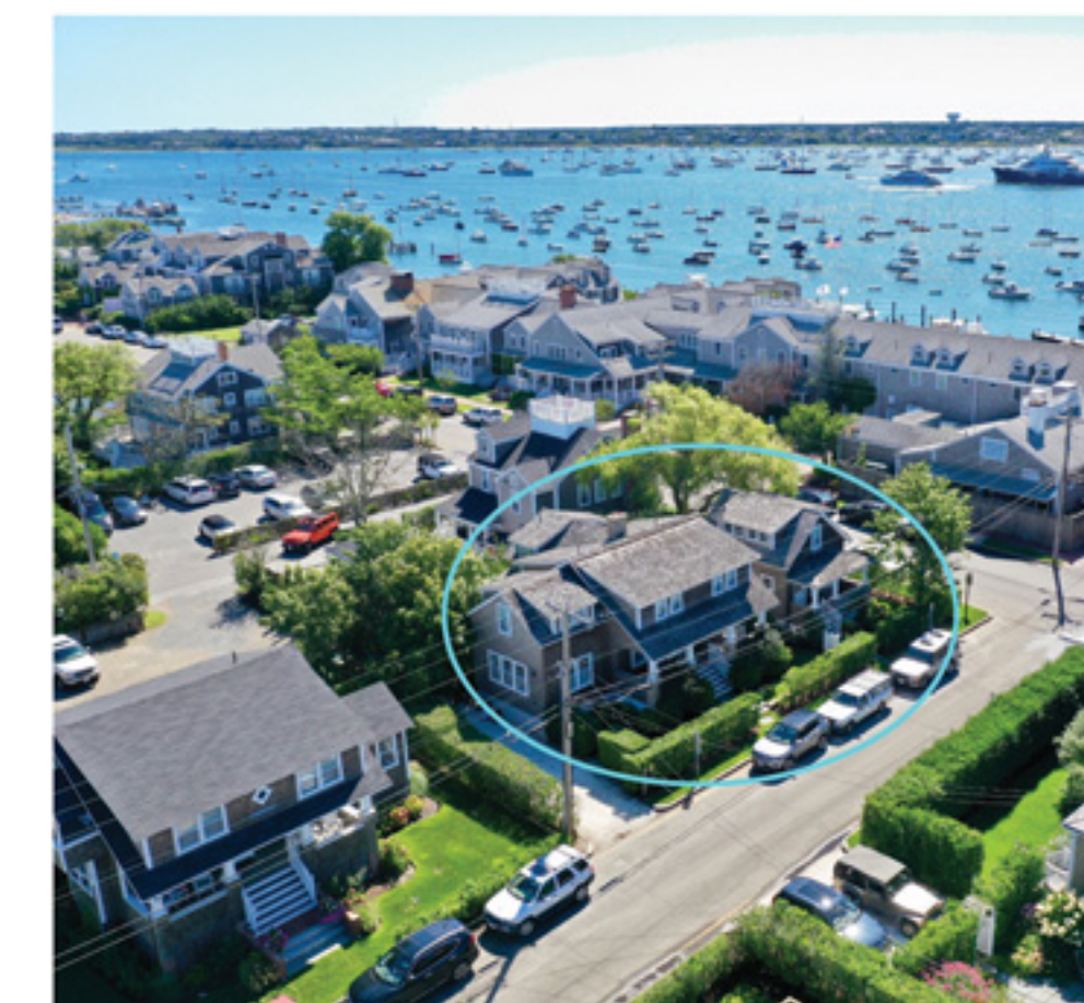
BRANT POINT 1 Walsh Street Listing Price: $3,795,000