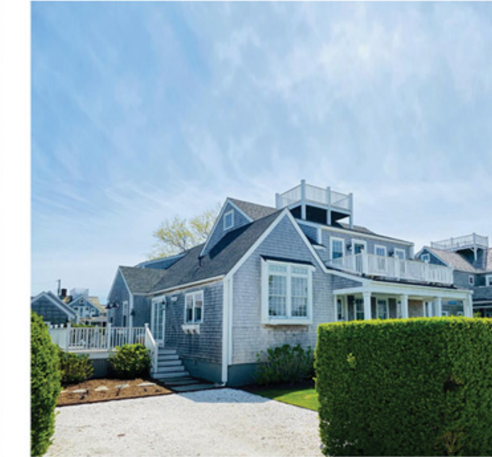
BRANT POINT 8 Galen Avenue Listing Price: $4,895,000