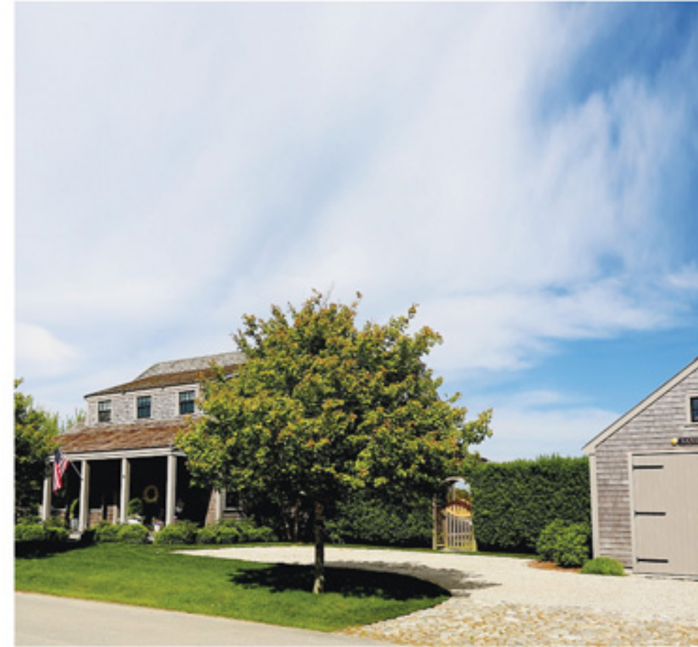
MIACOMET 16 ELLENS WAY 5 beds / 5 bath 1 half Weekly Price: $14,000 – $30,000