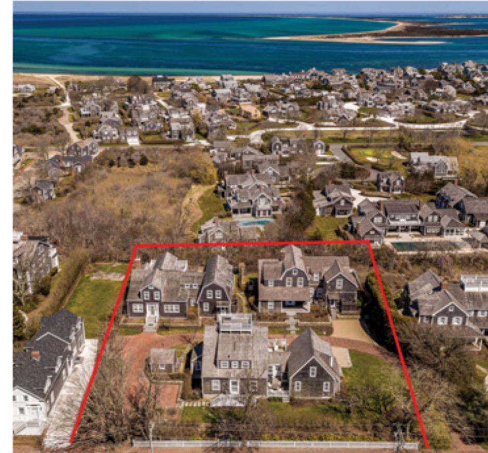
CLIFF 41a, 39, 37 Cliff Road Listing Price: $25,000,000