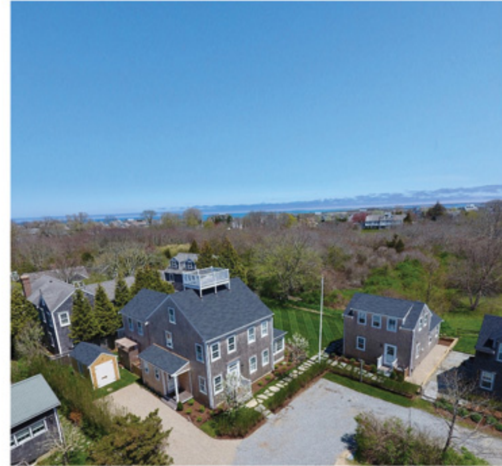
CLIFF 63 PICCADILLY 6 beds / 5 baths 2 halves Weekly Price: $20,000 – $25,000