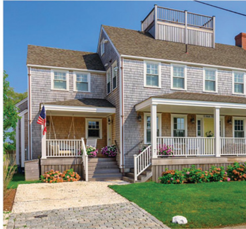
BRANT POINT 7 SWAIN STREET 4 beds / 3 baths 1 half Weekly Price: $15,000 – $17,000