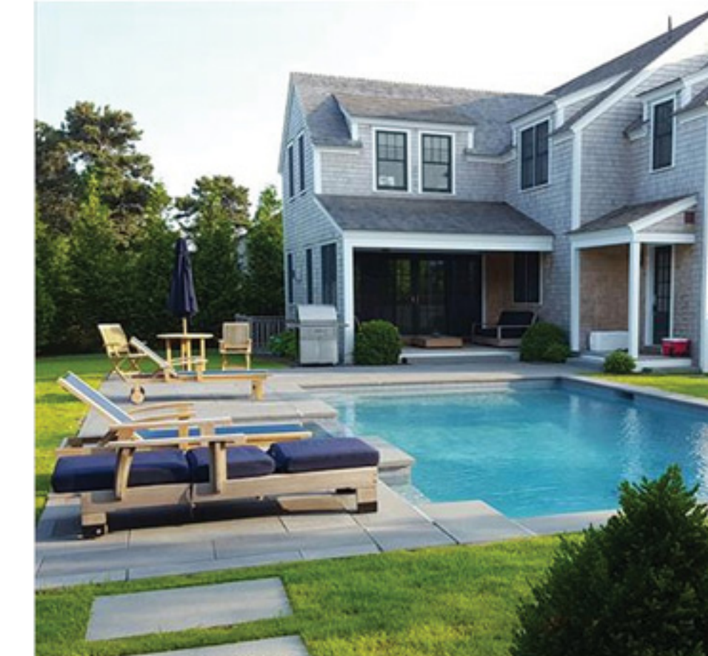
SURFSIDE 6 South Shore Road Listing Price: $5,250,000