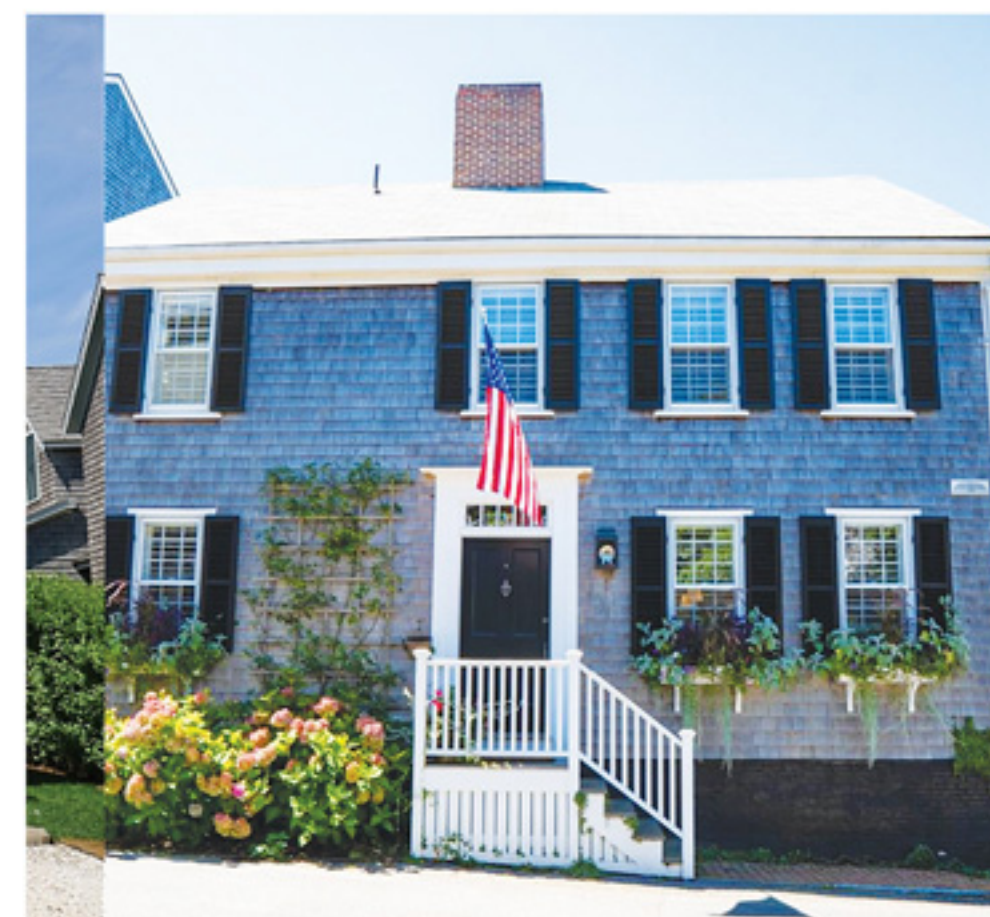
TOWN 3 Traders Lane Listing Price: $4,695,000