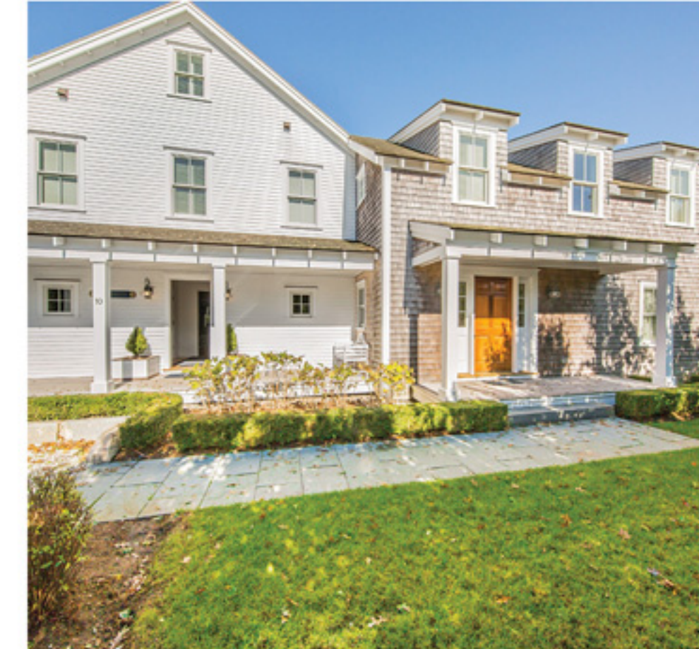
CLIFF 10 Old Westmor Farm Road Listing Price: $8,325,000