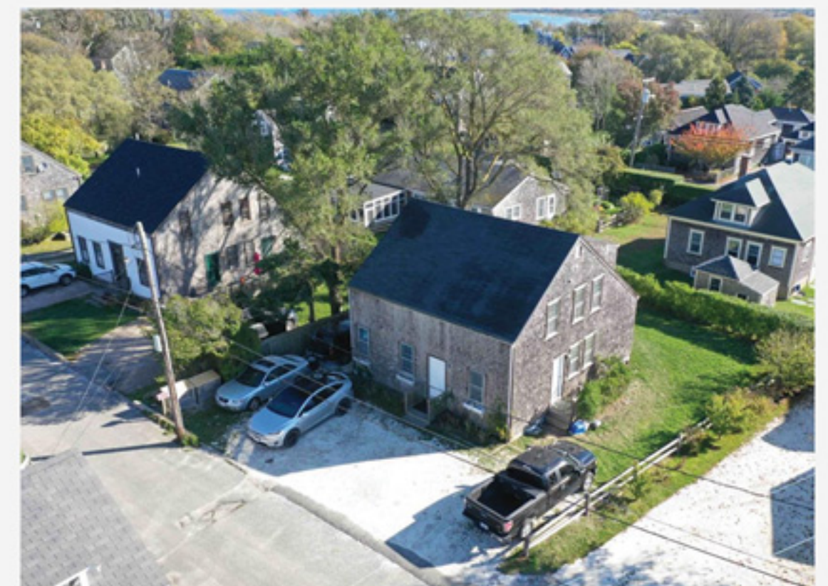
TOWN 22 West York Lane $1,649,000

19 Centre Street, 508.228.3202 Nantucket, MA www.jpfc.com