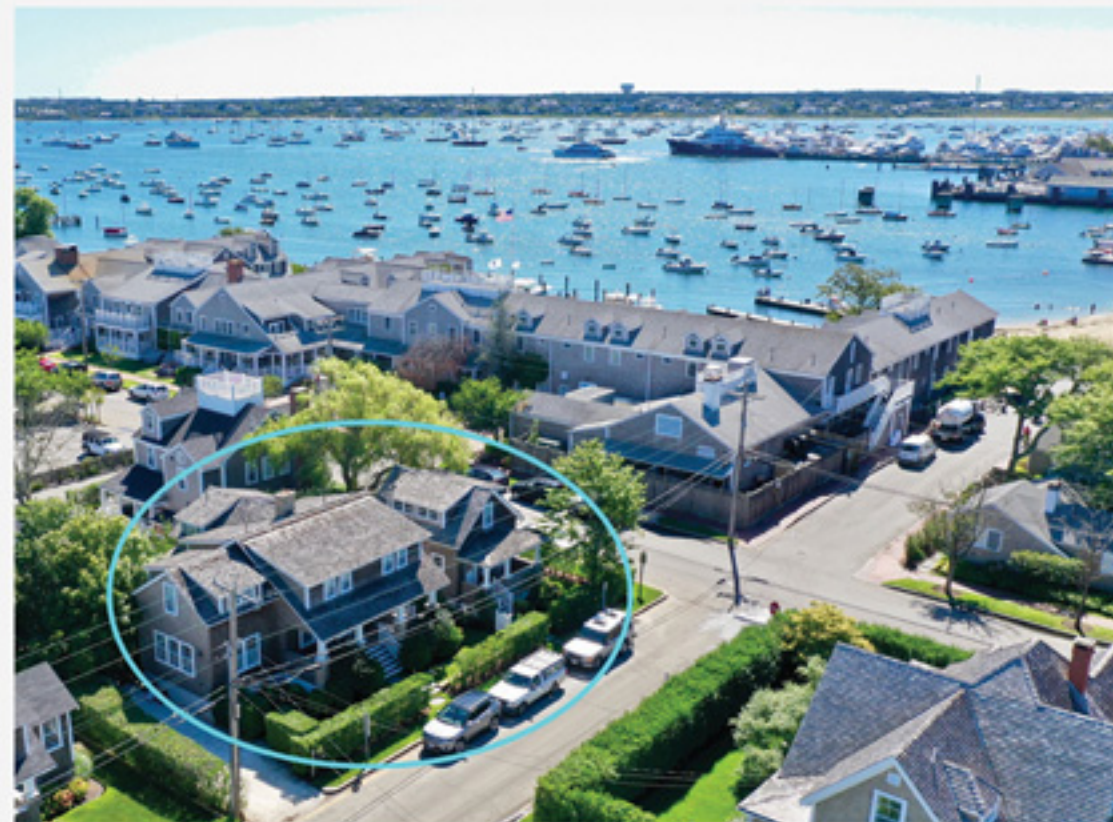
BRANT POINT 1 Walsh Street $3,795,000