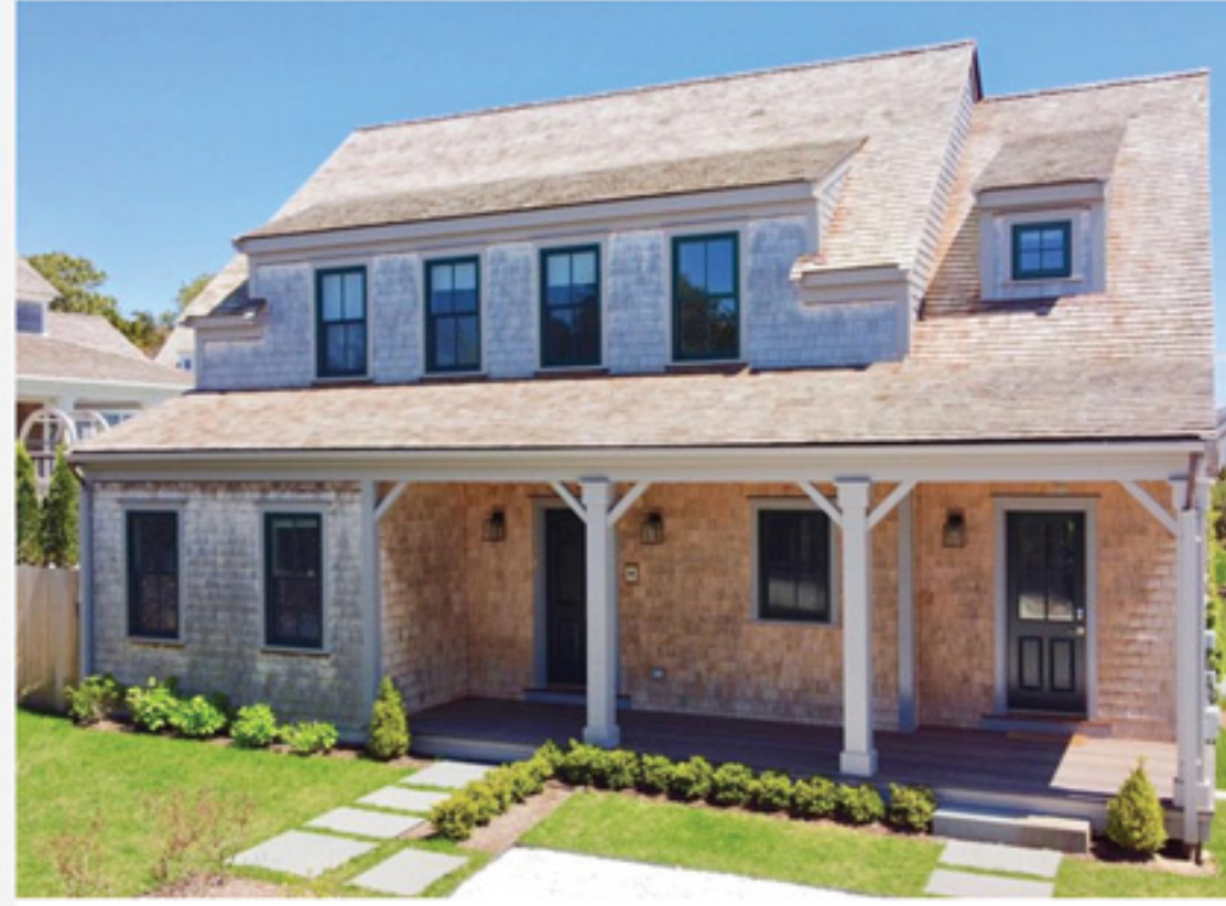
TOWN 4 Red Mill Lane $4,895,000