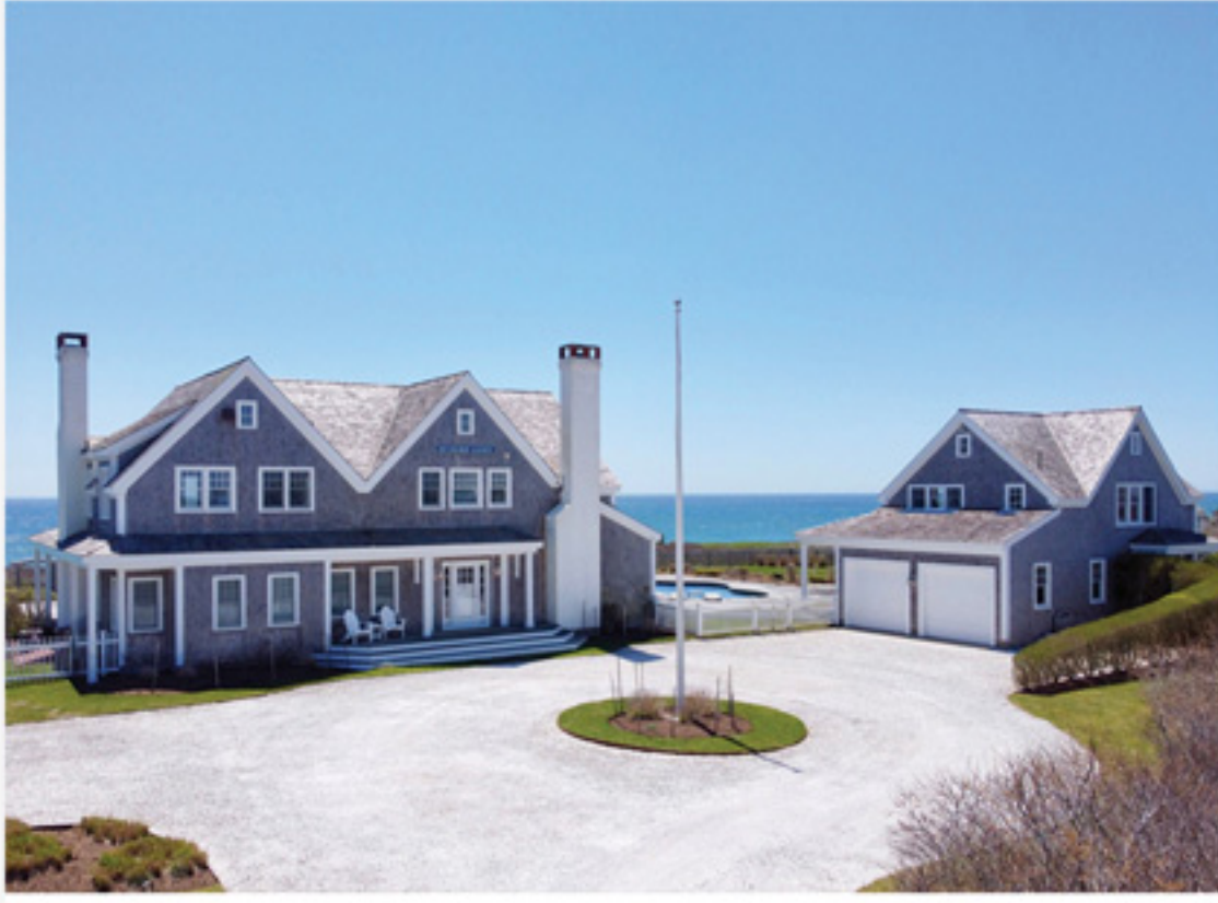
TOM NEVERS 100 Tom Nevers Road $10,995,000