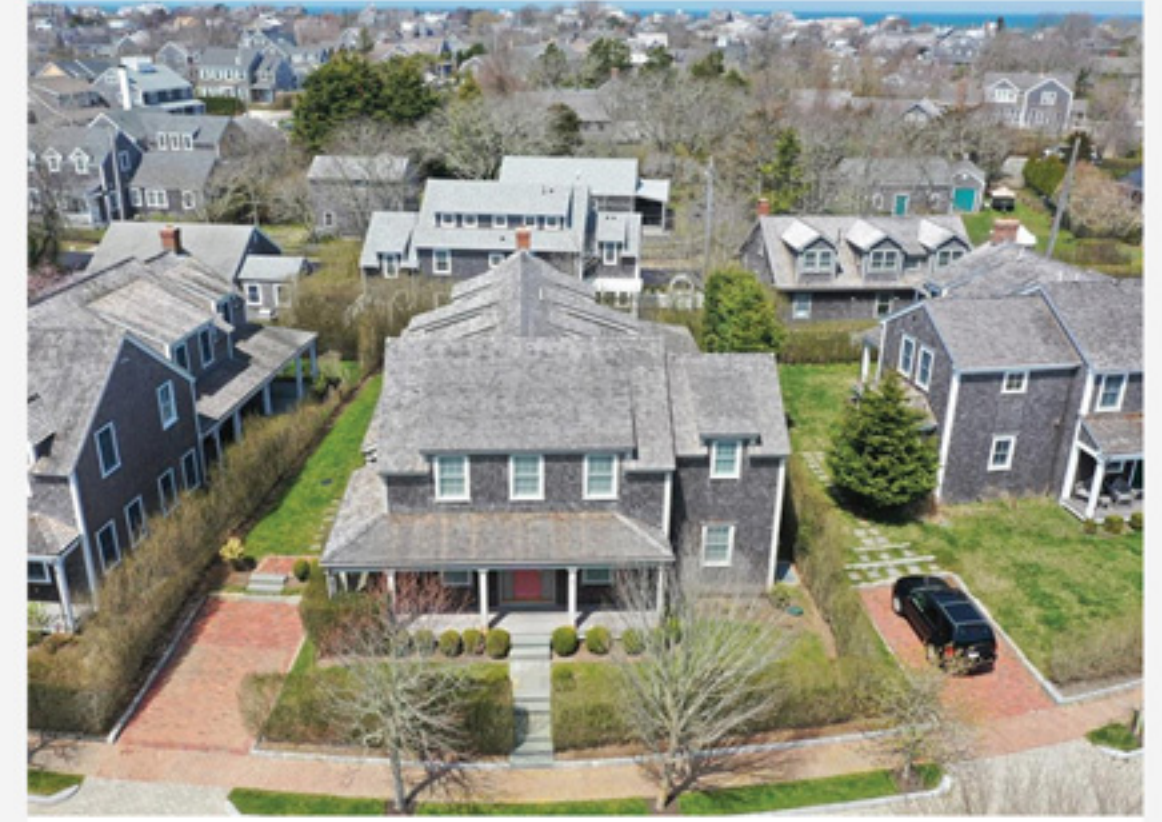
CLIFF 8 Gingy Lane $3,950,000