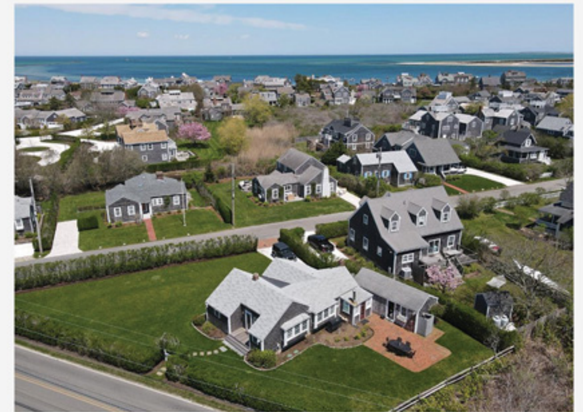
BRANT POINT $3,195,000 25 North Beach St & 26 East Lincoln Avenue