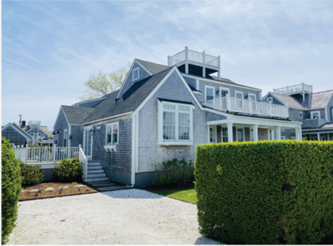
BRANT POINT 8 Galen Avenue $4,895,000