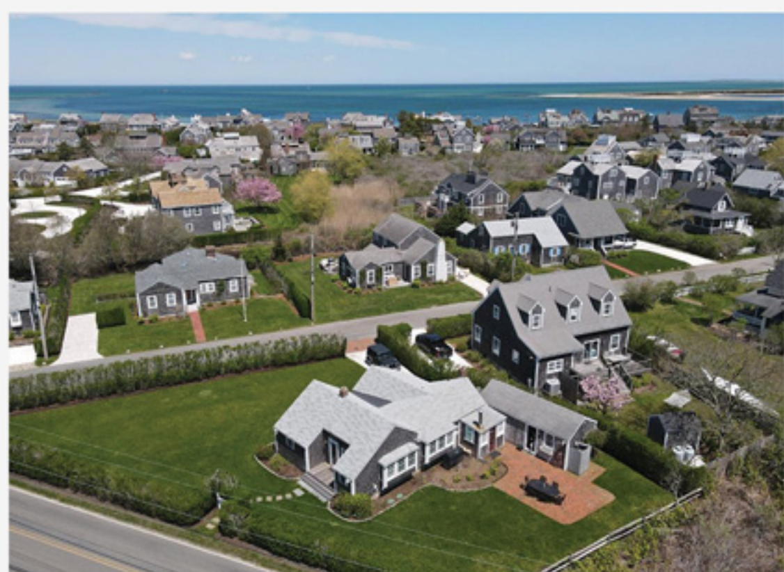
BRANT POINT 25 North Beach St & 26 East Lincoln Avenue $3,195,000