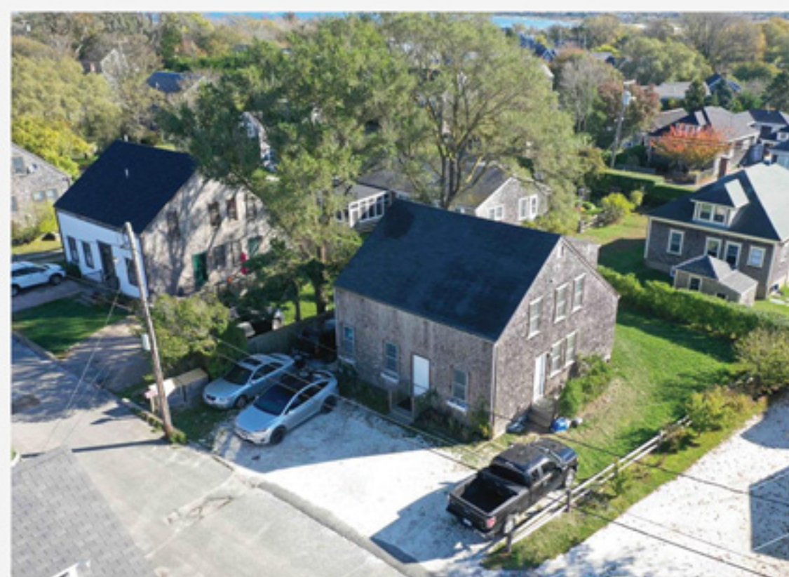
TOWN 22 West York Lane $1,649,000