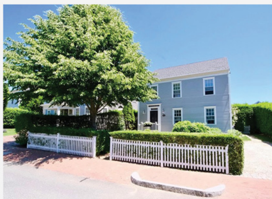
NAUSHOP 82 Goldfinch Drive $2,495,000