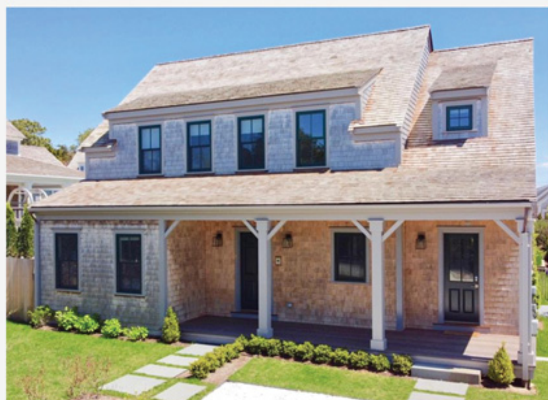
TOWN 4 Red Mill Lane $4,895,000