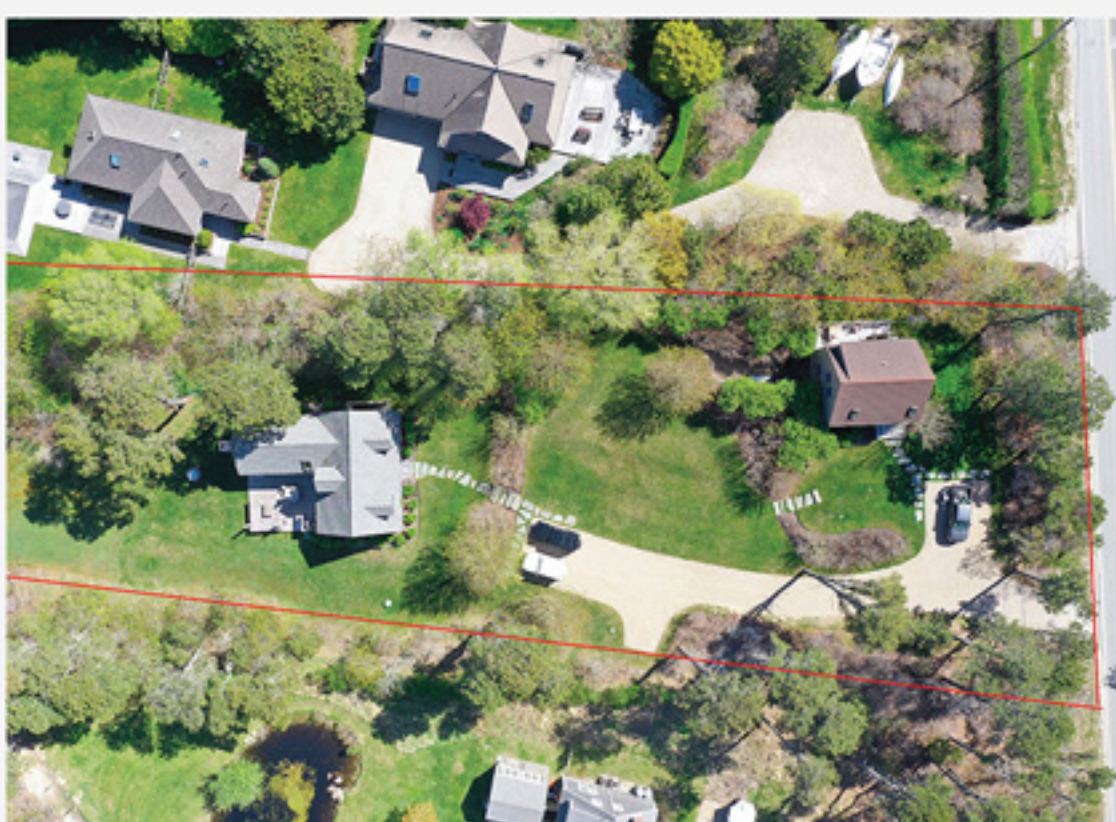
POLPIS 32 Polpis Road $2,895,000