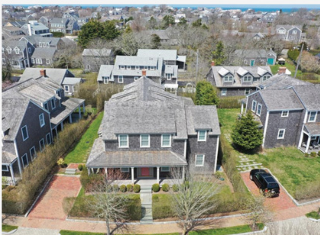
CLIFF 8 Gingy Lane $3,950,000