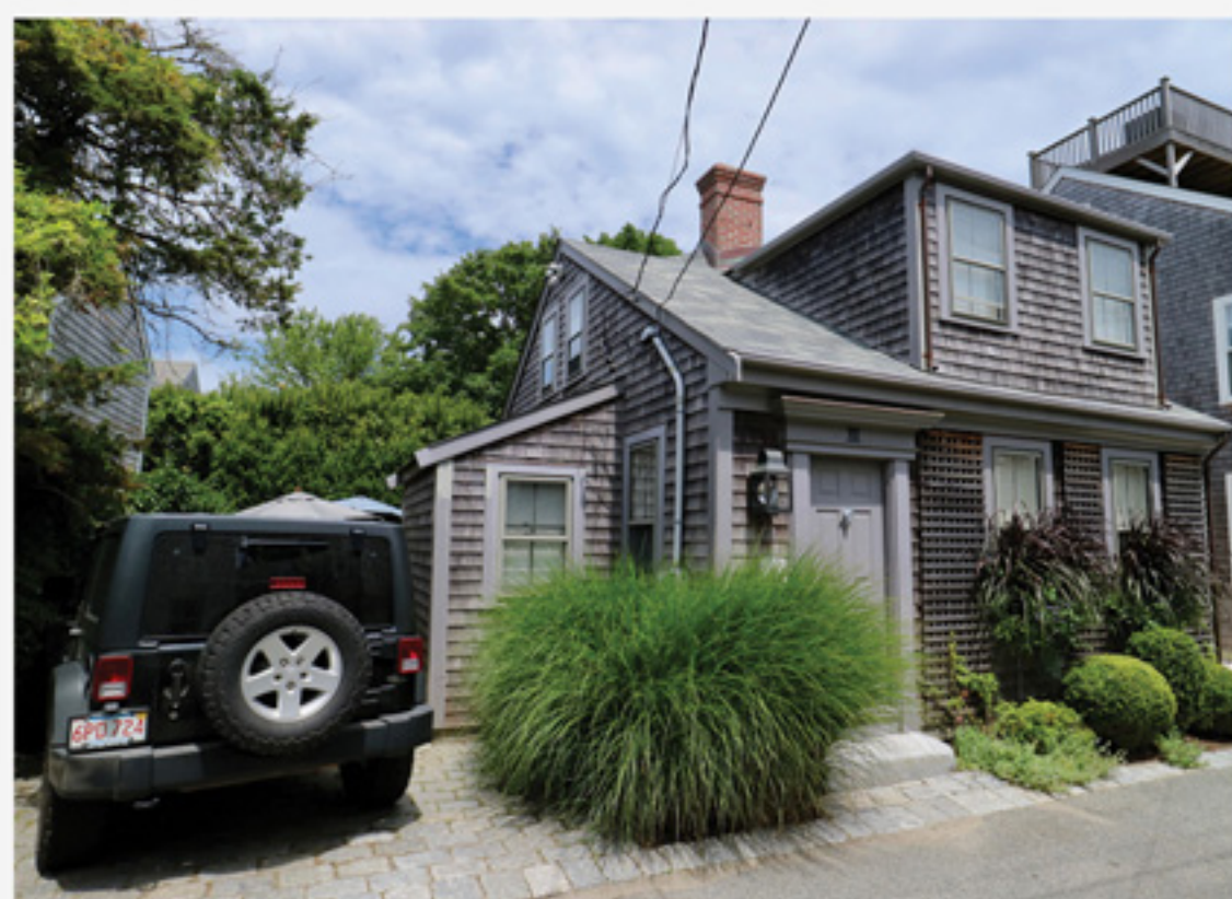
TOWN 7 Independent Way $2,495,000