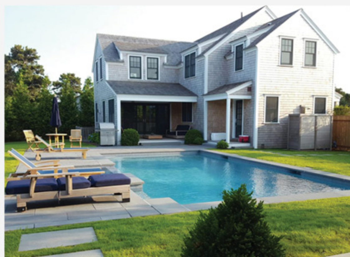
SURFSIDE 6 South Shore Road $5,250,000