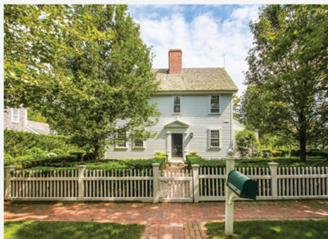
TOWN 6 Woodbury Lane $3,895,000