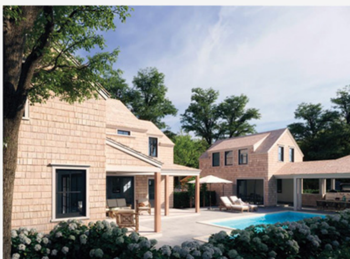
MIACOMET 4 Ellens Way $5,750,000