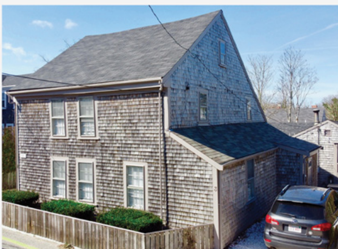
TOWN 3A&B Beaver Street $2,125,000