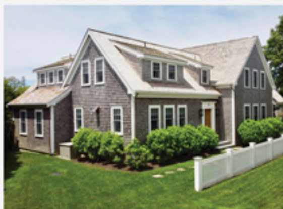
CLIFF 2 North Star Lane $6,995,000