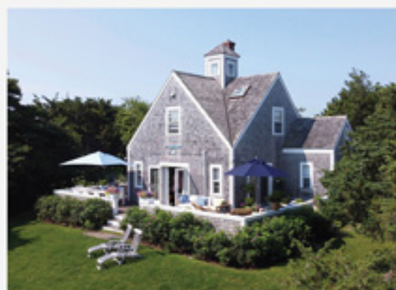
POLPIS 151 Polpis Road $1,995,000

19 Centre Street, 508.228.3202 Nantucket, MA www.jpfc.com @nantuckethouses