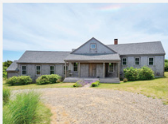
SURFSIDE 71 Pochick Avenue $5,995,000