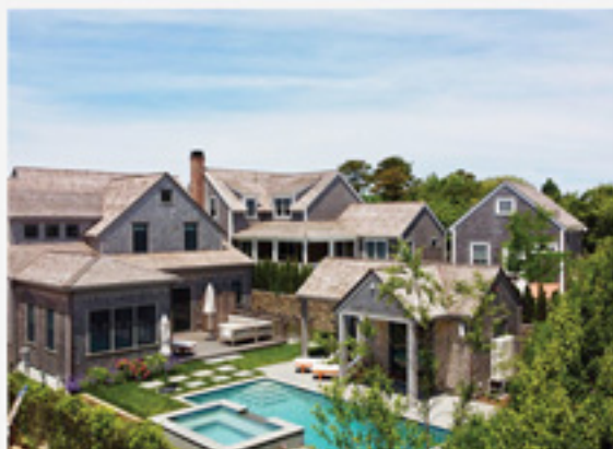
TOWN 4 Red Mill Lane $4,895,000