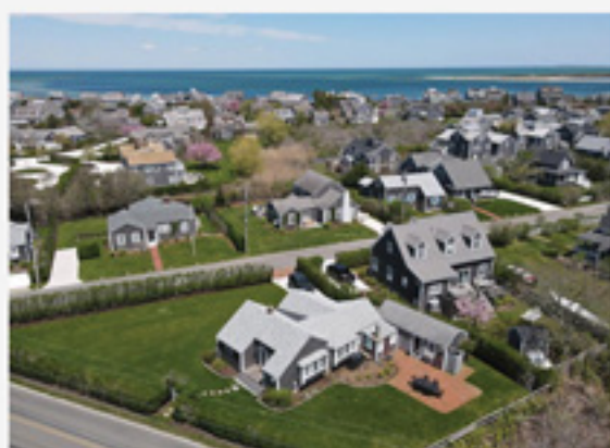
BRANT POINT 25 North Beach St & 26 East Lincoln Avenue $3,195,000