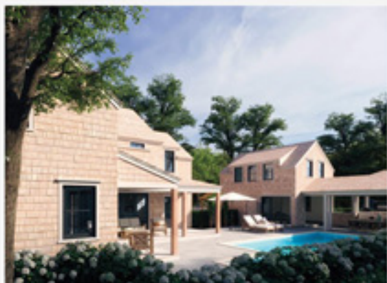
MIACOMET 4 Ellens Way $5,750,000