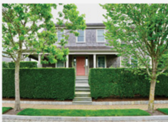
CLIFF 8 Gingy Lane $3,795,000