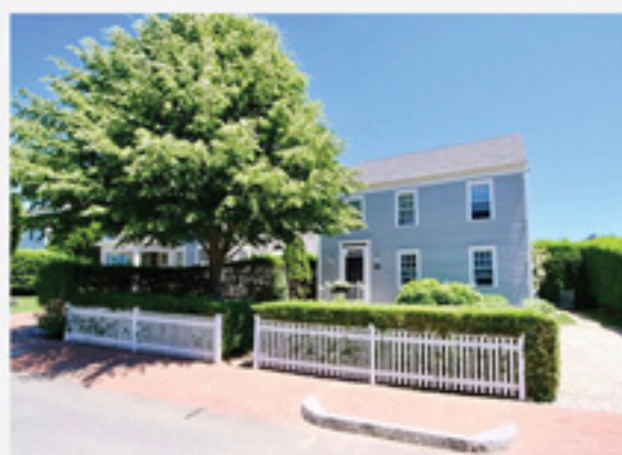
NAUSHOP 82 Goldfinch Drive $2,495,000