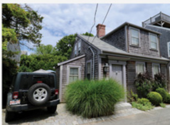
TOWN 7 Independent Way $2,495,000