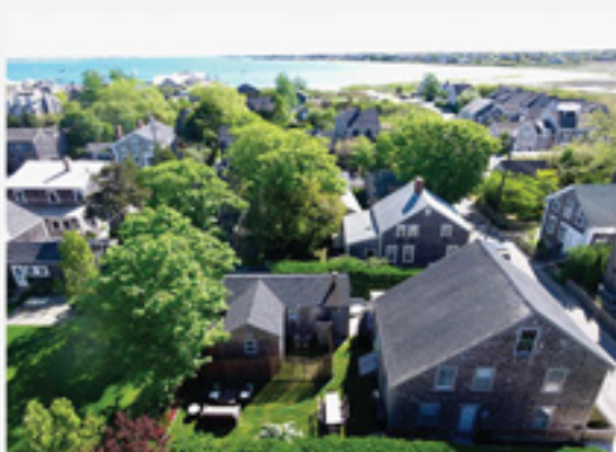
TOWN 3A&B Beaver Street $2,125,000