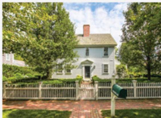
TOWN 6 Woodbury Lane $3,895,000