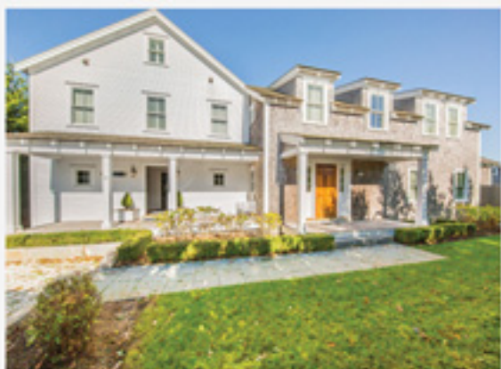
CLIFF 10 Old Westmoor Farm Road $8,325,000