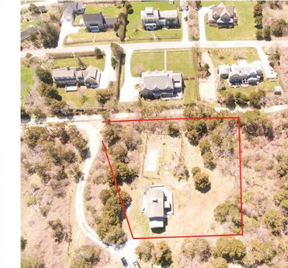
SCONSET 52 Burnell Street/ Olivers Way Listing Price: $5,288,000