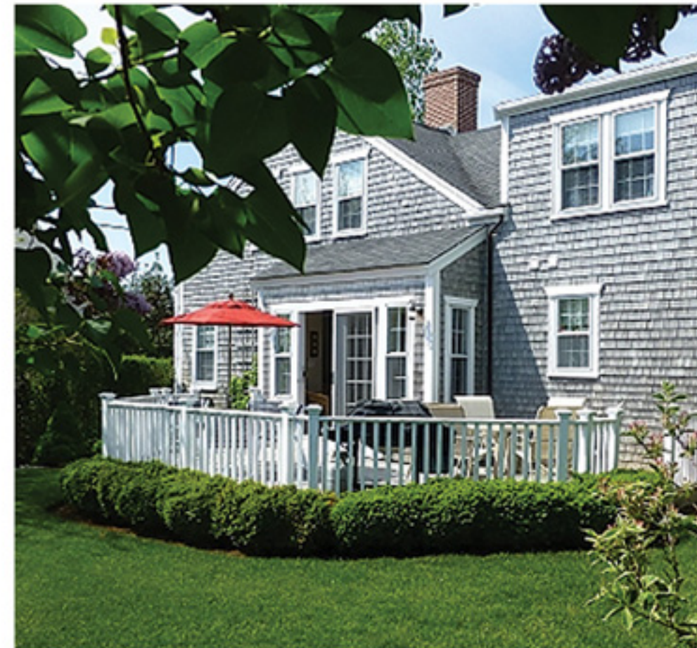
TOWN 4 beds / 4 bathS 1 half 5 E. DOVER STREET Weekly Price: $7,000 – $8,000