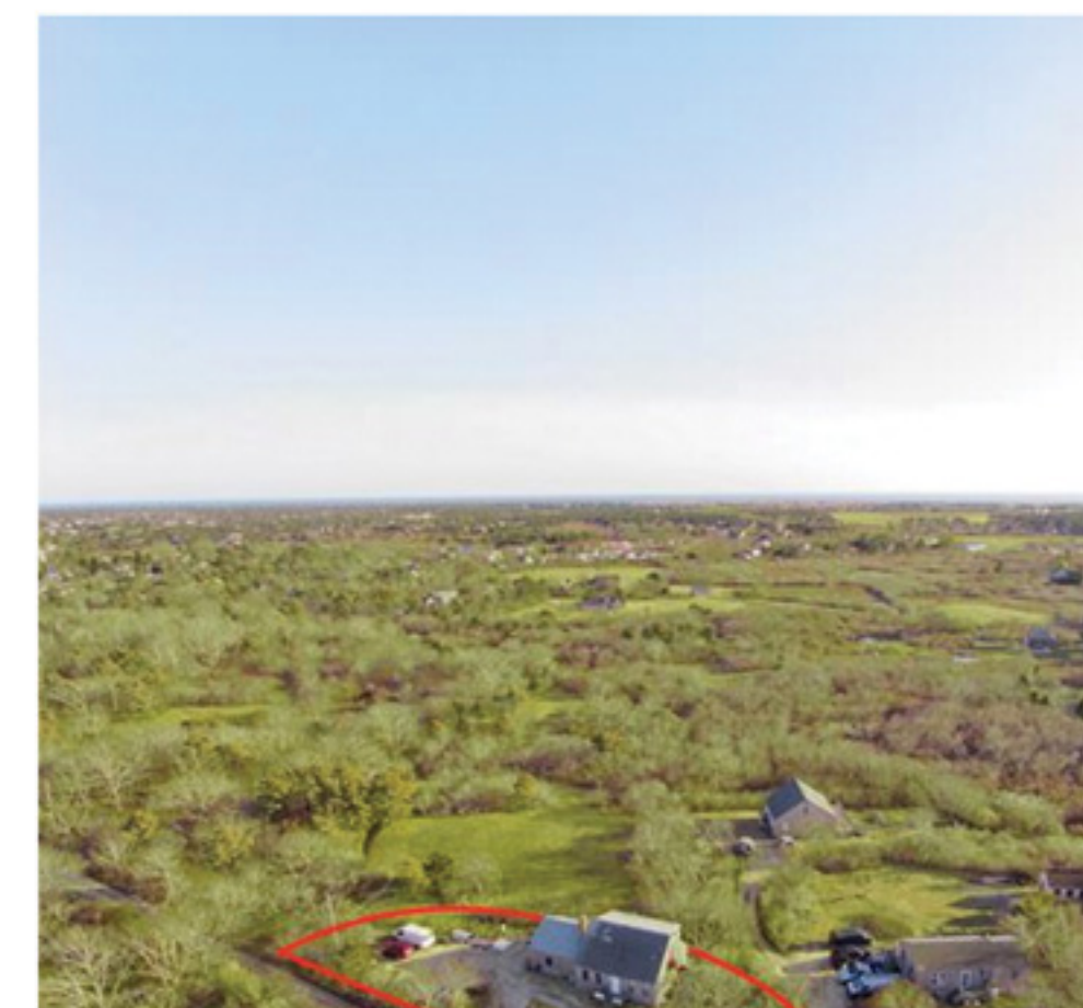
HUMMOCK POND 22 Hawthorne Lane Listing Price: $2,995,000