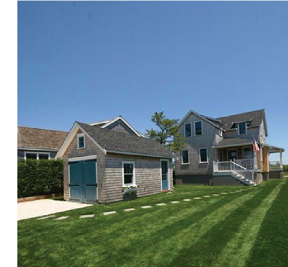
BRANT POINT 23 Walsh Street Listing Price: $5,695,000