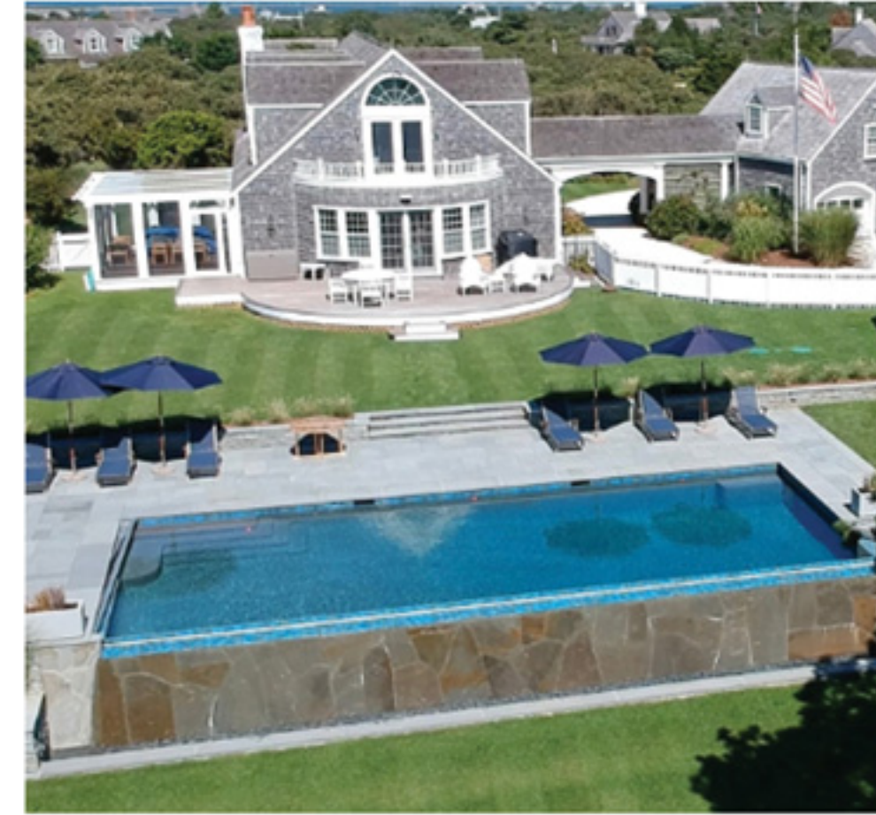
POLPIS 6 beds / 4 bath 1 half 13 NORTH PASTURE LANE Weekly Price: $24,000