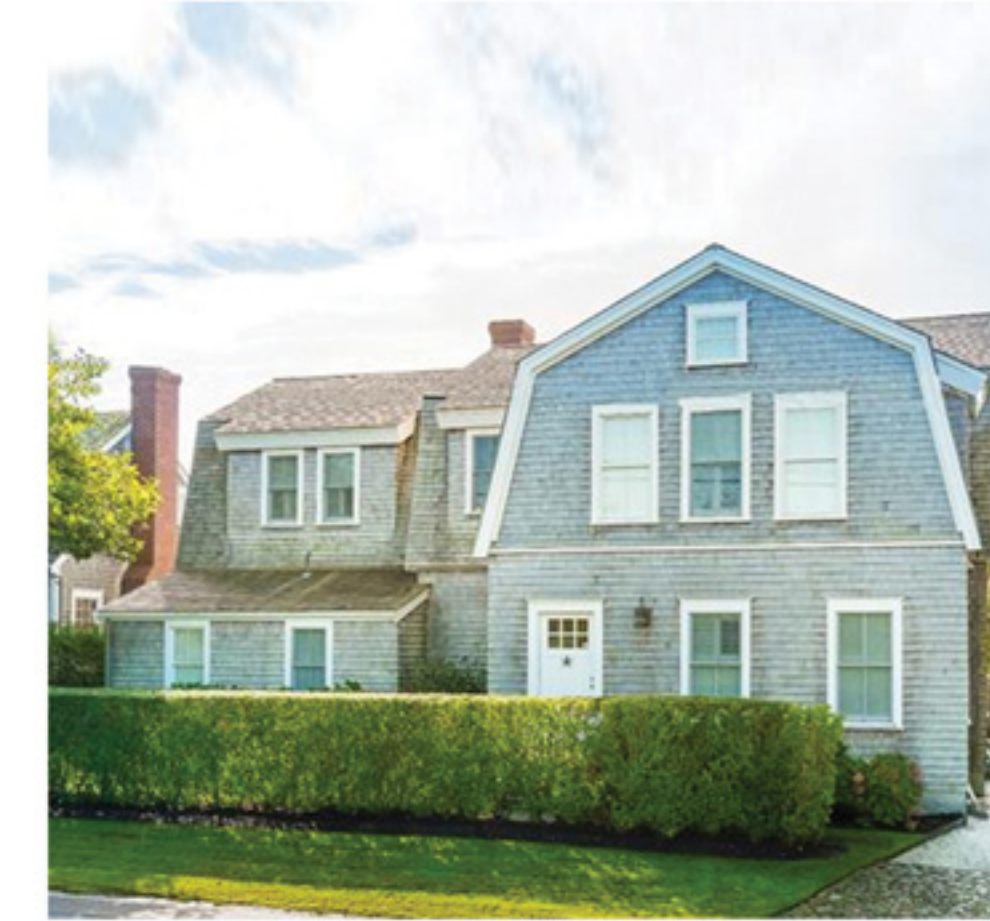
CLIFF 82b Cliff Road Listing Price: $5,795,000