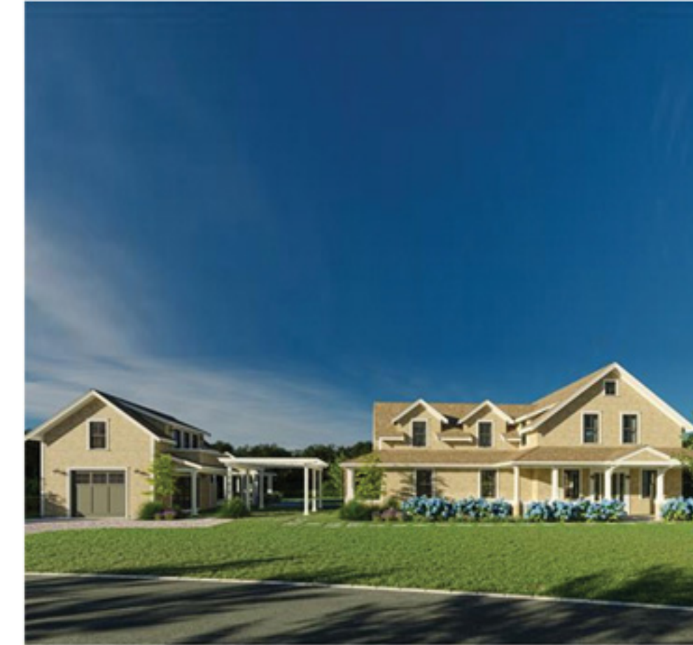
SURFSIDE 3 Maple Lane Listing Price: $7,395,000