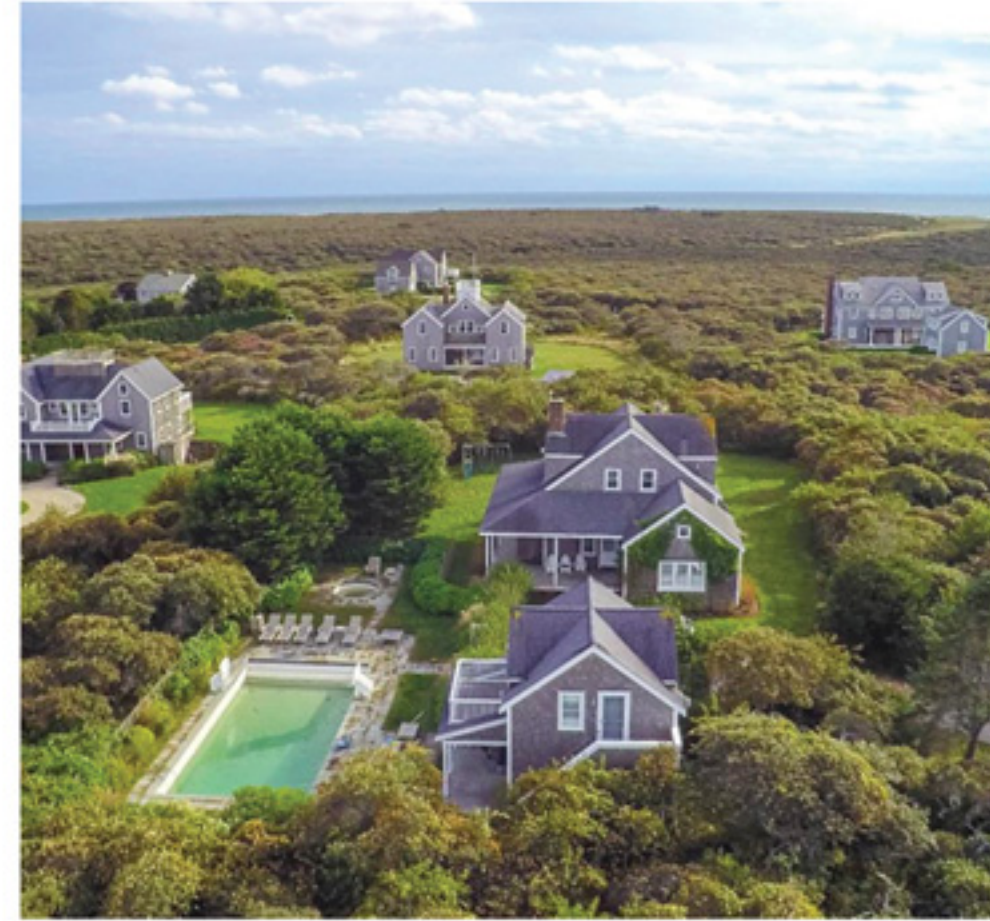
MADEQUECHAM 5 beds / 3 bath 1 half 15 WIGWAM ROAD Weekly Price: $12,500 – $23,000