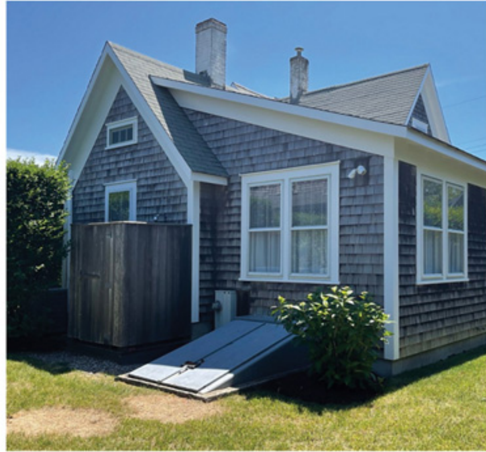
CLIFF 4 beds / 3 baths 2 CABOT LANE Weekly Price: $16,000