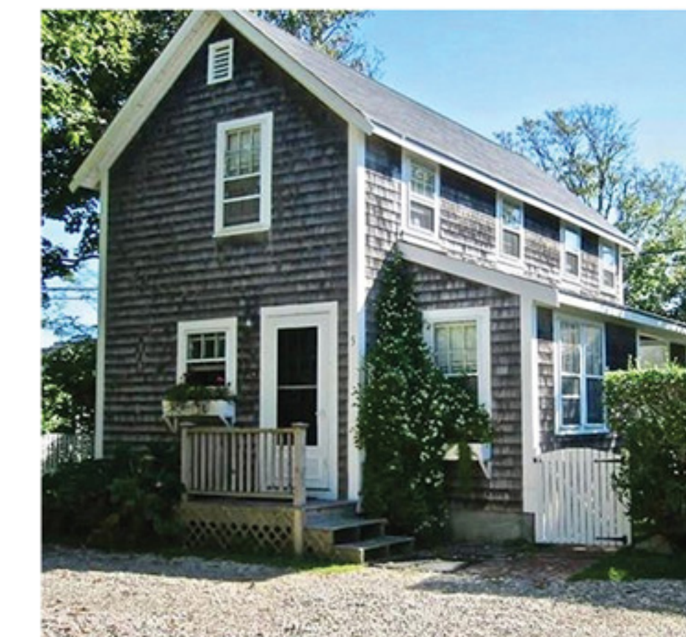
SCONSET 5 Folgers Court Listing Price: $1,695,000