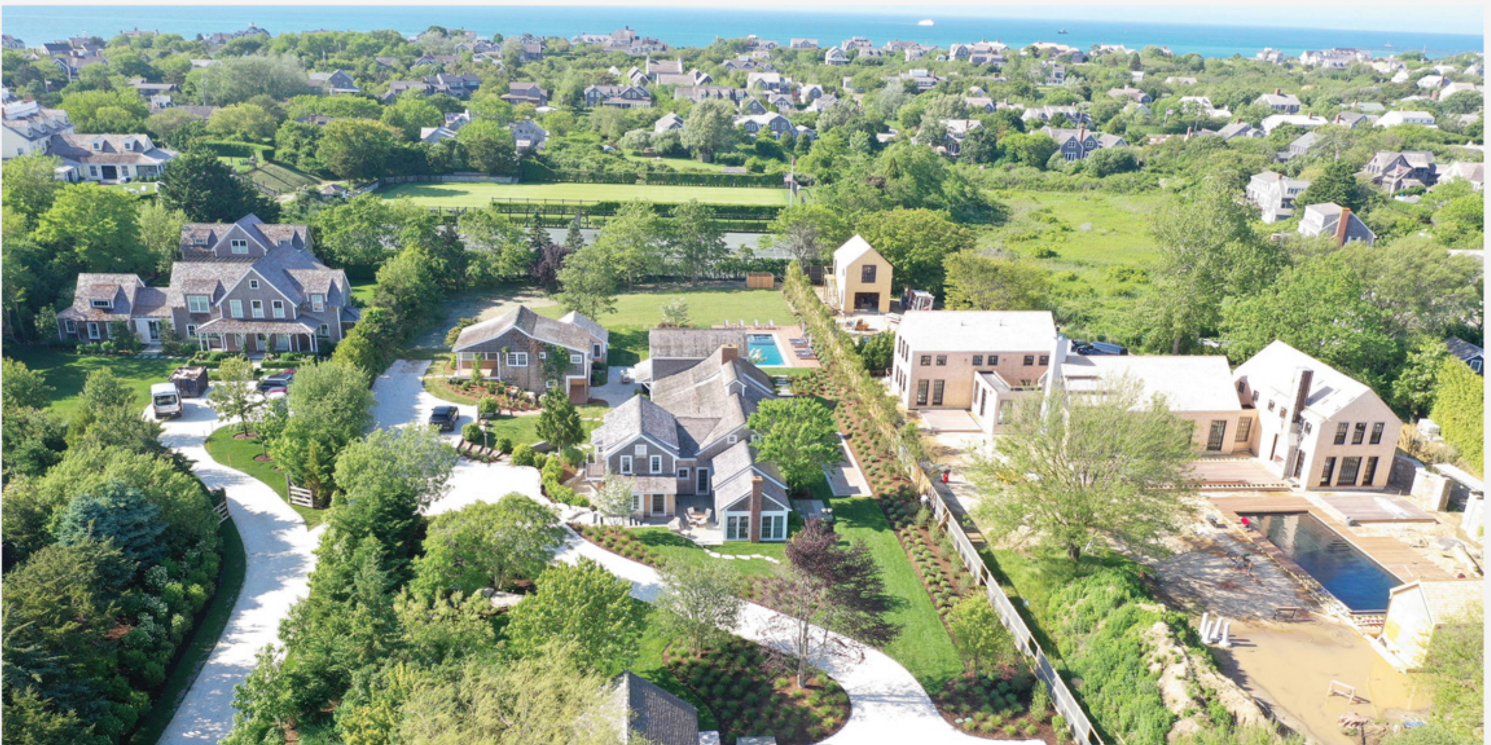
CLIFF 6 Old Westmoor Farm Road