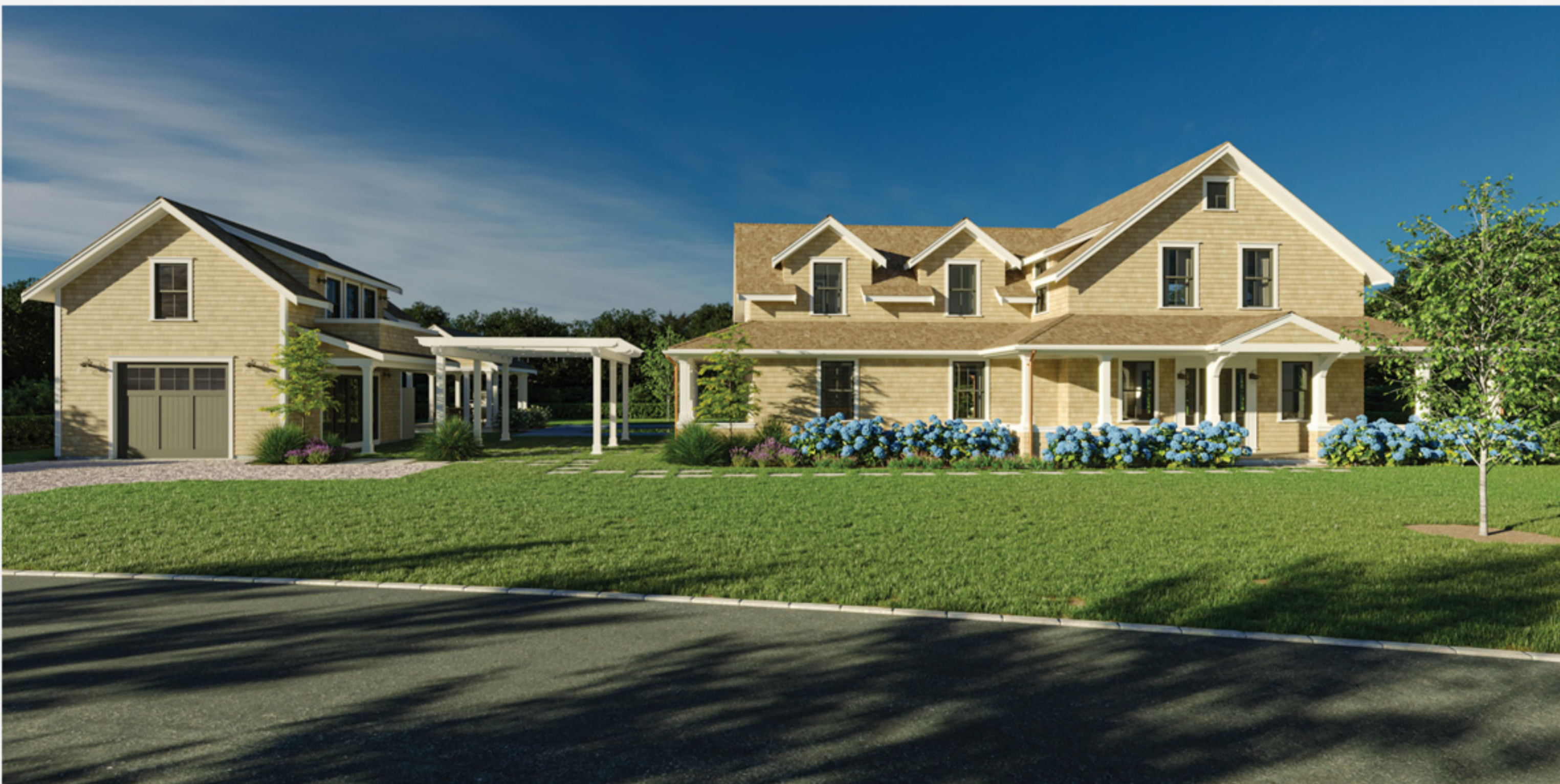
SURFSIDE 3 Maple Lane