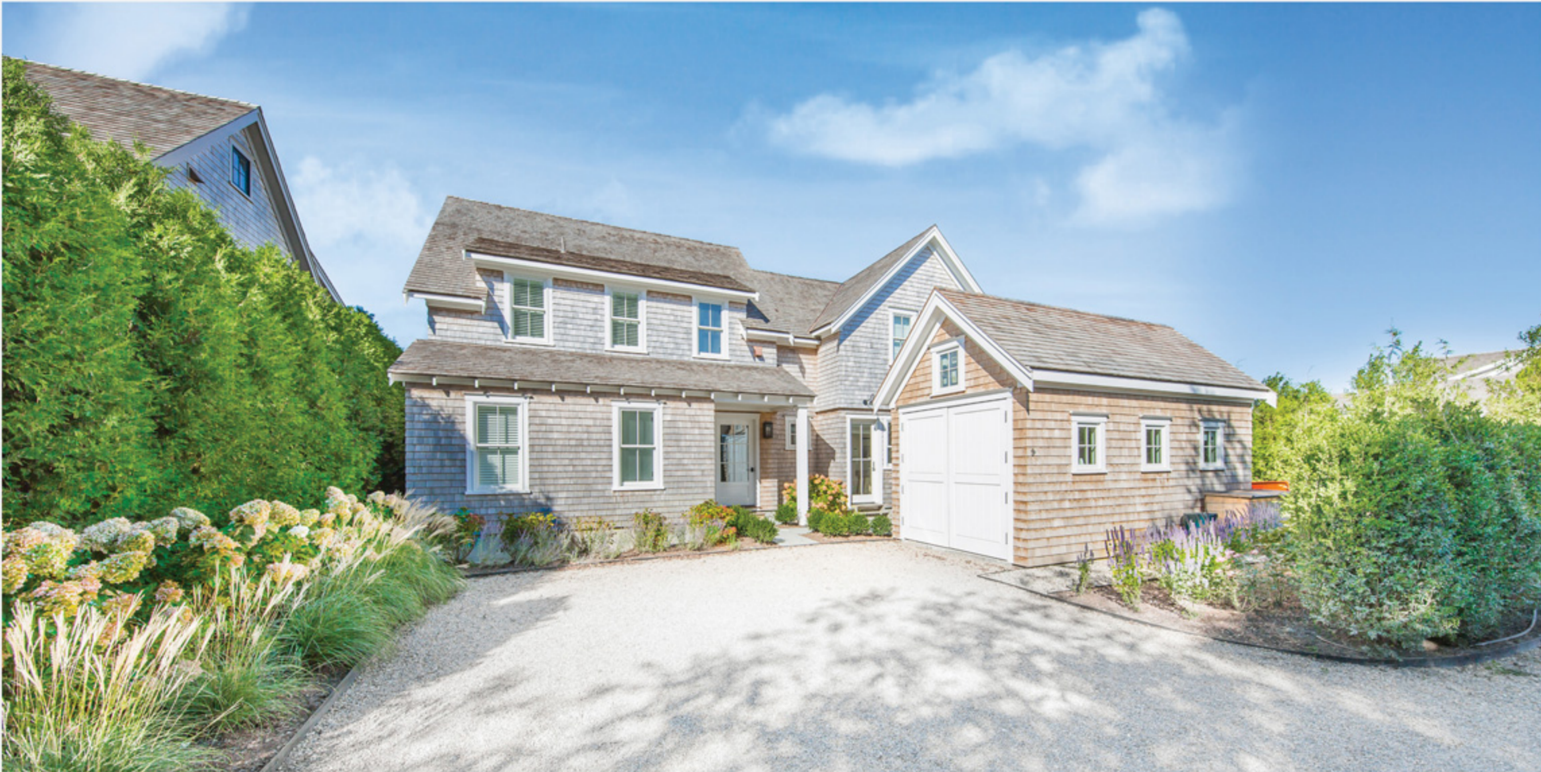
CLIFF 9A Pilgrim Road