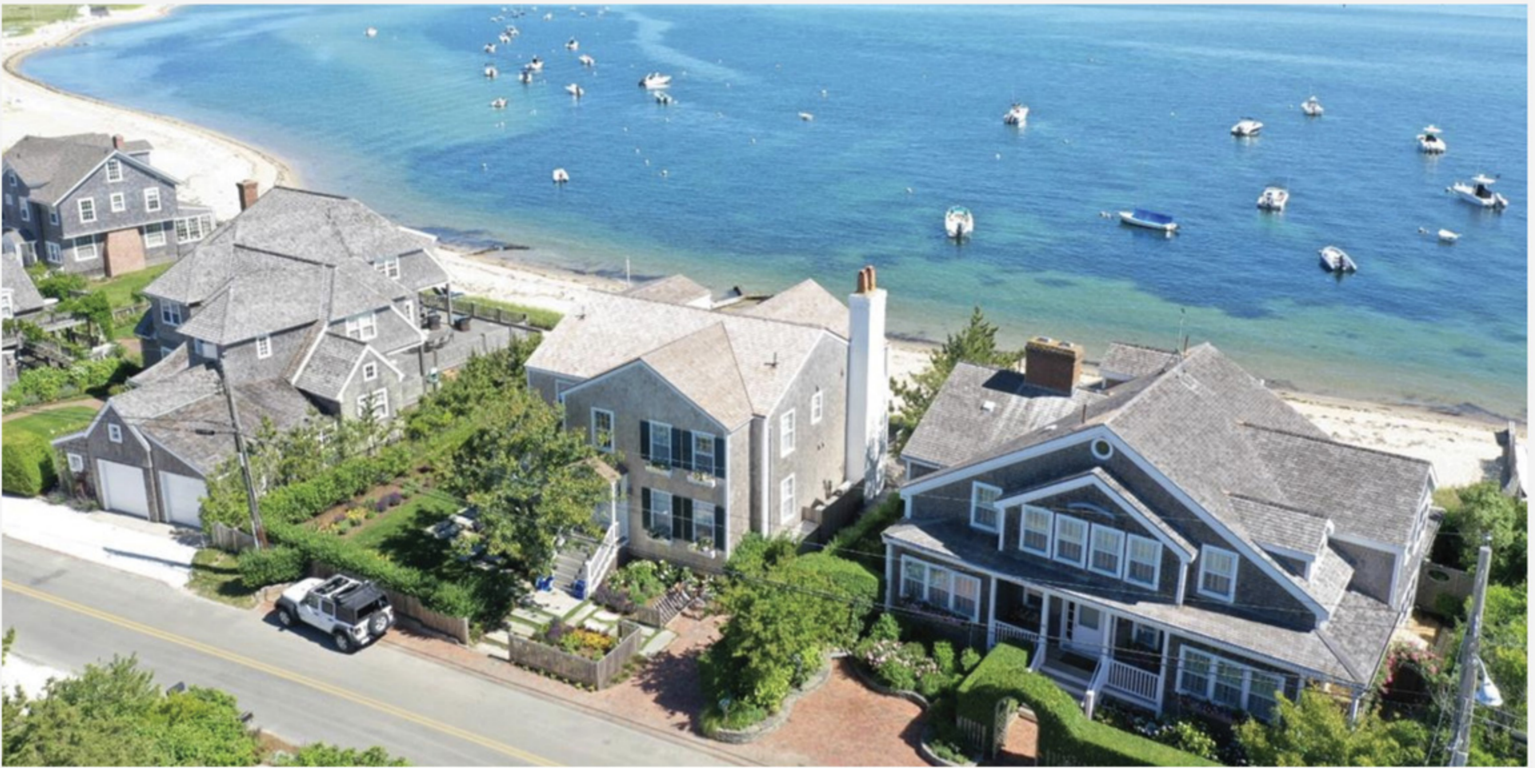
BRANT POINT 49 Hulbert Avenue