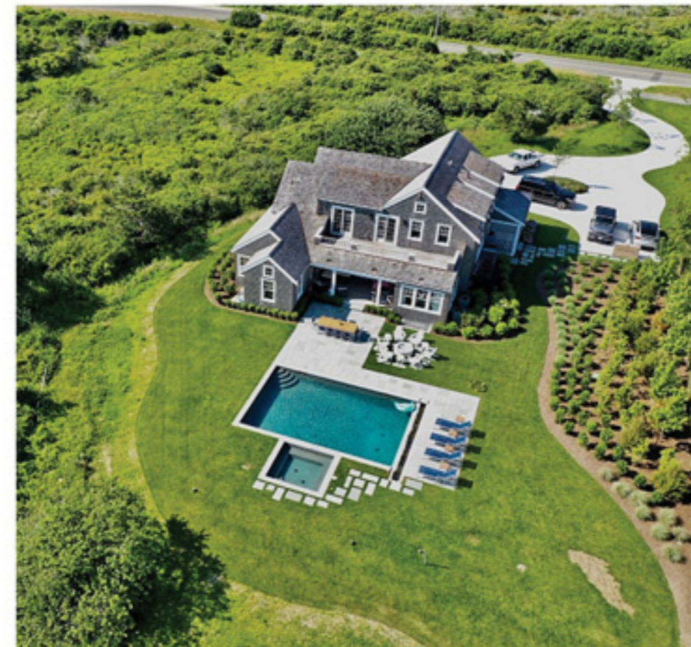
WESTOFTOWN 78 Madaket Road 6 beds / 5 baths 3 half Weekly Price: $20,000–$35,000