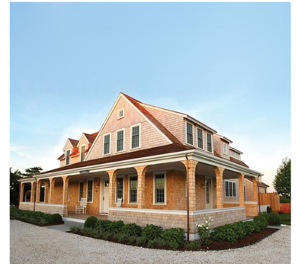
SCONSET 22 BLACKFISH LANE 7 beds / 7 baths Weekly Price: $25,000–$30,000