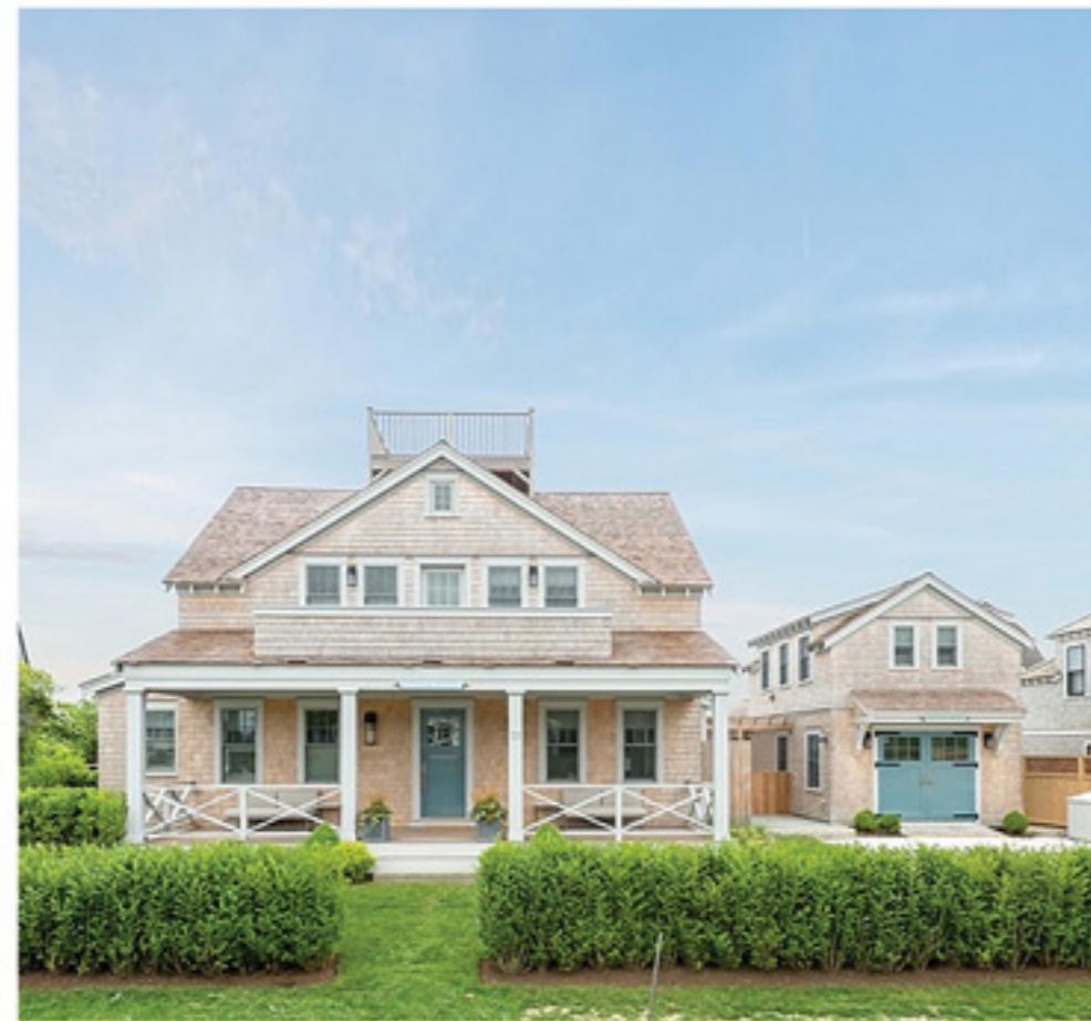
BRANT POINT 33 JEFFERSON AVE 8 beds / 8 baths 2 half Weekly Price: $35,000–$50,000