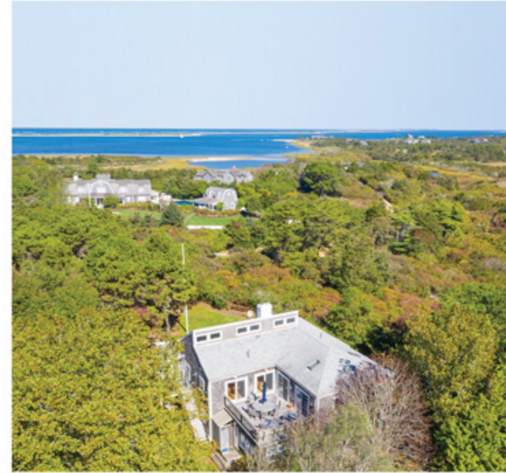
SHIMMO 18 GARDNER ROAD 6 beds / 6 baths 1 half Weekly Price: $18,000–$20,500