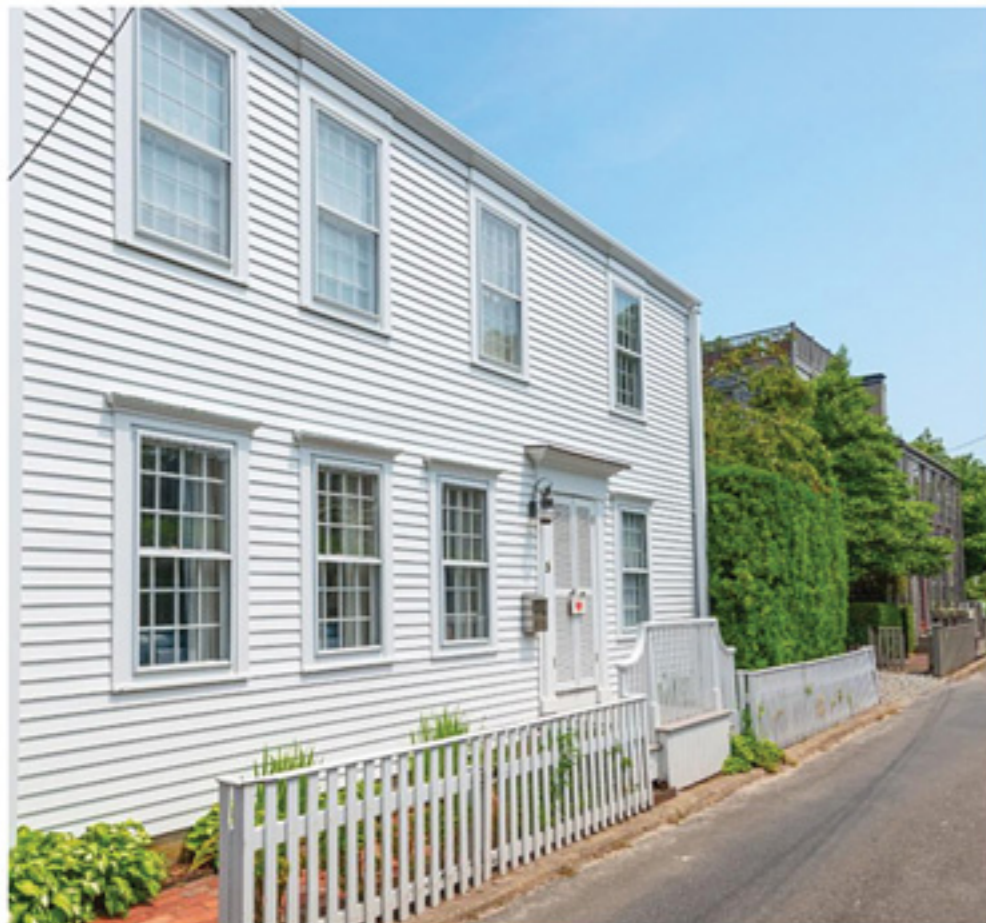
TOWN 5 HILLERS LANE 5 beds / 3 baths 1 half Weekly Price: $13,500–$17,000