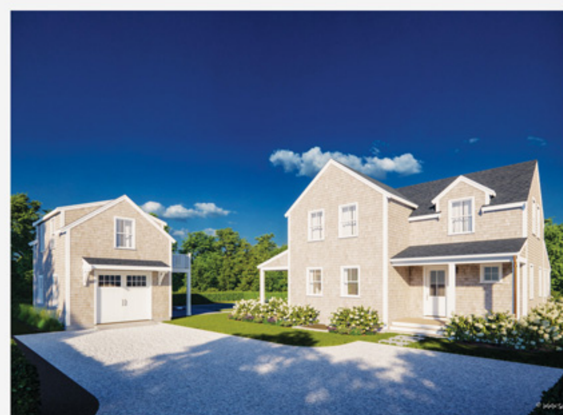
MID ISLAND 71F Fairgrounds Road $4,395,000