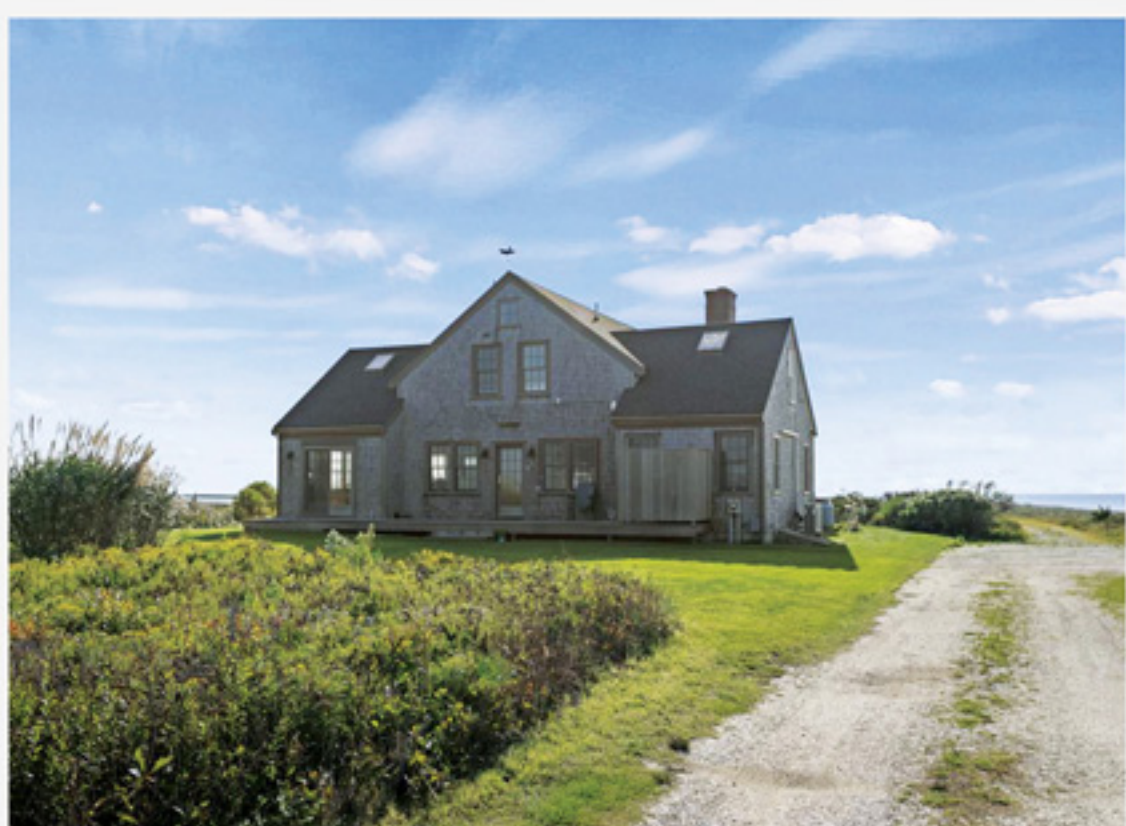
MADAKET 26 Sheep Pond Road $2,995,000