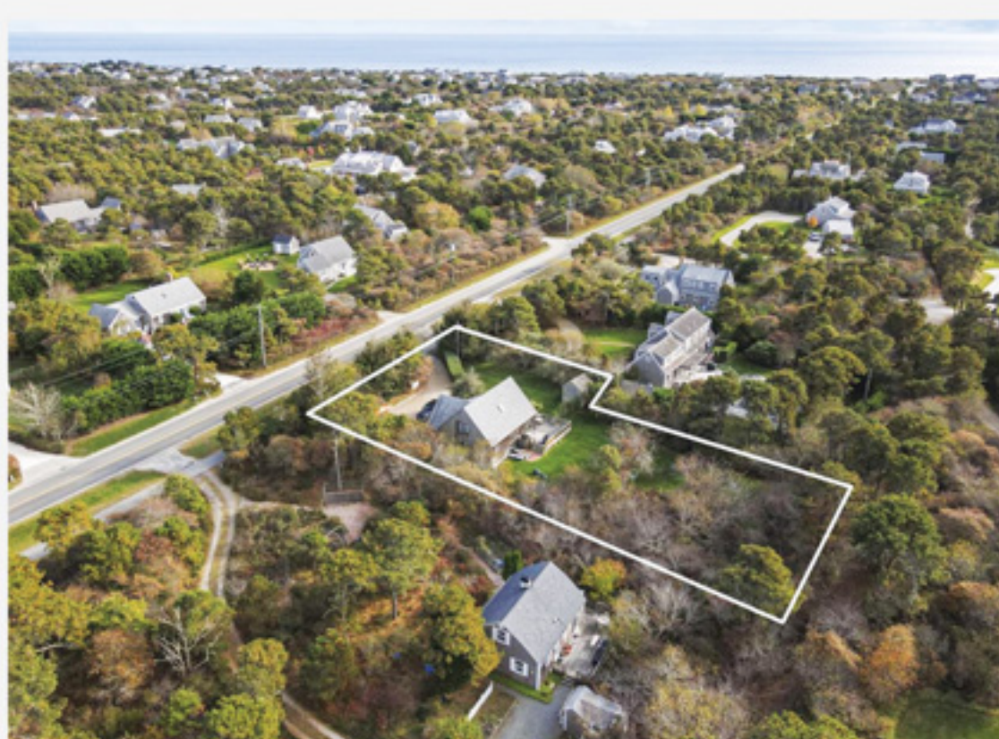
SURFSIDE 133 Surfside Road $3,895,000