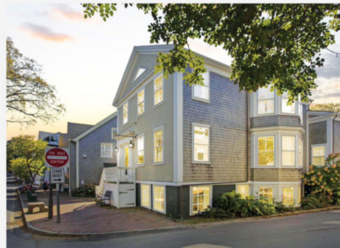
TOWN 34 Center Street $5,990,000