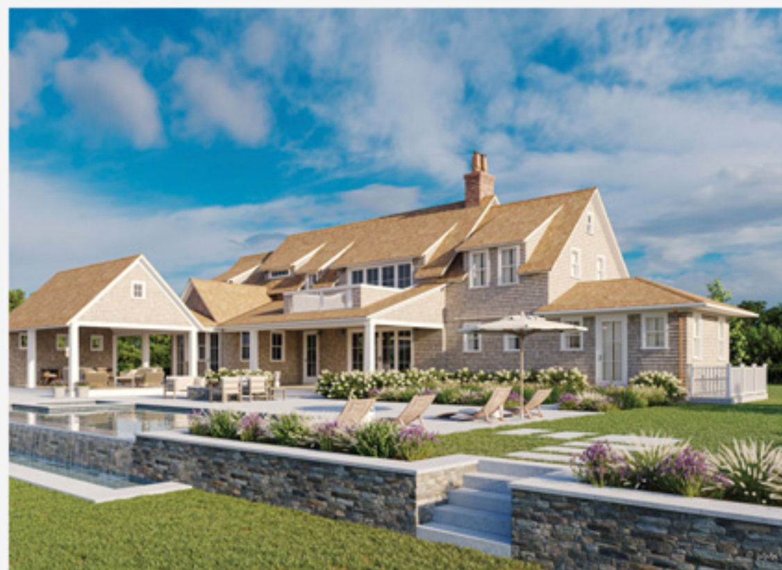
MONOMOY 41 Monomoy