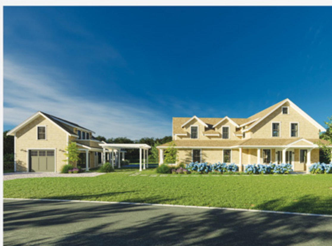
MID ISLAND 3 Maple Lane $7,395,000