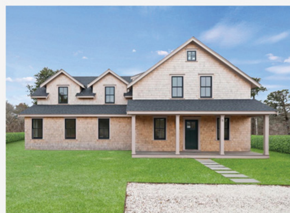
MID ISLAND 5 Fawn Lane $3,395,000