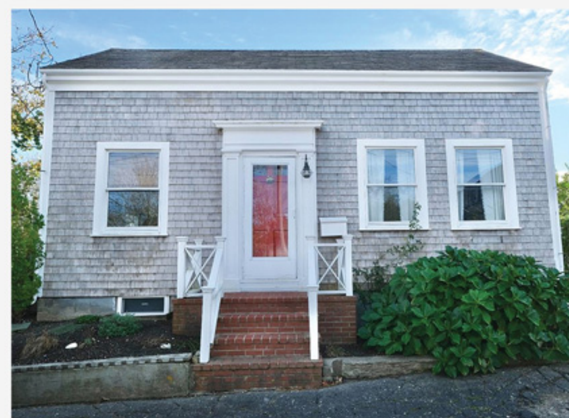
TOWN 12 New Street $1,995,000

19 Centre Street, Nantucket, MA 508.228.3202 www.jpfc.com