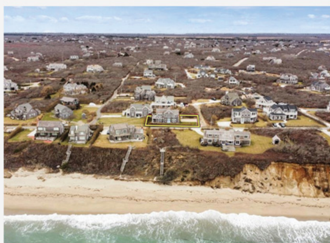
TOM NEVERS 24 Wanoma Way $4,995,000