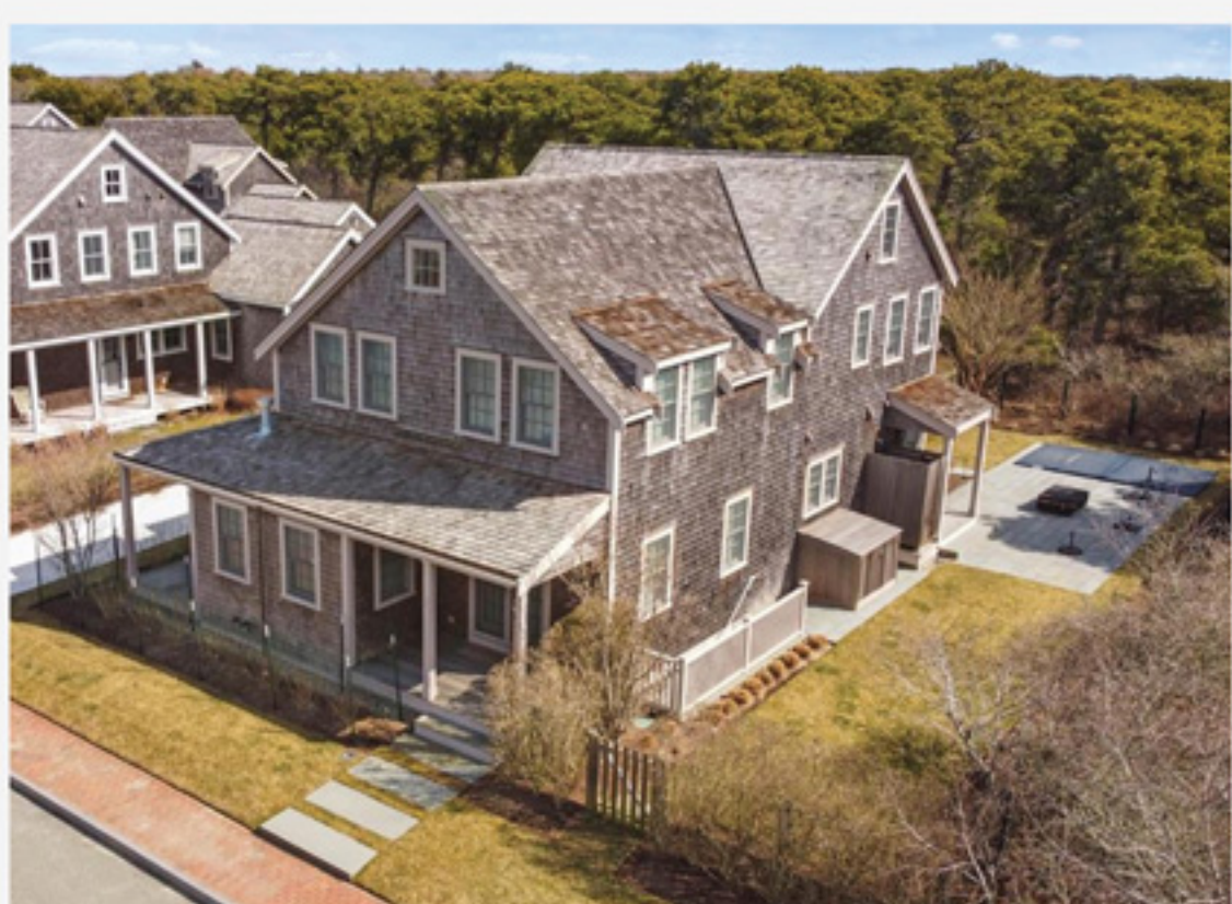
SURFSIDE 2 Blazing Star Road $3,895,000