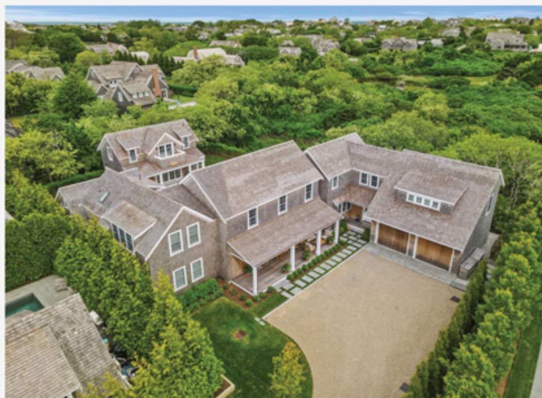
CLIFF 7 Pilgrim Road $10,995,000