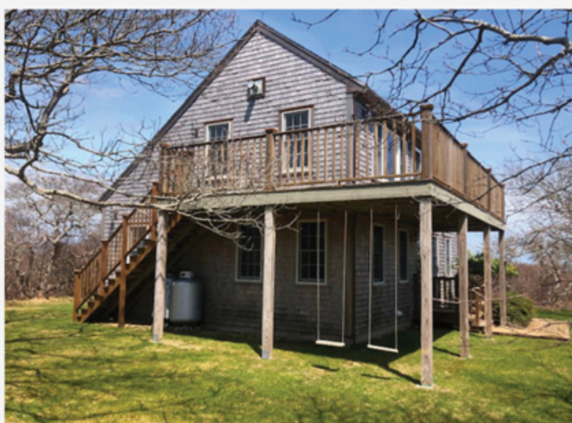
TOM NEVERS 9 Sandsbury Road $2,995,000