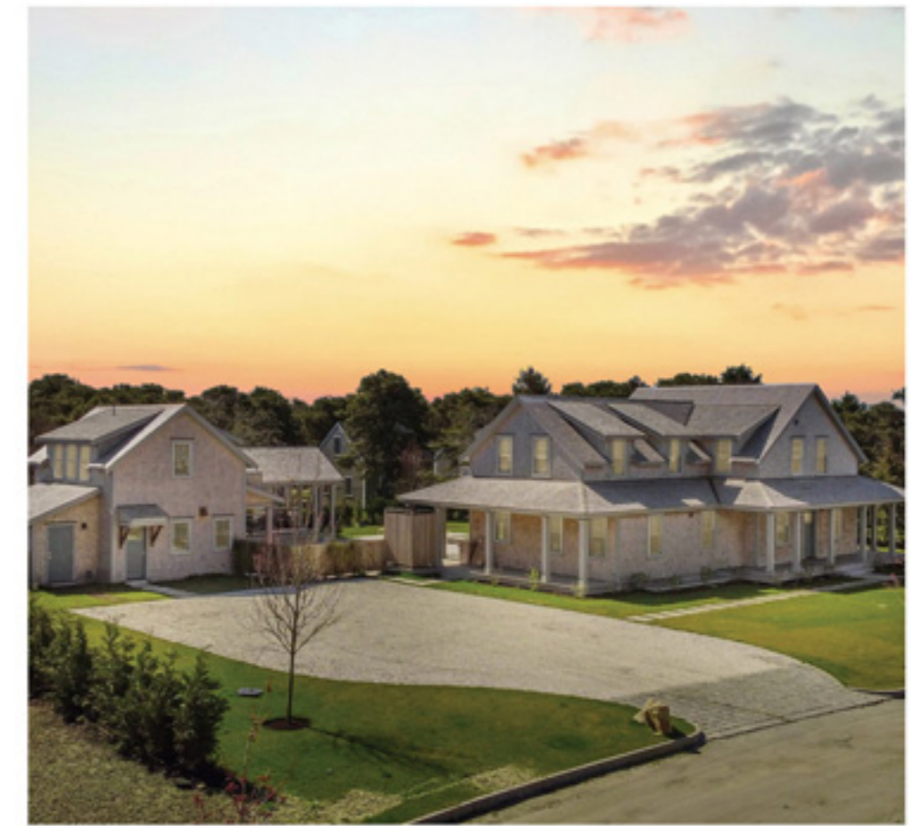
SURFSIDE 3 Maple Lane Listing Price: $7,495,000