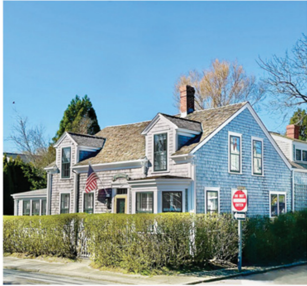
TOWN 101 Orange Street Listing Price: $3,500,000