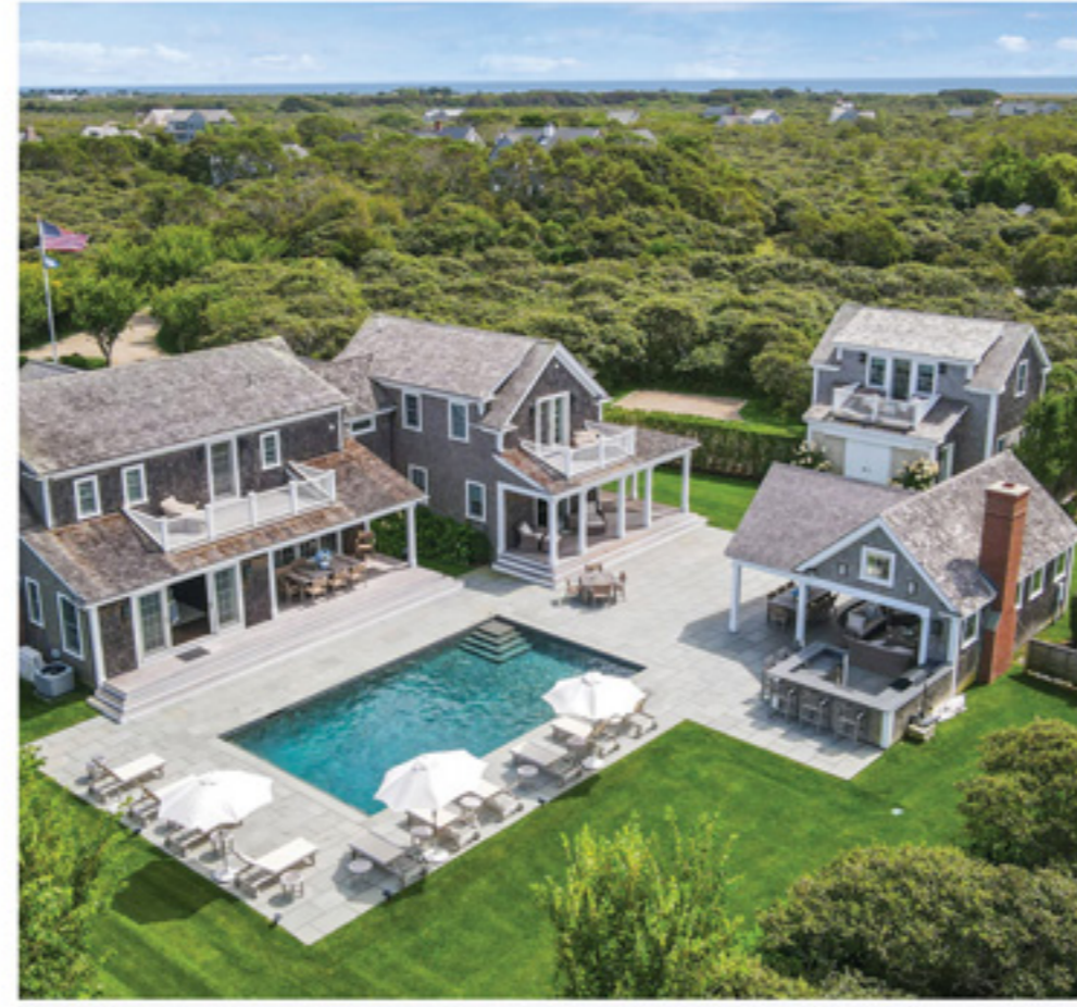
TOM NEVERS 24 Flintlock Road Listing Price: $13,888,000