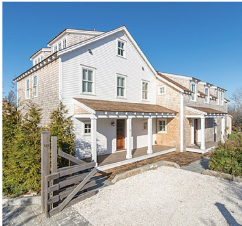
CLIFF 10 Old Westmor Farm Road Listing Price: $10,995,000