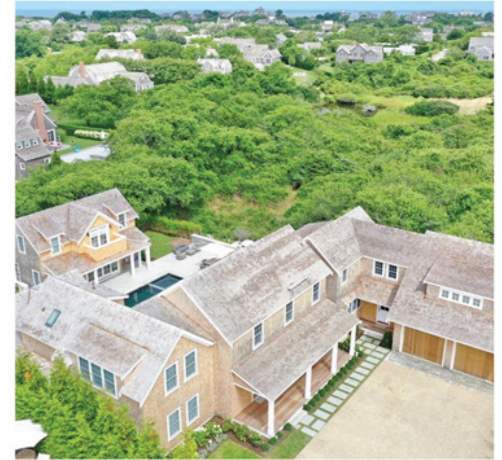
CLIFF 7 Pilgrim Road Listing Price: $10,995,000