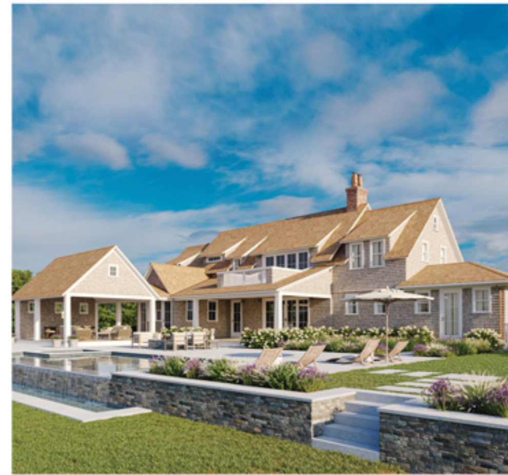
MONOMOY 41 Monomoy Road Listing Price: $12,990,000