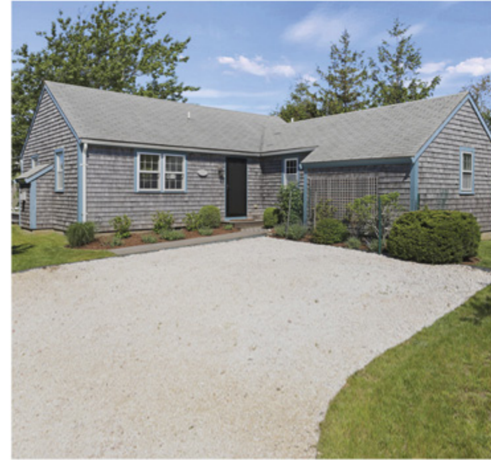
MADAKET 1 Arkansas Avenue Listing Price: $2,250,000