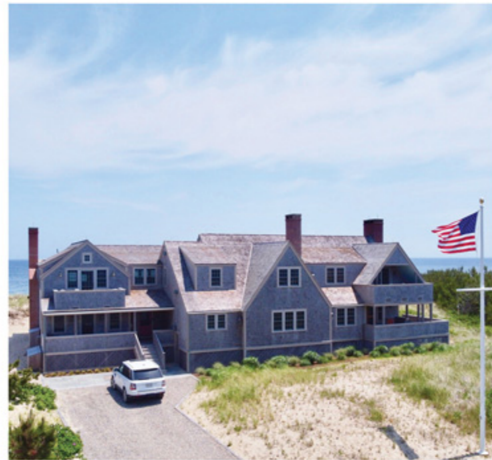
WAUWINET 143 Wauwinet Road Listing Price: $17,250,000