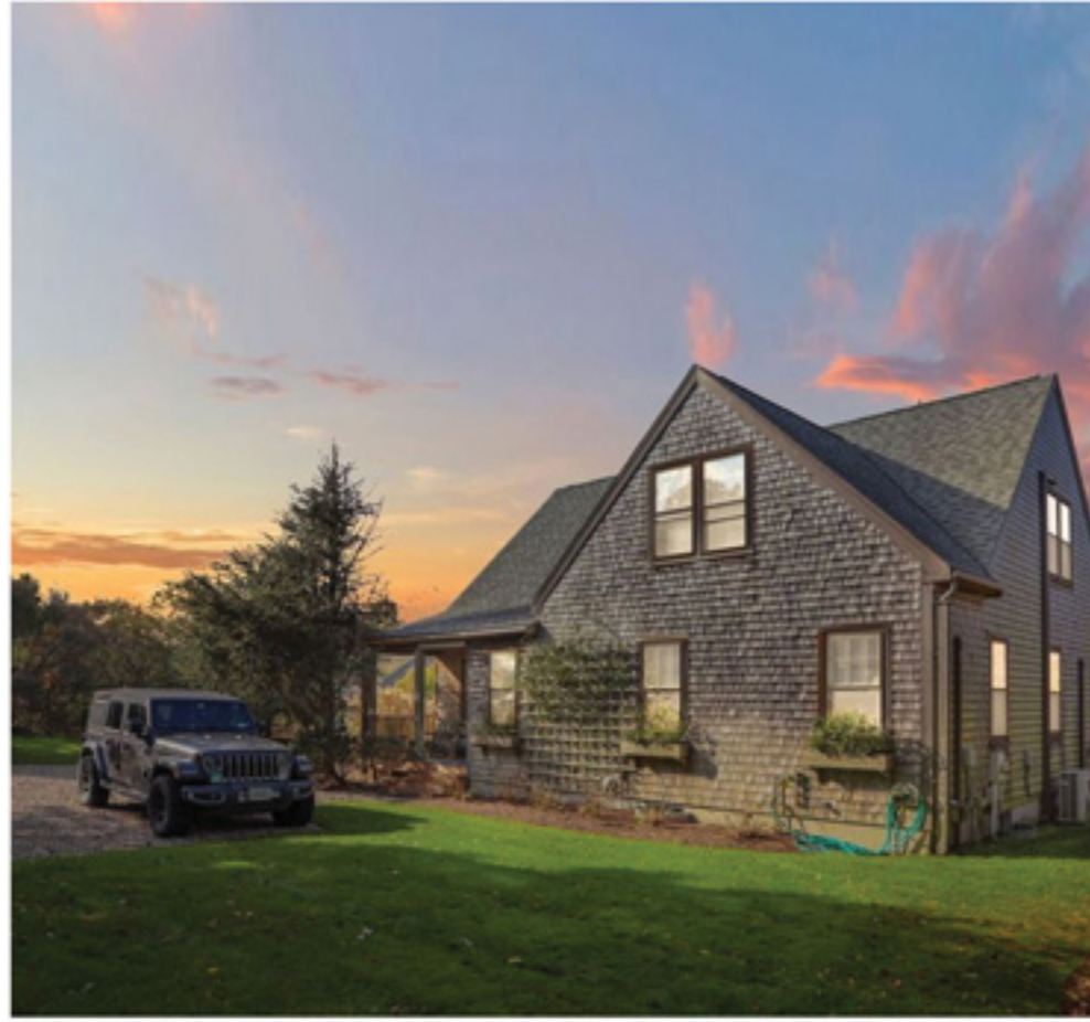
SURFSIDE 133 SURFSIDE ROAD Listing Price: $3,845,000