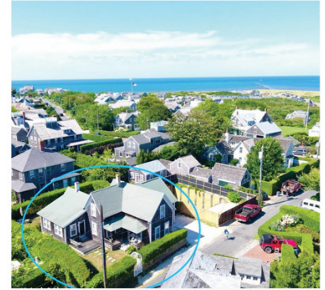
CLIFF 2 CABOT LANE # A Listing Price: $4,250,000