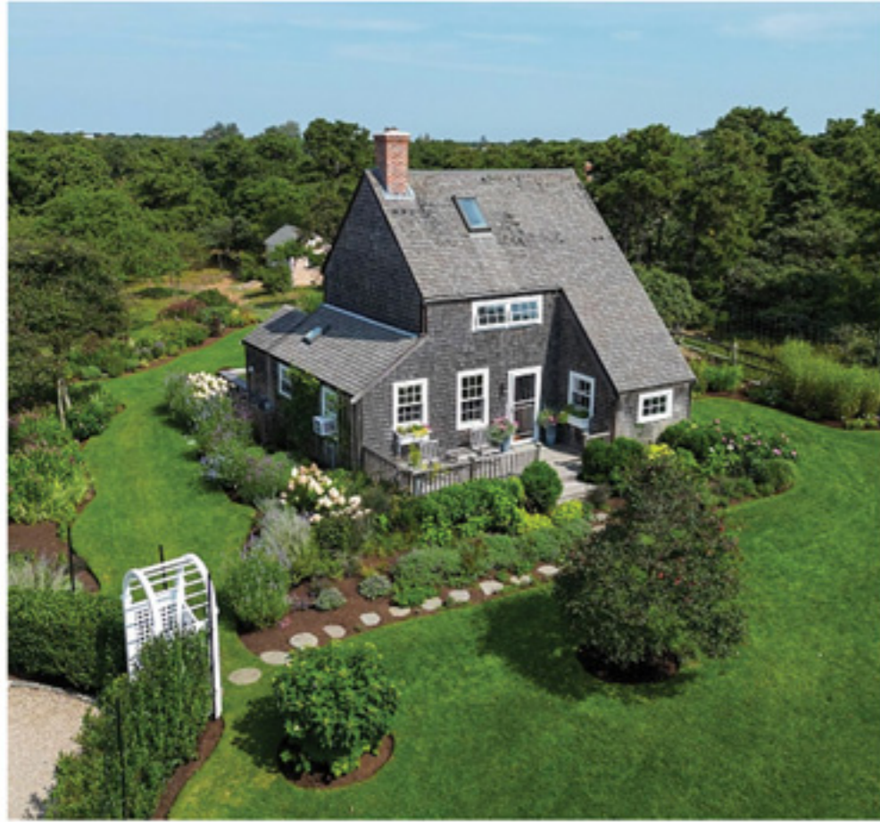
SURFSIDE 4 WEWEEDER AVENUE 4 beds / 2 baths Weekly Price: $7,000 – $13,000