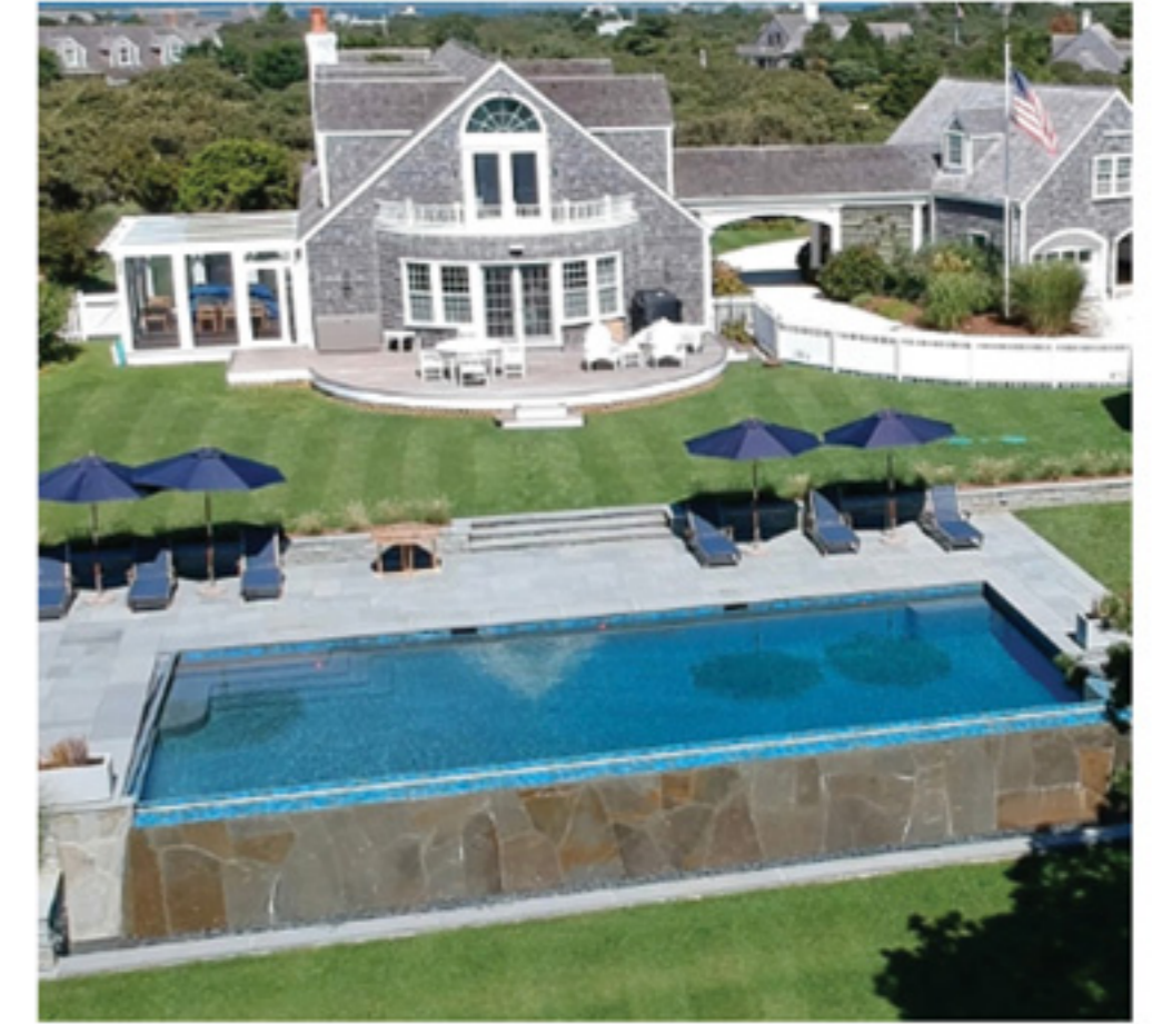
POLPIS 13 NORTH PASTURE LANE 6 beds / 4 bath 1 half Weekly Price: $35,000